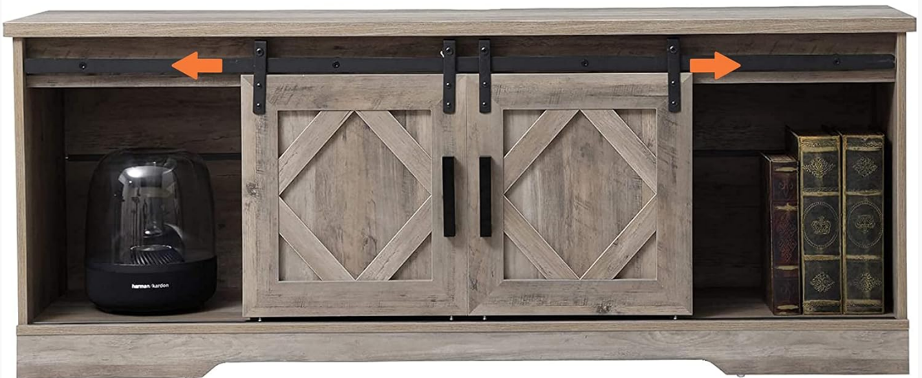
Image: A view of the TV stand highlighting the sliding barn doors, showing how they can conceal storage spaces.

Sliding doors conceal a storage space to keep small items organized and out of sight.