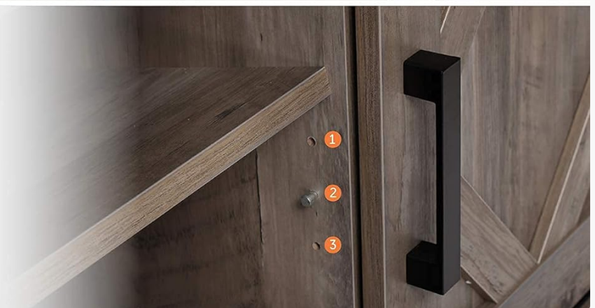
Image: Close-up showing the cable management holes, adjustable shelf positions, and moisture-proof base design.