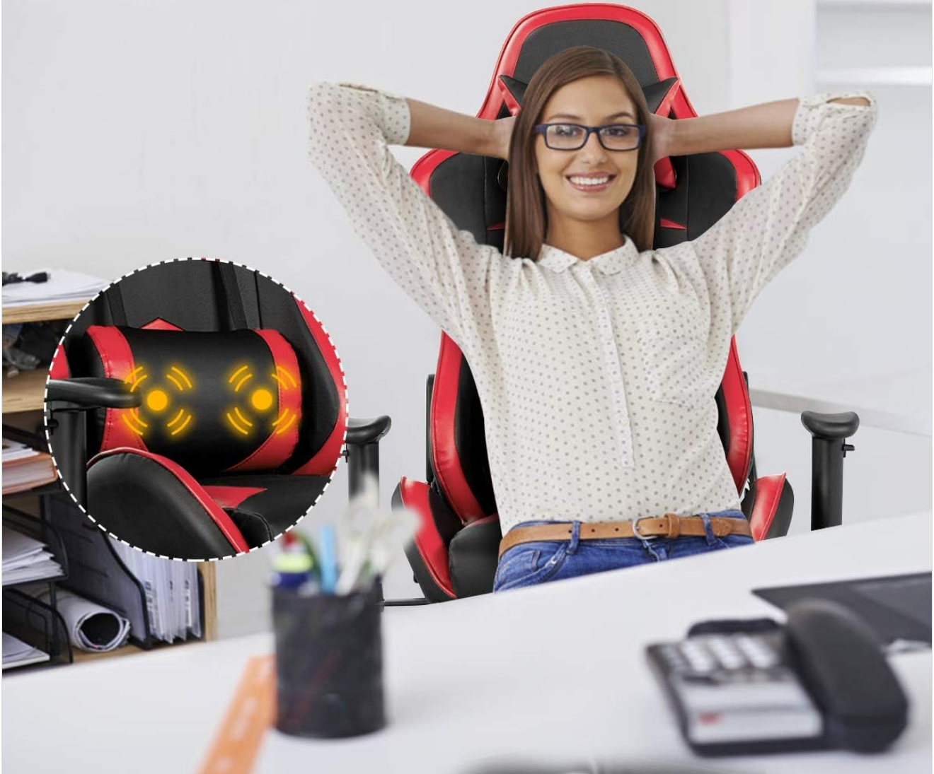
Image: A person relaxing in the Goplus Gaming Chair, highlighting the lumbar massage pillow with its USB interface.

Easy-operated One-button Design & USB Interface