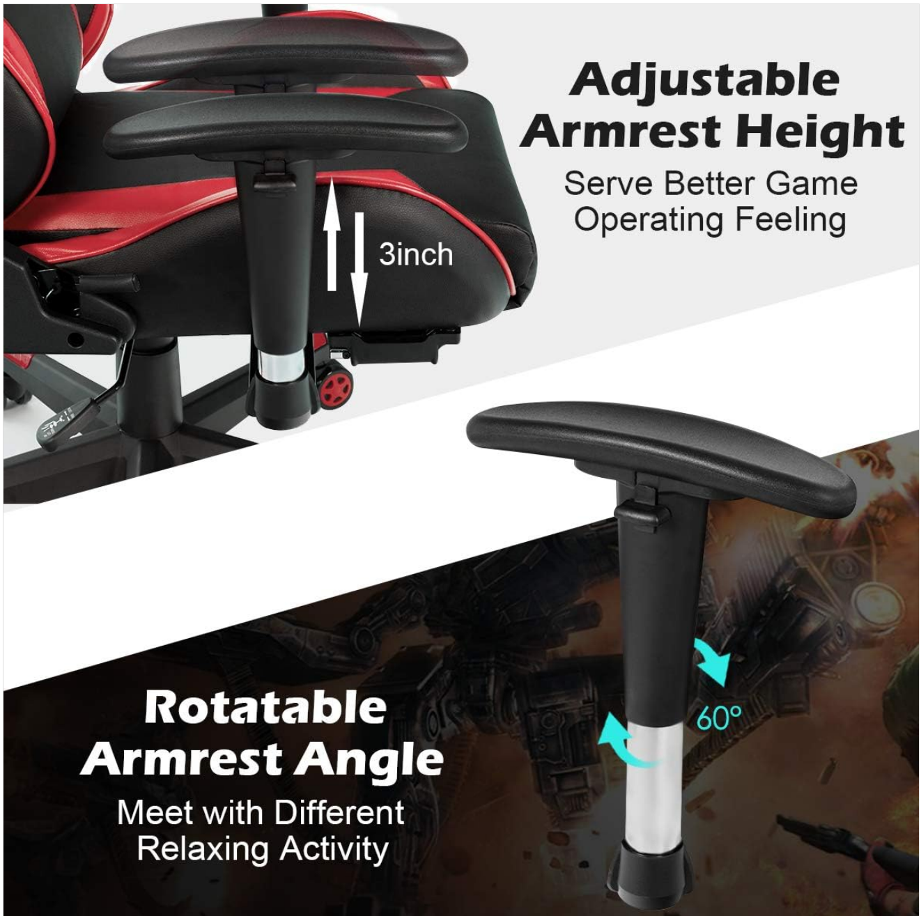
Image: Close-up view of the Goplus Gaming Chair's armrest, highlighting its 3-inch height adjustment and 60-degree rotatable function.