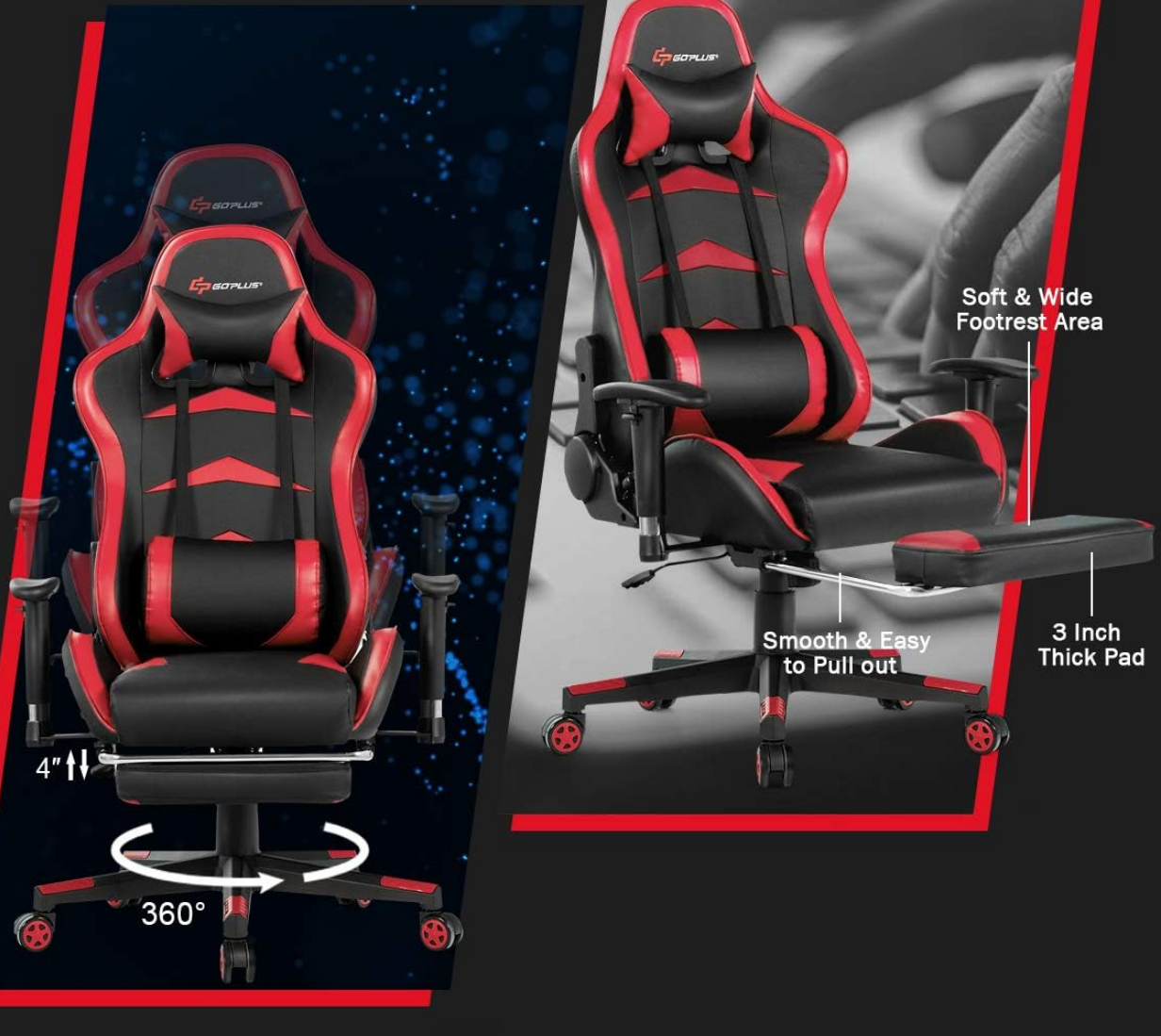
Image: The Goplus Gaming Chair with its footrest extended, demonstrating its retractable feature.