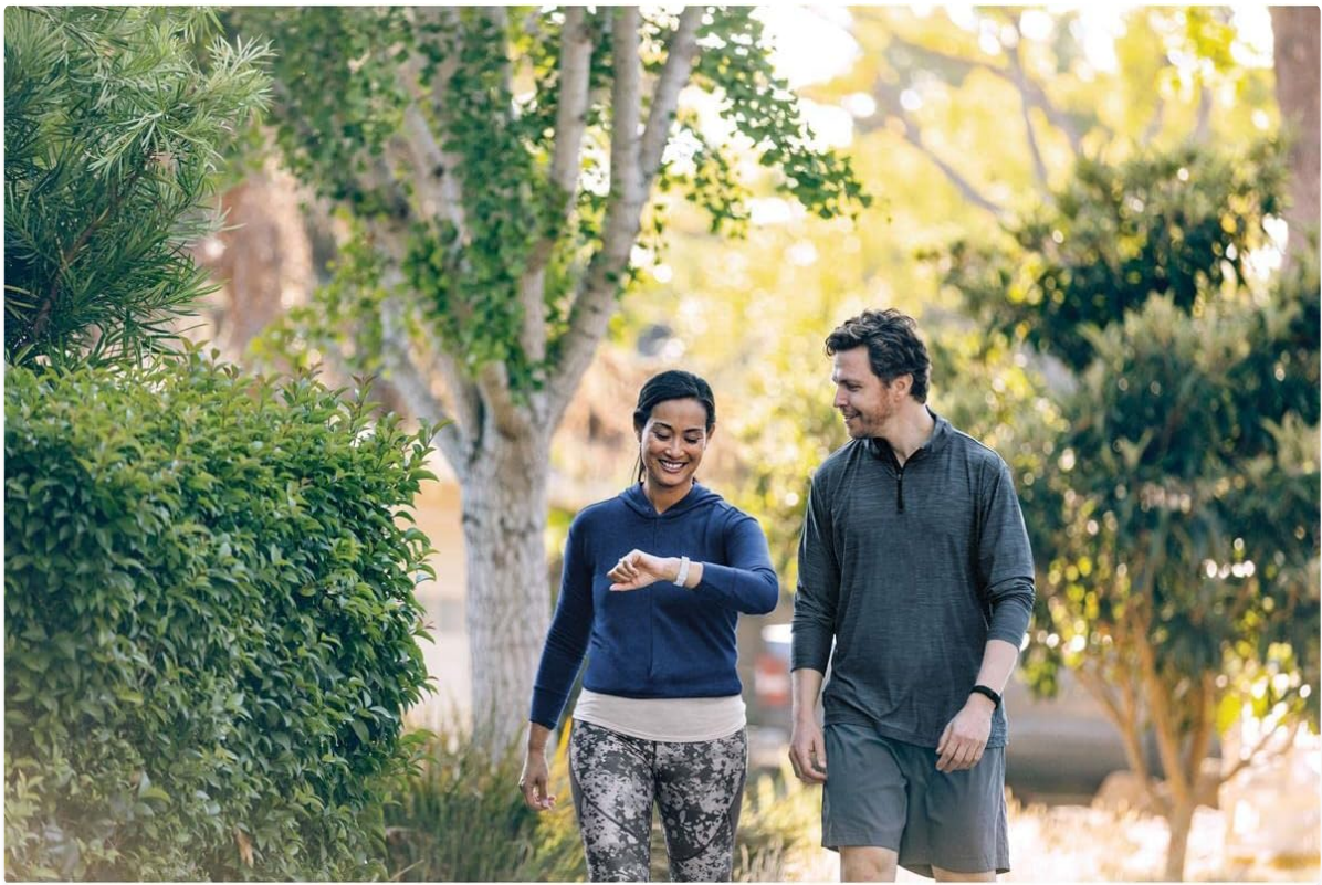
Image: Two individuals walking outdoors, one of whom is wearing the Fitbit Inspire 2, demonstrating its use during daily activity.