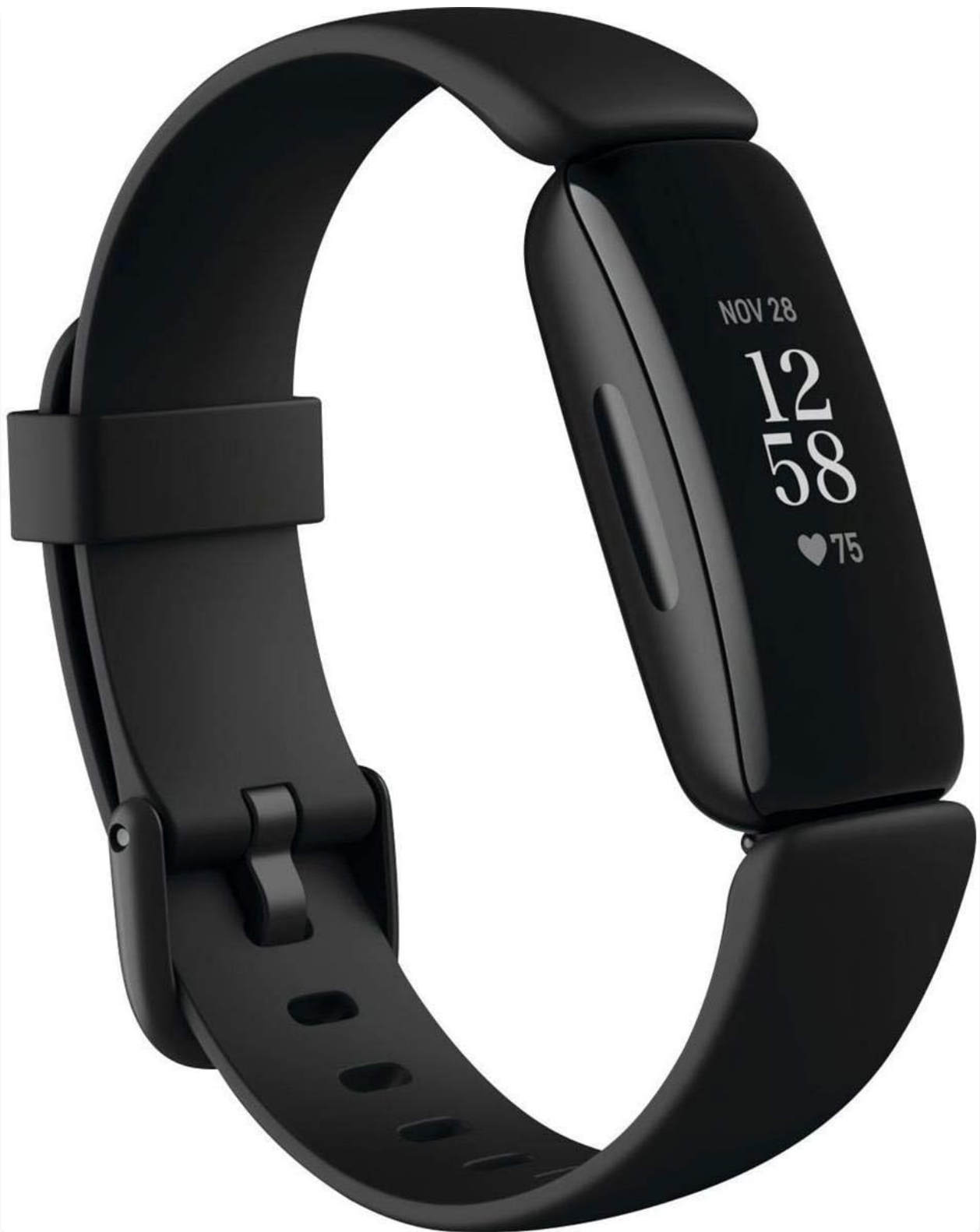
Image: The Fitbit Inspire 2 tracker shown with both the small and large band sizes included in the package.