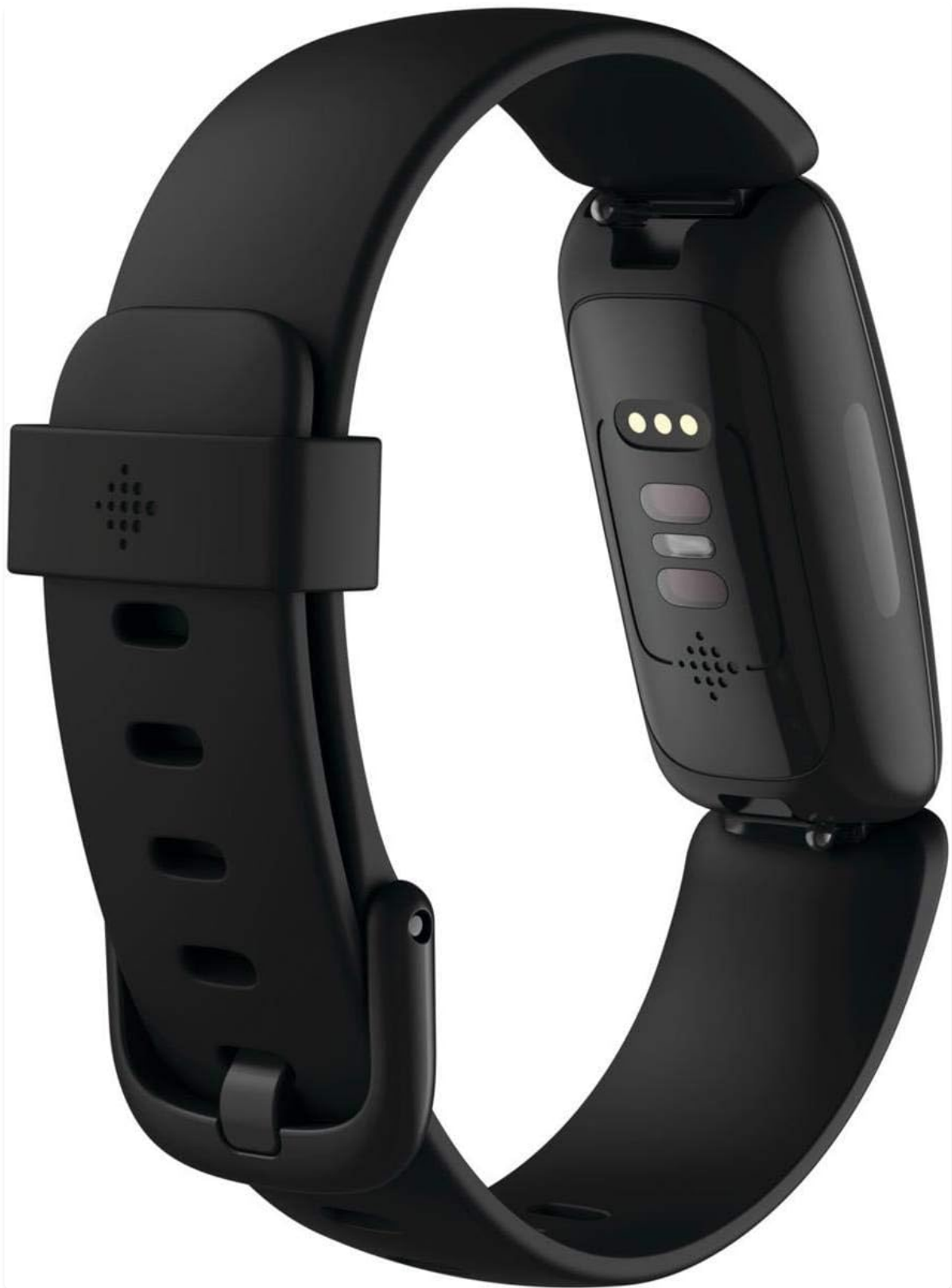
Image: The underside of the Fitbit Inspire 2, highlighting the optical heart rate sensors.