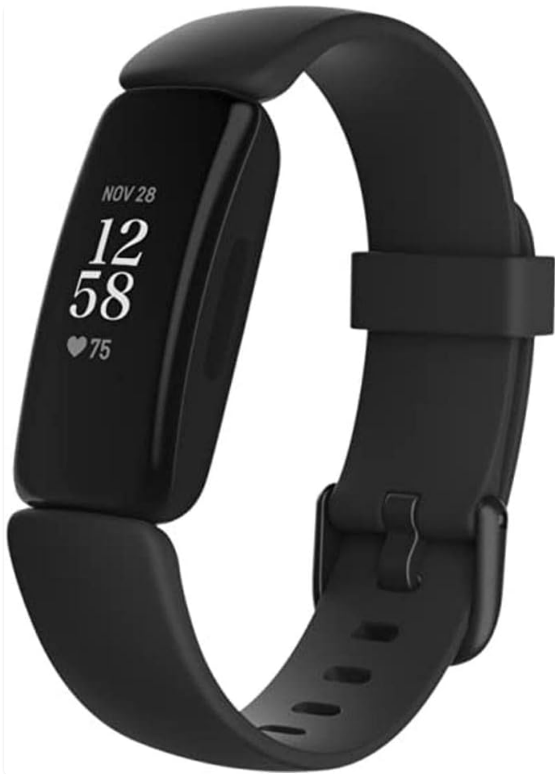
Image: Front view of the Fitbit Inspire 2 Health & Fitness Tracker in black.