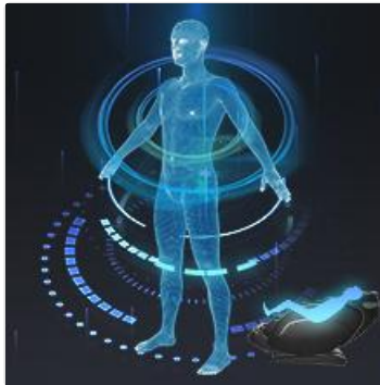
Image: Illustration of the body scan technology used by the massage chair to detect shoulder position.

After plugging in the chair, power it on using the remote control. The chair will perform an automatic shoulder detection scan to customize the massage experience to your body shape.