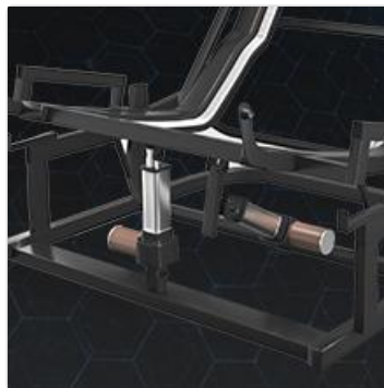
Image: Diagram illustrating the dual electric linear actuators that enable separate leg and back adjustments.

Image: Close-up view of the massage chair's waist area, indicating the lumbar heating function.