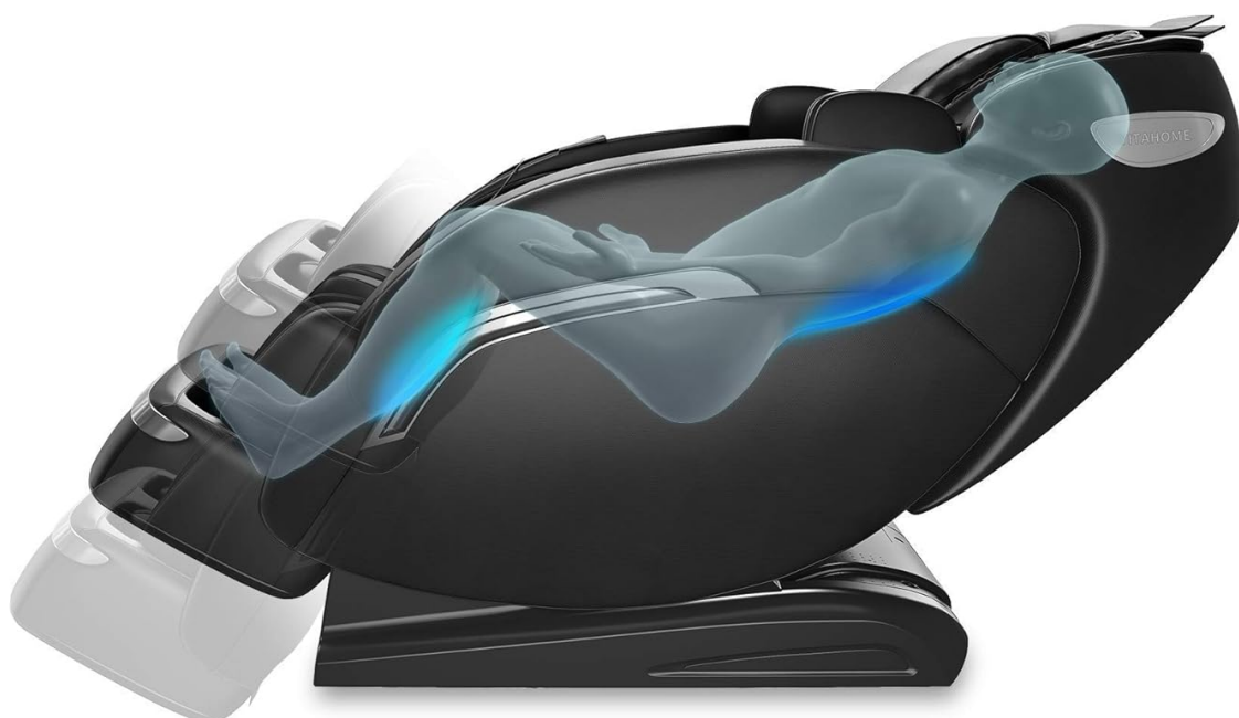
Image: Illustration of the two zero gravity recline positions and the minimal wall clearance required for the chair.

Double linear actuators allow for separate leg and back adjustments to achieve a luxury massage experience.