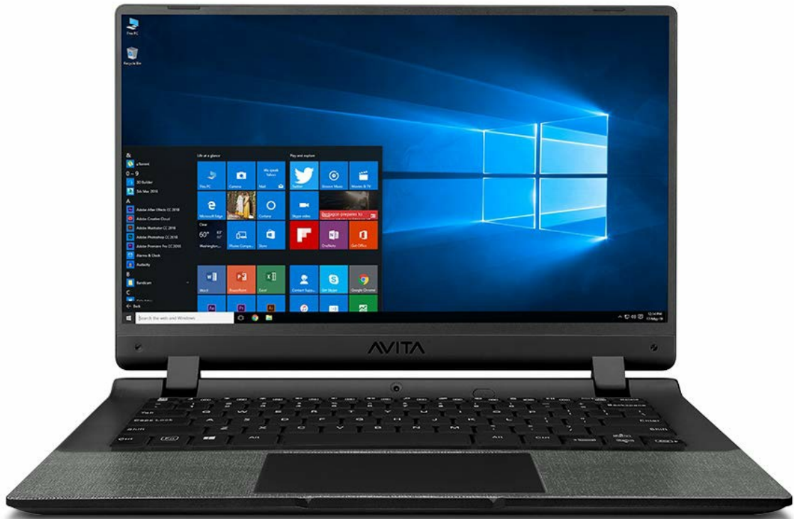
Figure 2.1: AVITA Essential Laptop (Matt Black) with screen and keyboard visible.