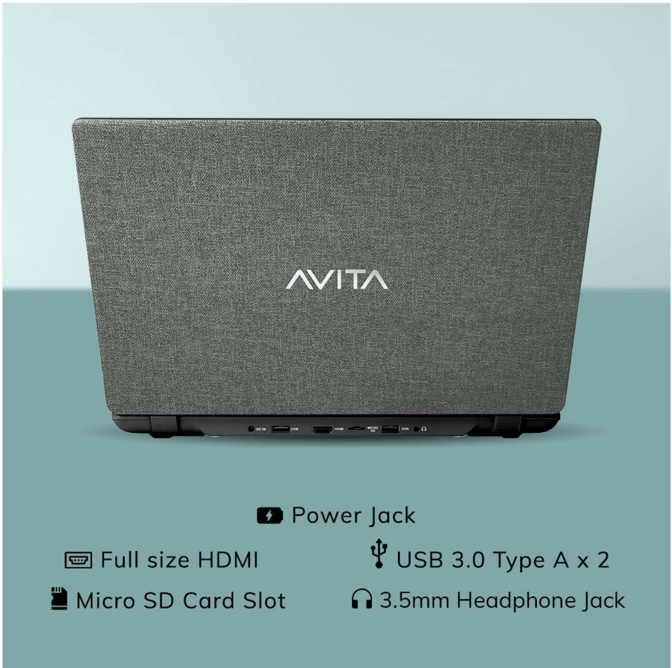
Figure 2.3: Rear view of the laptop detailing the available ports for external devices and power.