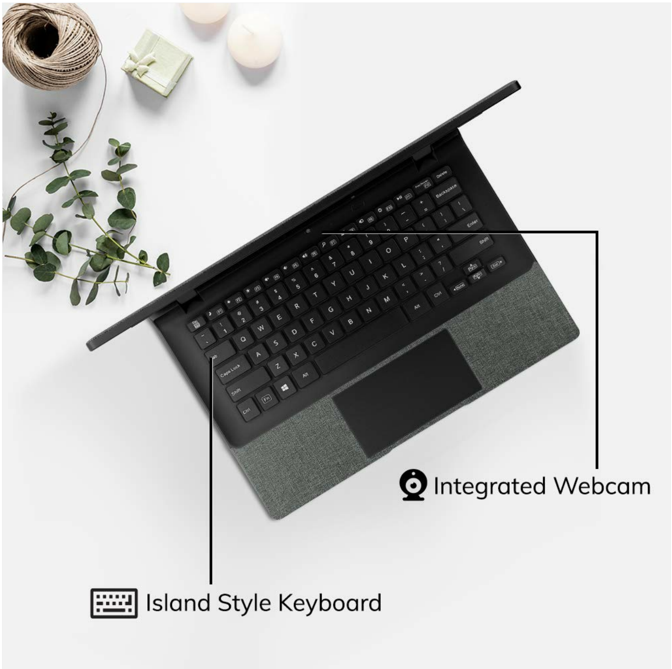
Figure 2.4: Top-down view of the laptop's island-style keyboard and integrated webcam.