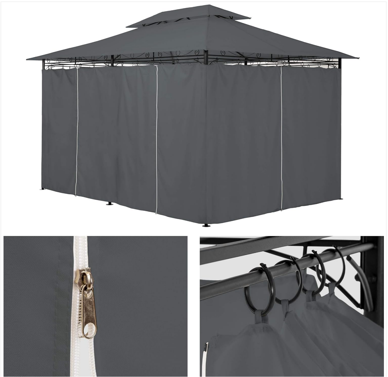
Figure 4: Detailed view showing the zipper closure on a side panel and the attachment rings that slide onto the pavilion's frame. This highlights the mechanism for securing and opening the side walls.