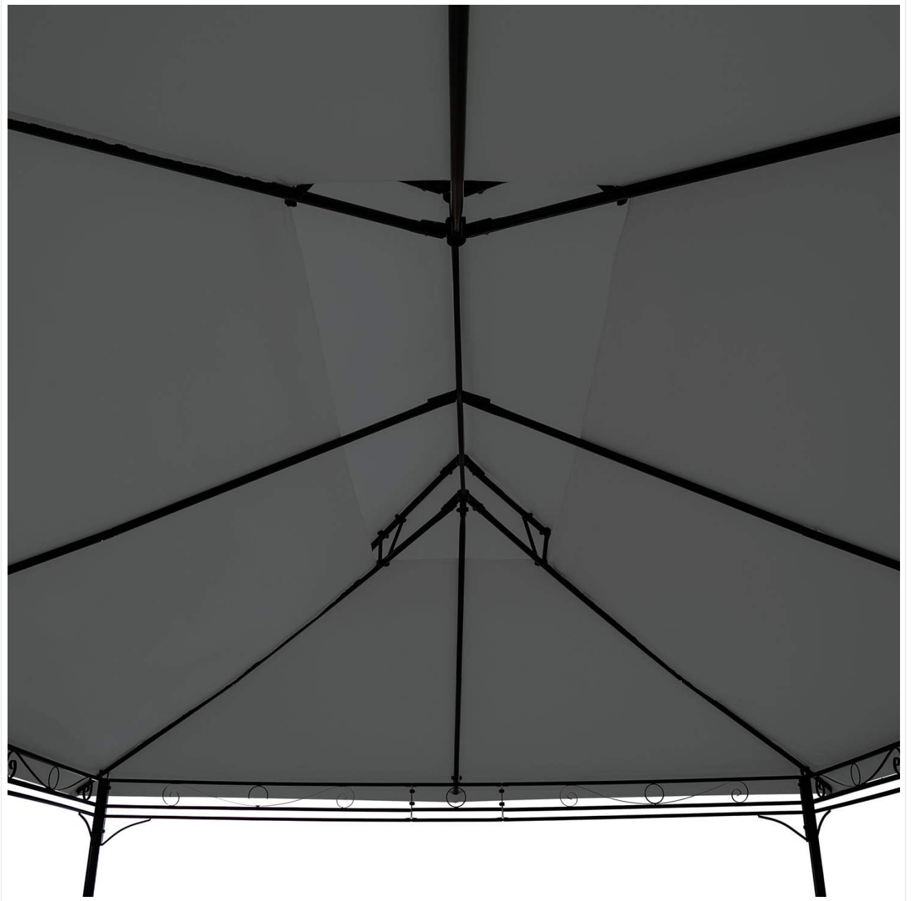
Figure 3: An interior view looking up at the pavilion's roof structure, showing the metal crossbeams and the underside of the canopy. This illustrates how the fabric is supported by the frame.