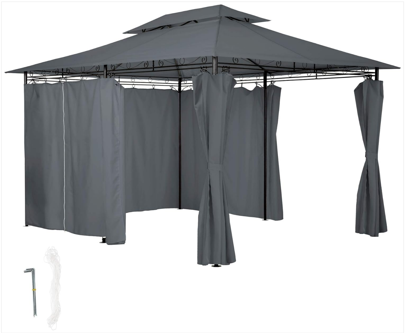
Figure 1: Fully assembled TecTake Luxury Garden Pavilion with side panels. The pavilion features a grey canopy and side walls, supported by a dark metal frame. Ground stakes and ropes are visible in the foreground, indicating secure anchoring.