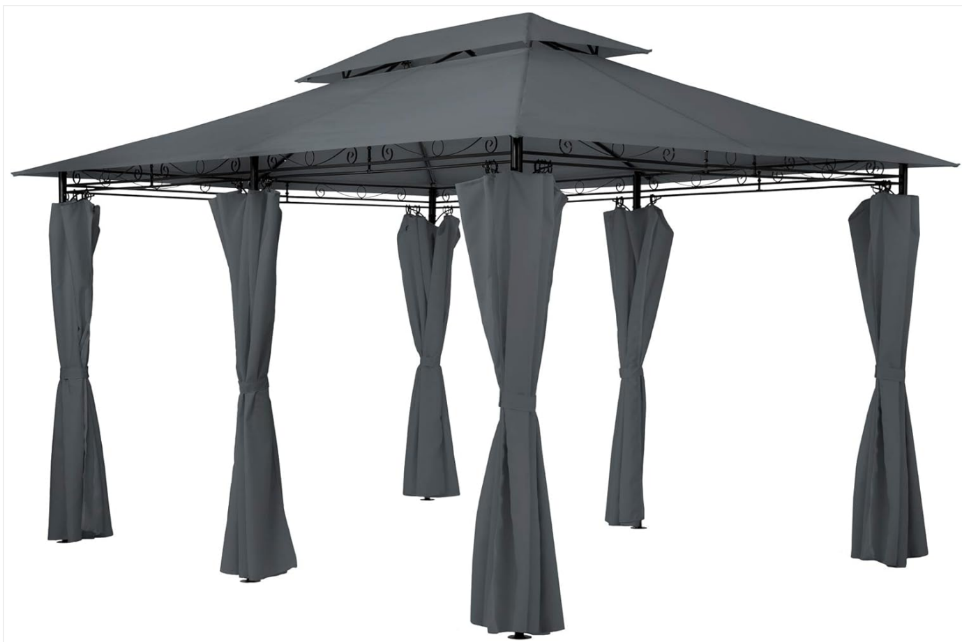
Figure 6: The garden pavilion shown with its side panels tied back to the support poles, demonstrating an open configuration for increased airflow and accessibility.