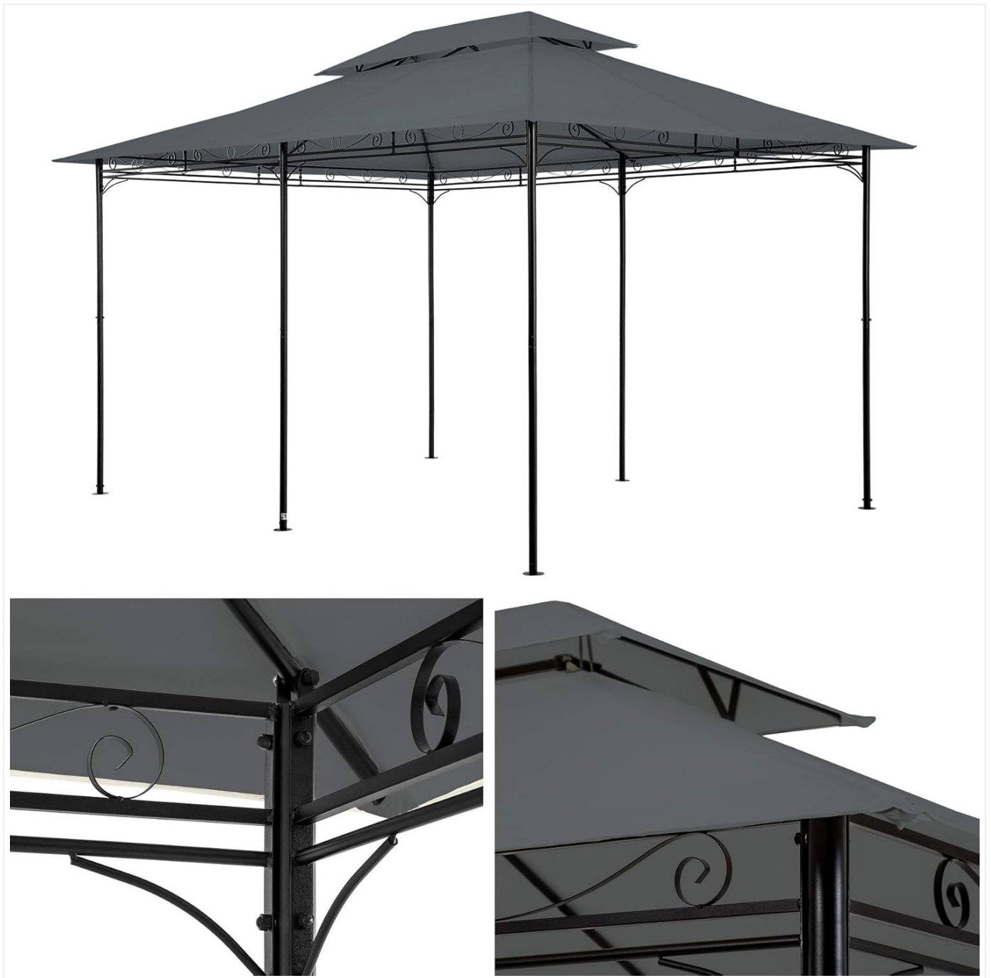
Figure 2: The robust metal frame of the pavilion, showing the main support poles and the upper frame structure with decorative elements. This image highlights the foundational components before the canopy and side panels are attached.