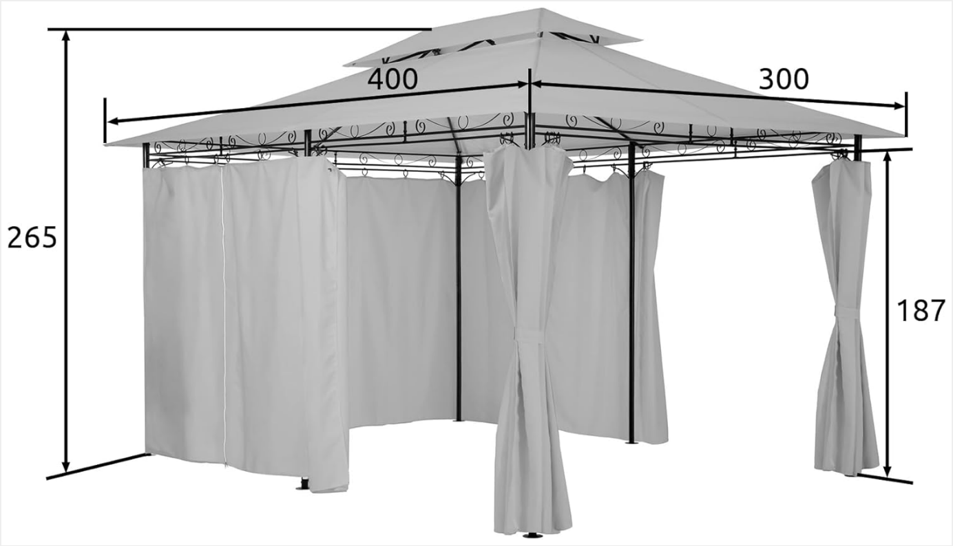
Figure 7: Technical diagram illustrating the key dimensions of the pavilion, including length (400 cm), width (300 cm), overall height (265 cm), and passage height (187 cm).