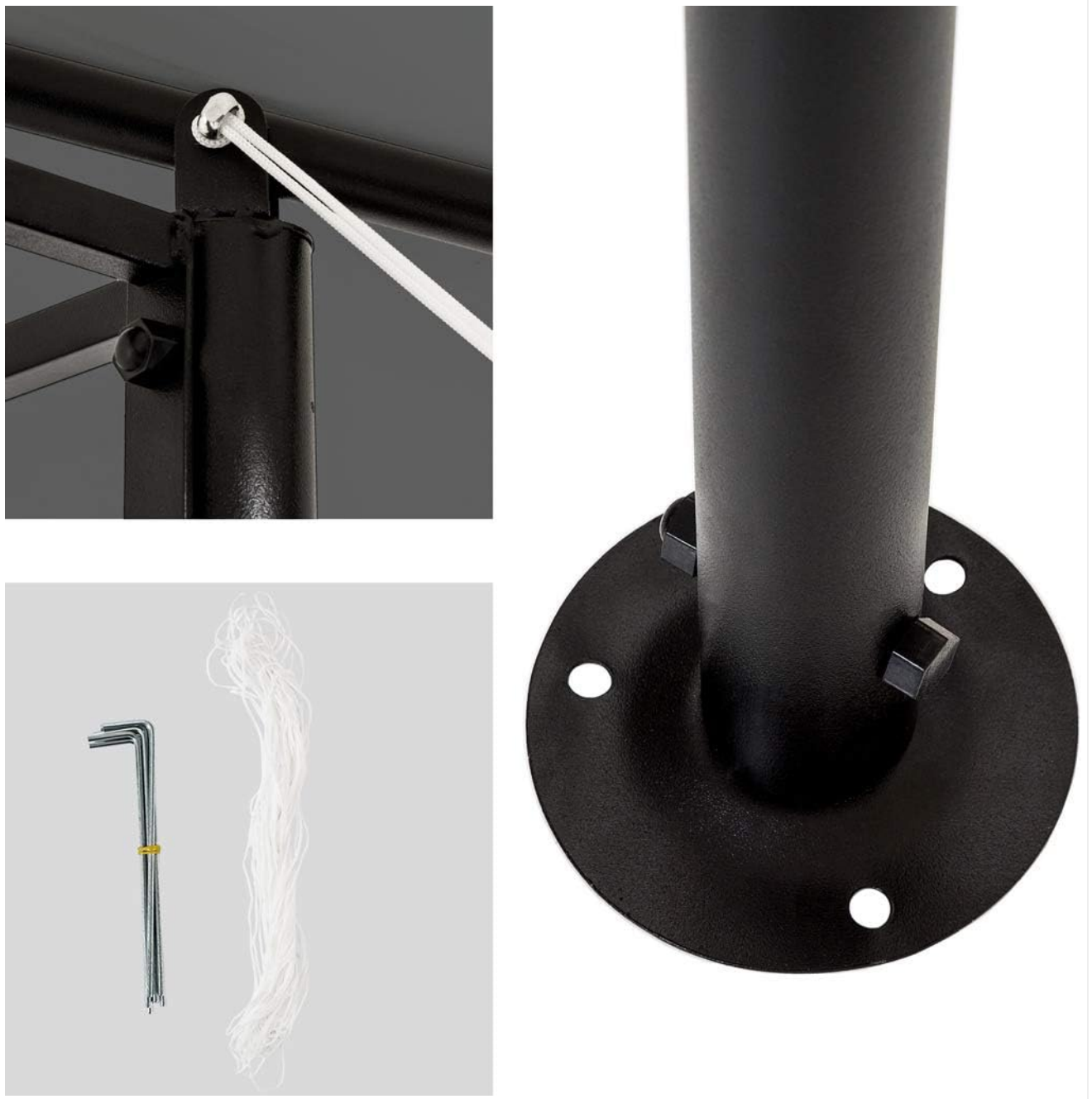
Figure 5: Close-up of a pavilion base foot, along with the included ground stakes and rope. This illustrates the components used for anchoring the pavilion securely to the ground.