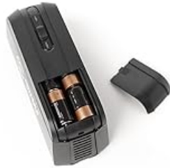
Image: Step 1 - Insert 4 C batteries into the designated compartment.