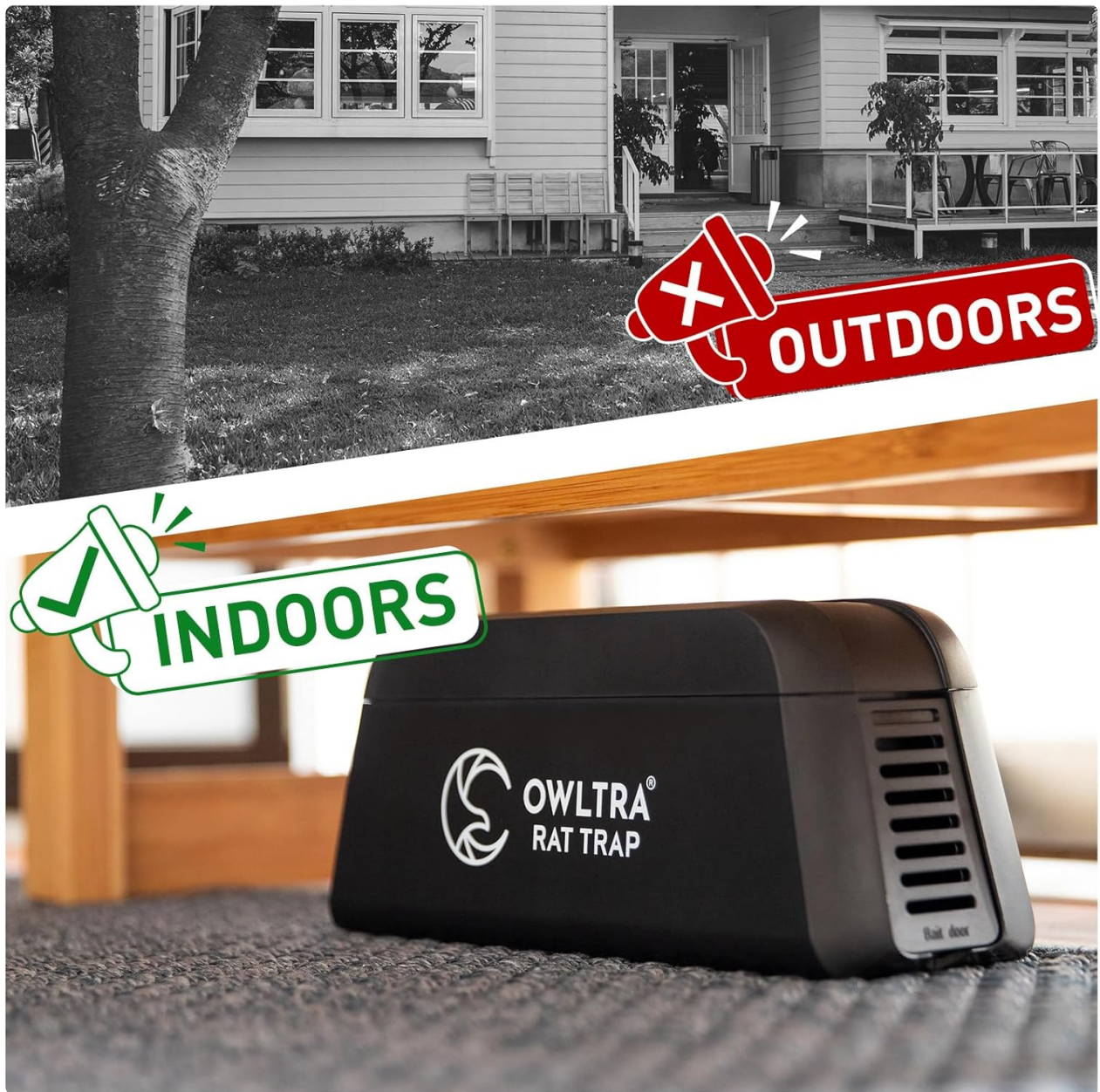
Image: The trap is designed for indoor use and should be placed along a wall.