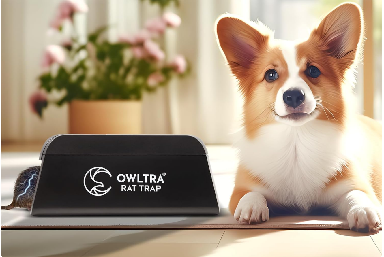
Image: The OWLTRA Electric Rat Trap features a pet-safe dual infrared sensor, designed to prevent accidental activation by small pets.