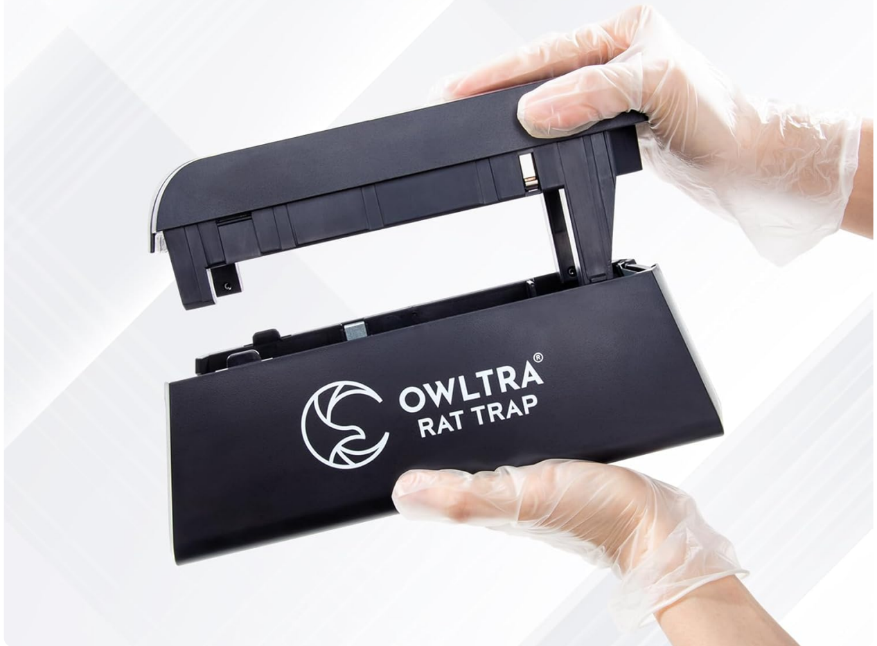
Image: The magnetic latch design allows for no-mess, no-touch disposal of captured rodents.