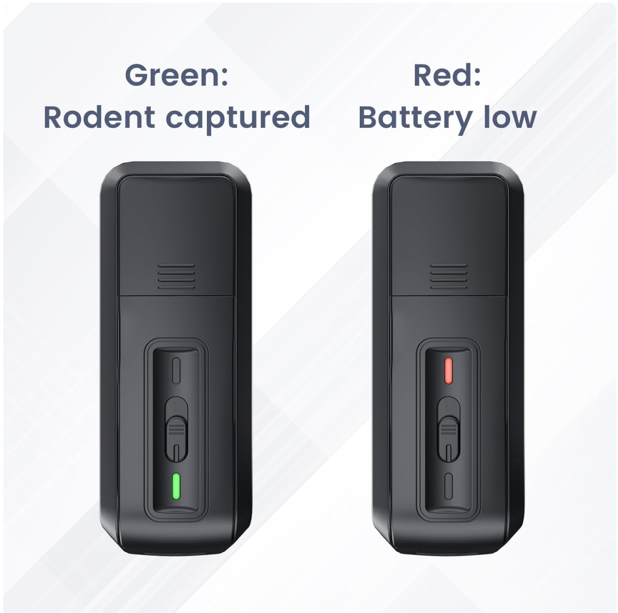
Image: The LED indicator lights provide clear status updates for the trap.