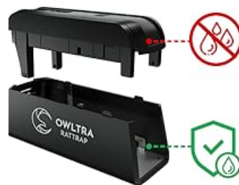
Image: Proper cleaning of the trap ensures continued effectiveness.

After disposal, clean the interior and exterior chambers. Use warm water or a hydrogen peroxide topical solution with a soft-bristle brush. Ensure no water gets into the electronic top part. Thoroughly air dry all components before reassembling. The trap will not work properly if wet.