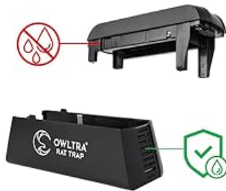
Image: Step 2 - Apply bait to the designated area inside the trap.

Open the bait door located at the back of the trap. Place a pea-sized amount of high-protein bait, such as peanut butter or chicken feed, onto the bait area. Use a toothpick or cotton swab to avoid transferring human scent. Close the bait door securely.