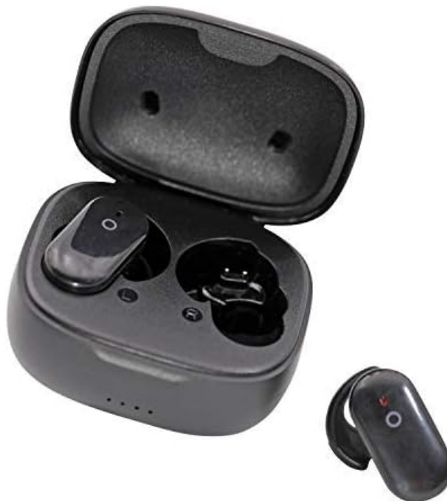
Image: The Billboard True Wireless Earphones shown inside their open charging case, with one earphone removed.

Familiarize yourself with the components of your Billboard True Wireless Earphones.