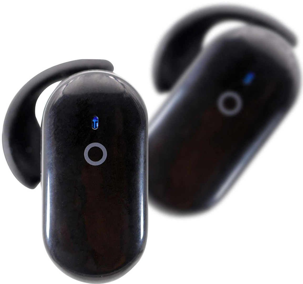
Image: A close-up view of one earphone, highlighting the circular touch control area and the small LED indicator light.