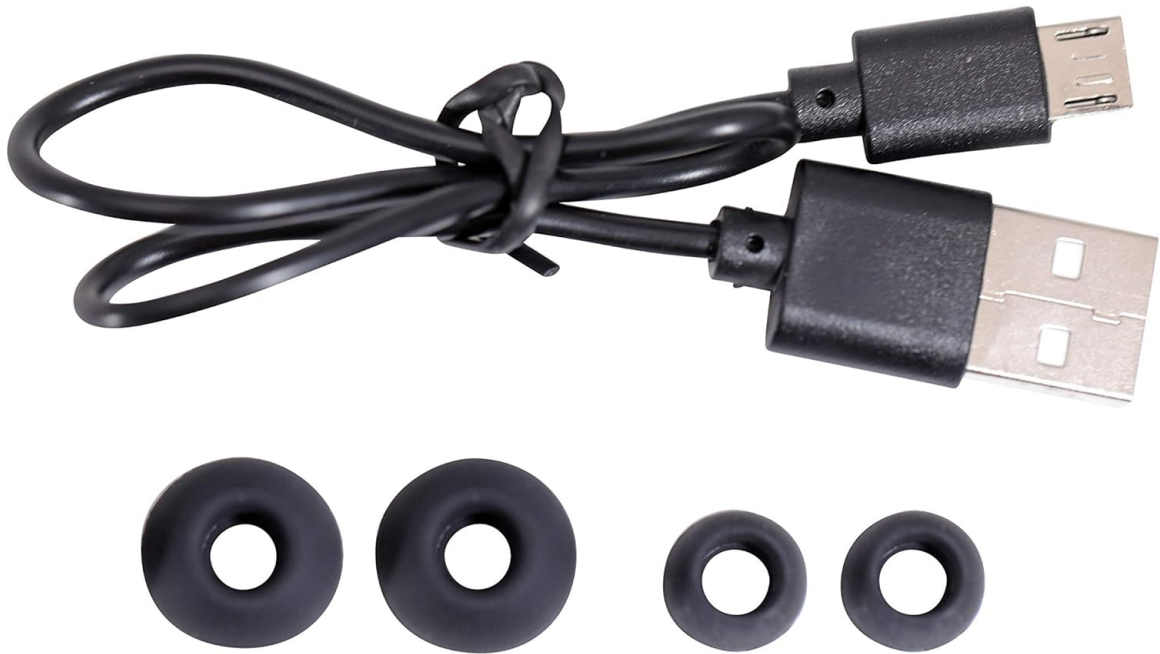
Image: Included accessories, featuring the USB charging cable and different sizes of ear tips for a customized fit.