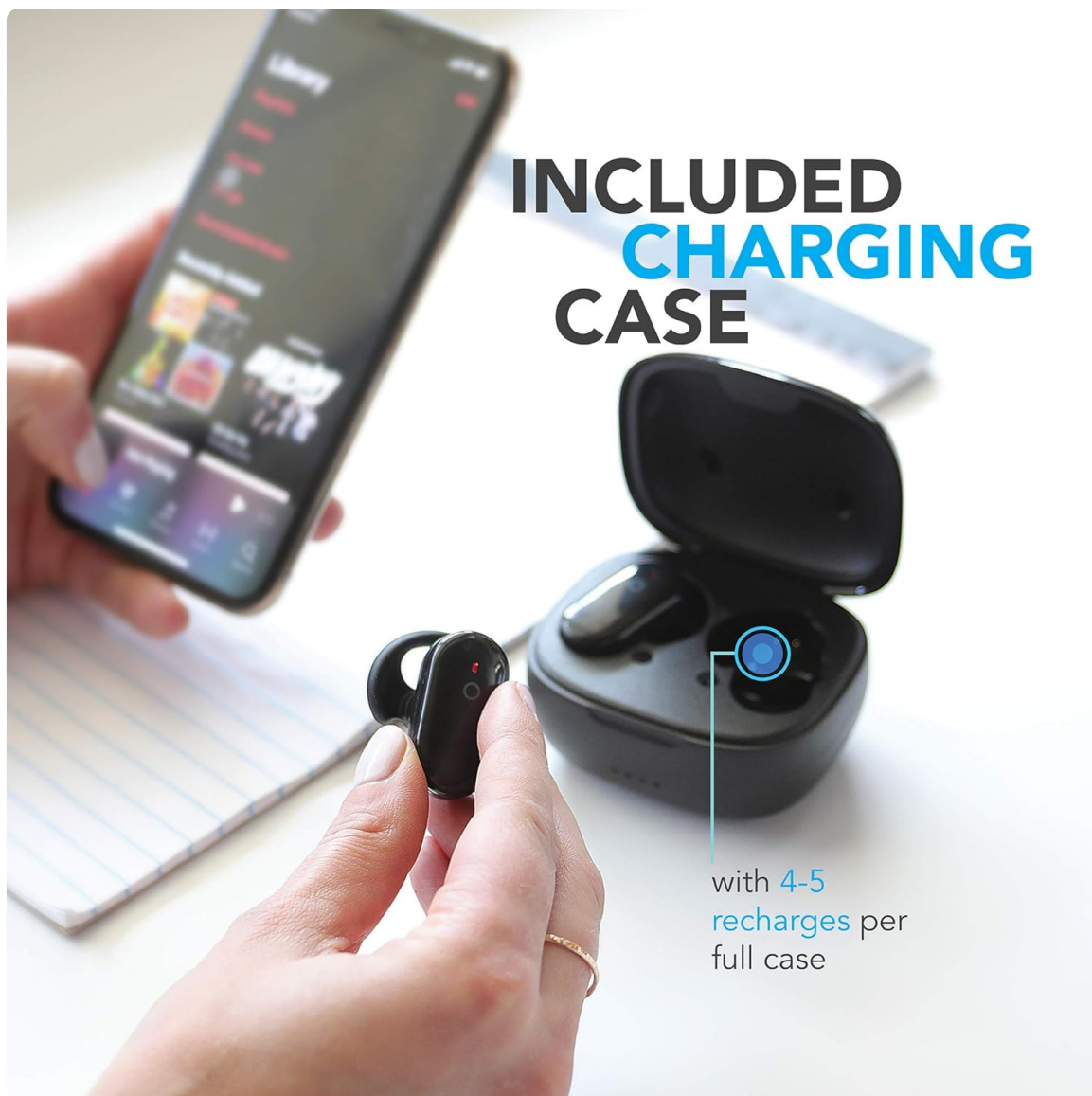
Image: A hand holding one earphone, positioned near the open charging case, illustrating how to place the earphone for charging.