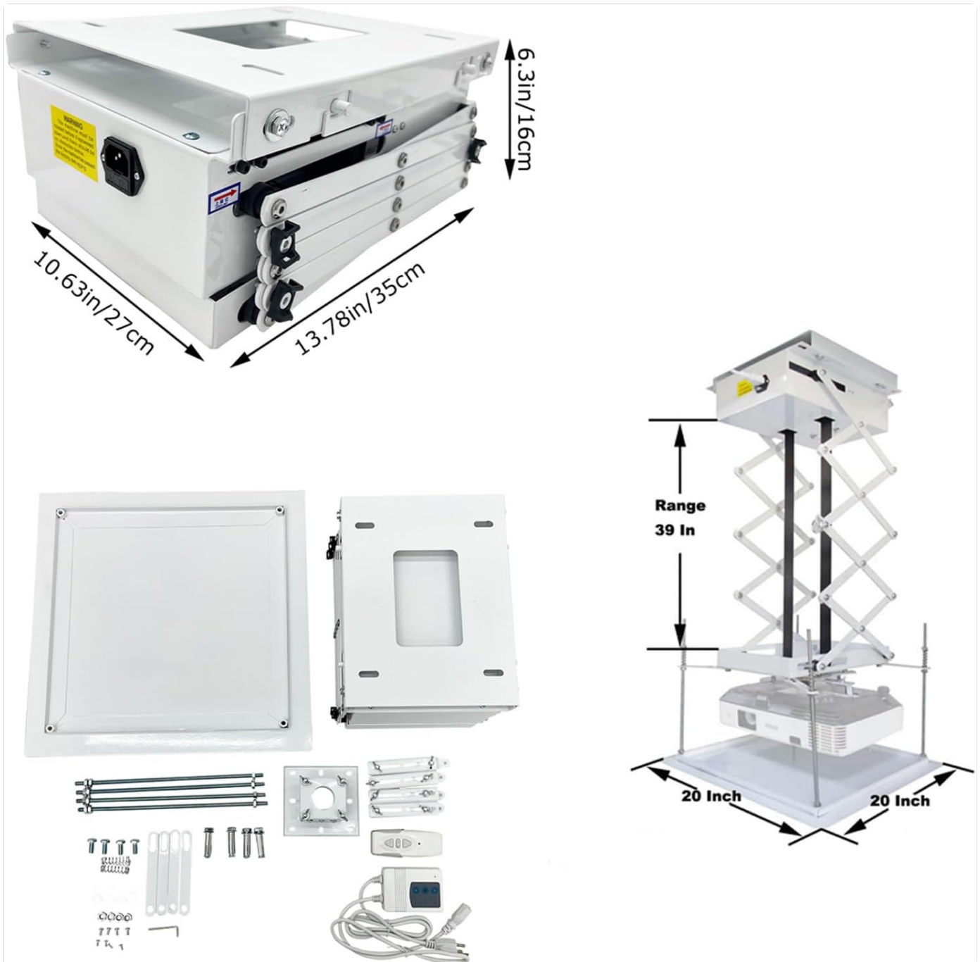
An image displaying the key dimensions of the projector lift unit and an exploded view of its various components and mounting hardware.