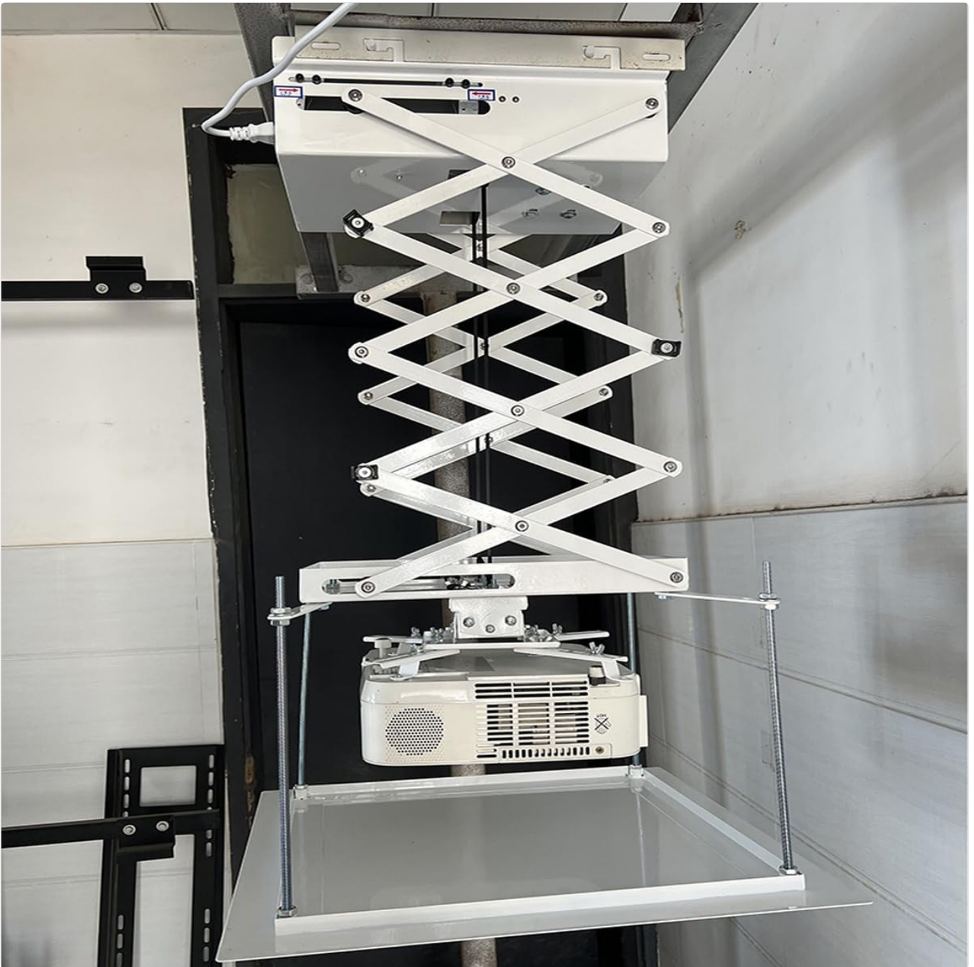
A photograph of the projector lift installed and extended from a ceiling, ready for projector attachment.