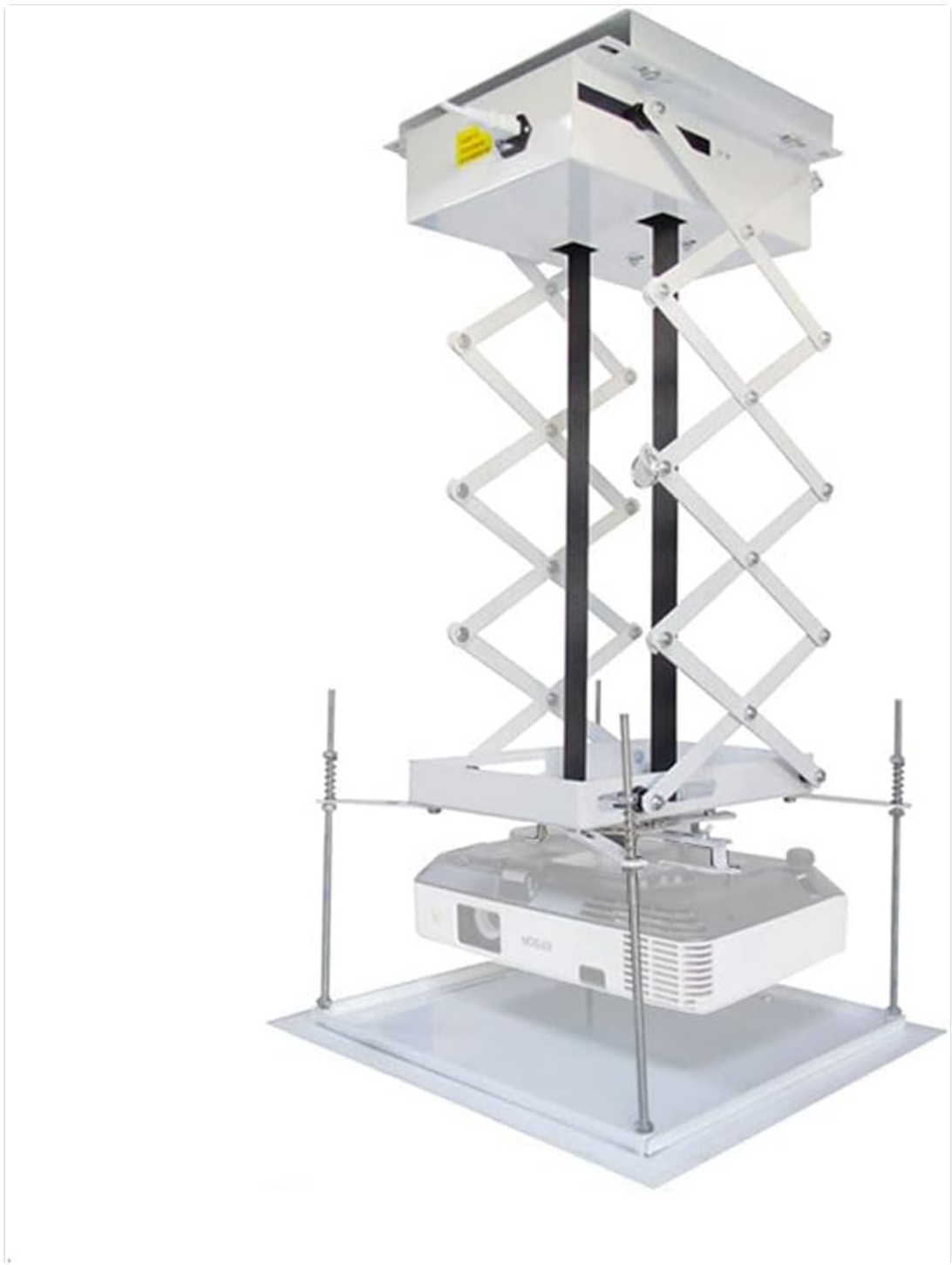
An image showing the INTBUYING Electric Projector Lift fully extended from the ceiling, with a projector attached to its base.