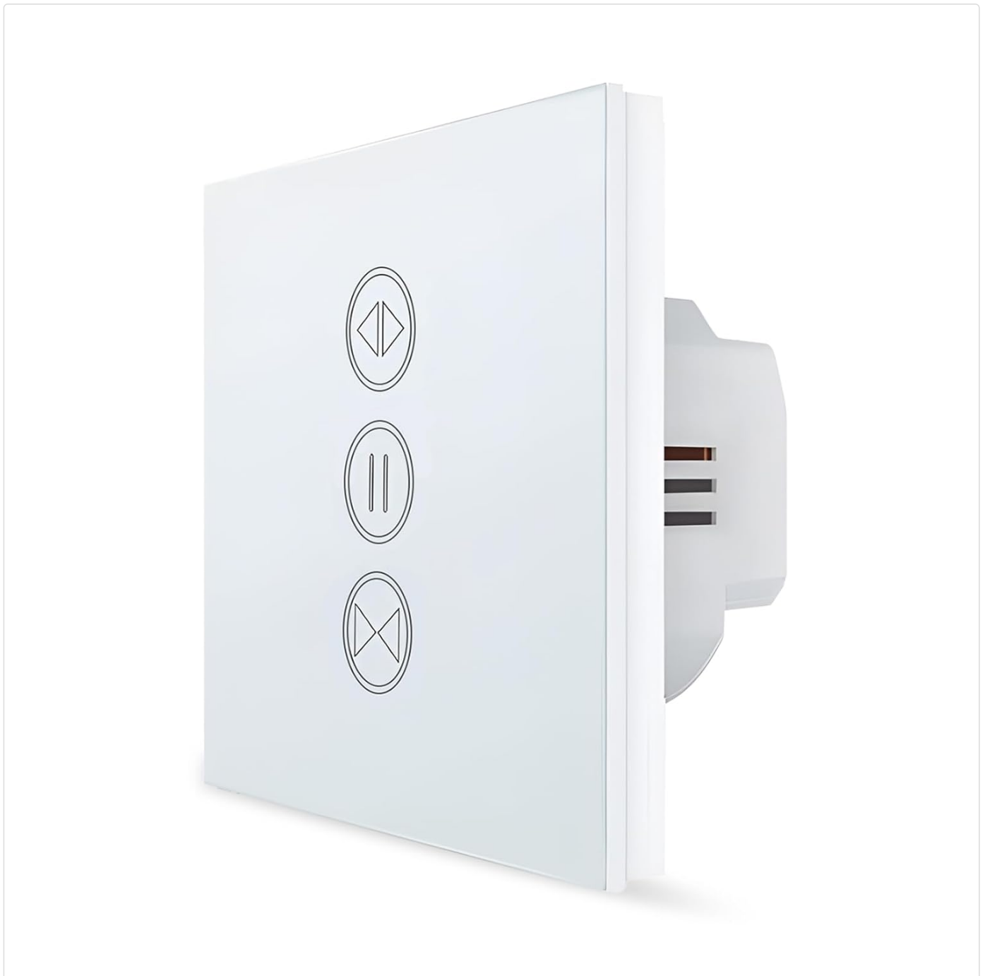
Figure 1: LoraTap WiFi Smart Blind Switch (Front View)