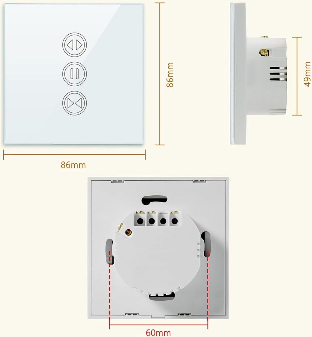
Figure 4: Product Dimensions (86mm x 86mm front panel, 49mm depth, 60mm mounting hole distance).