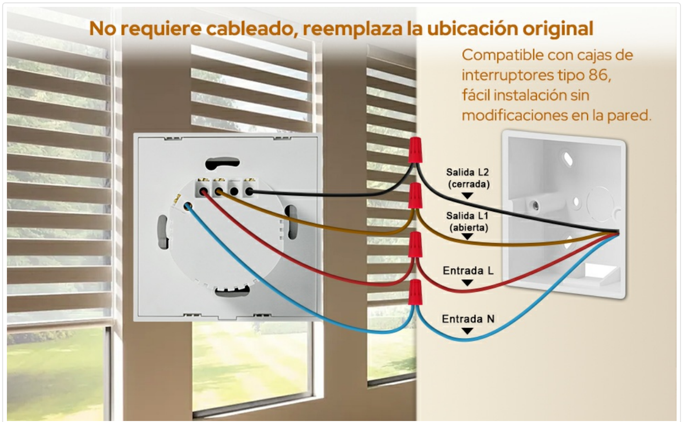
Figure 3: Wiring Diagram. Connect Live (L) and Neutral (N) inputs, and outputs for Open (L1) and Close (L2) to your 4-wire curtain motor.

Compatible con cajas de interruptores tipo 86, fácil instalación sin modificaciones en la pared.