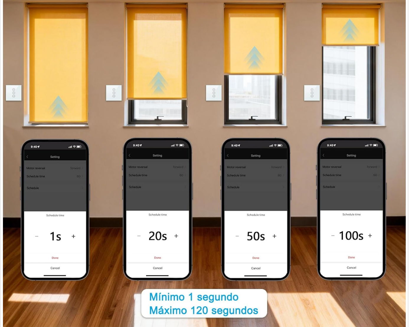
Figure 8: Adjusting the blind operation time within the app, from 1 to 120 seconds.

El tiempo de funcionamiento se puede configurar de 1 a 120 segundos, por lo que es adecuado para su uso con persianas grandes.