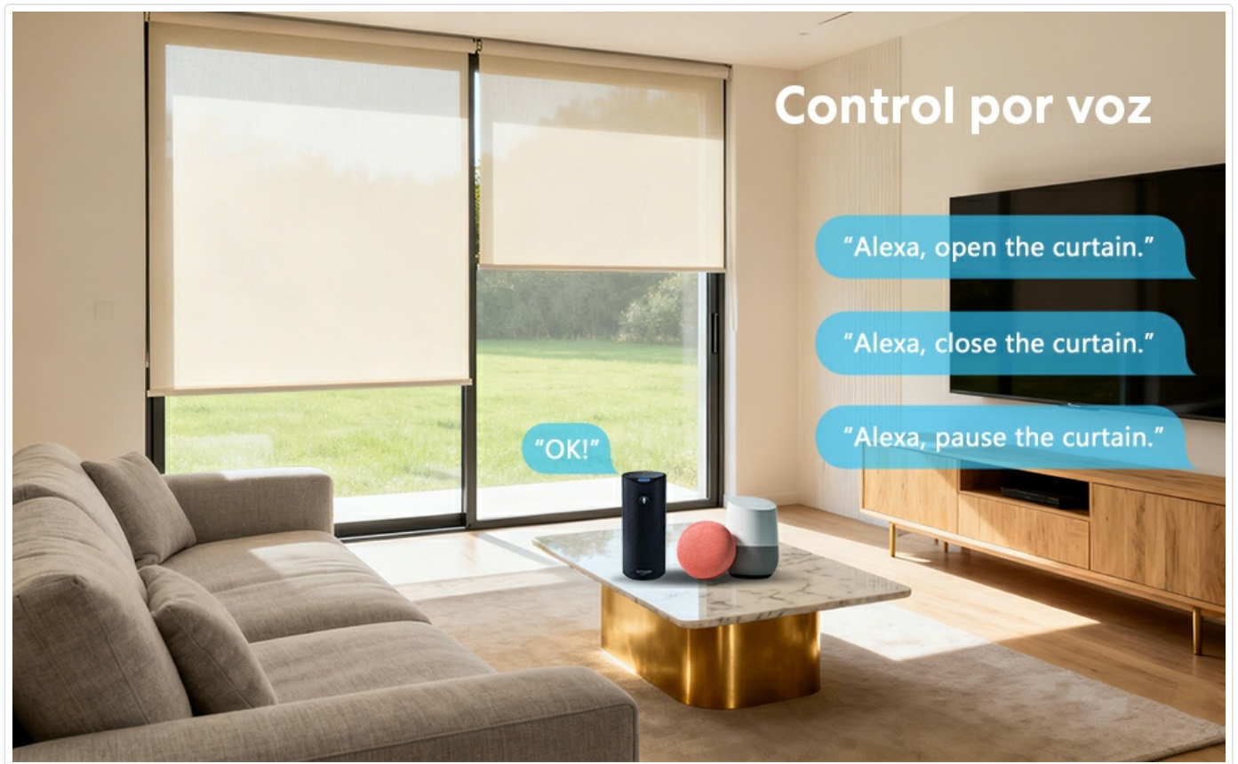
Figure 6: Voice control integration with smart assistants.

Your browser does not support the video tag.