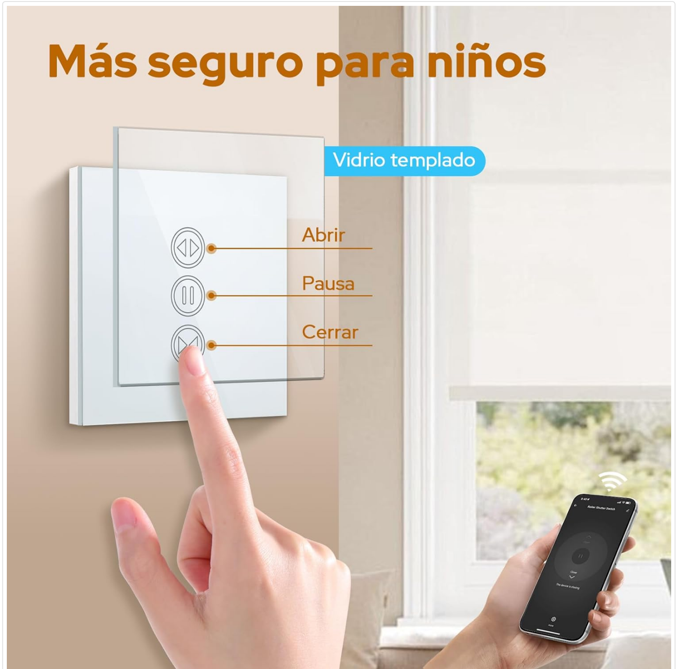
Figure 2: Tempered glass panel for child safety and easy operation.

Always ensure the main power supply is turned off before performing any electrical work. Installation should be carried out by a qualified electrician if you are unsure. Do not exceed the maximum load capacity of 600W. The tempered glass panel provides enhanced safety, but avoid excessive force or sharp objects.