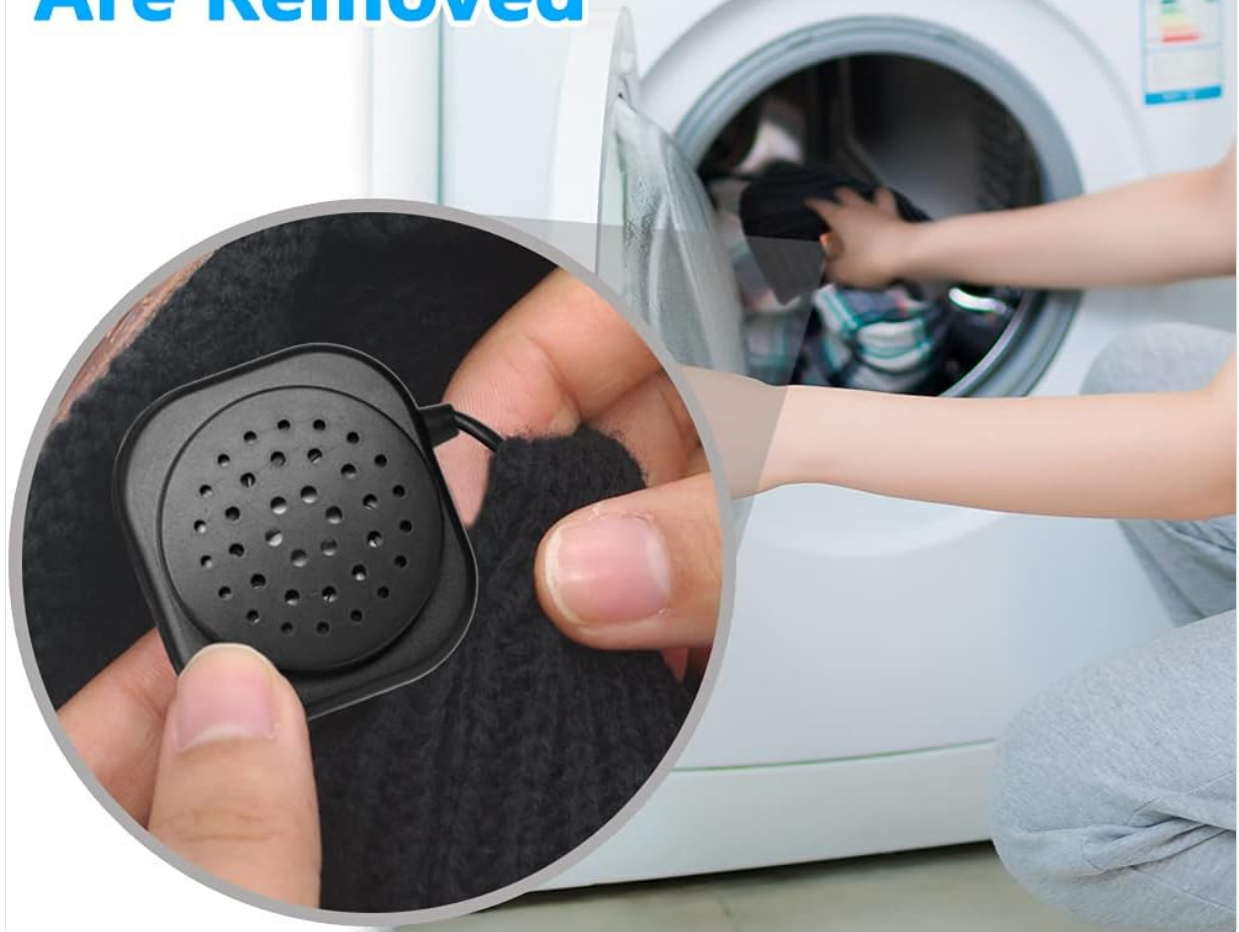
Image: A close-up of hands carefully removing a speaker module from inside the beanie, with a washing machine in the background. This demonstrates the process for preparing the beanie for washing.