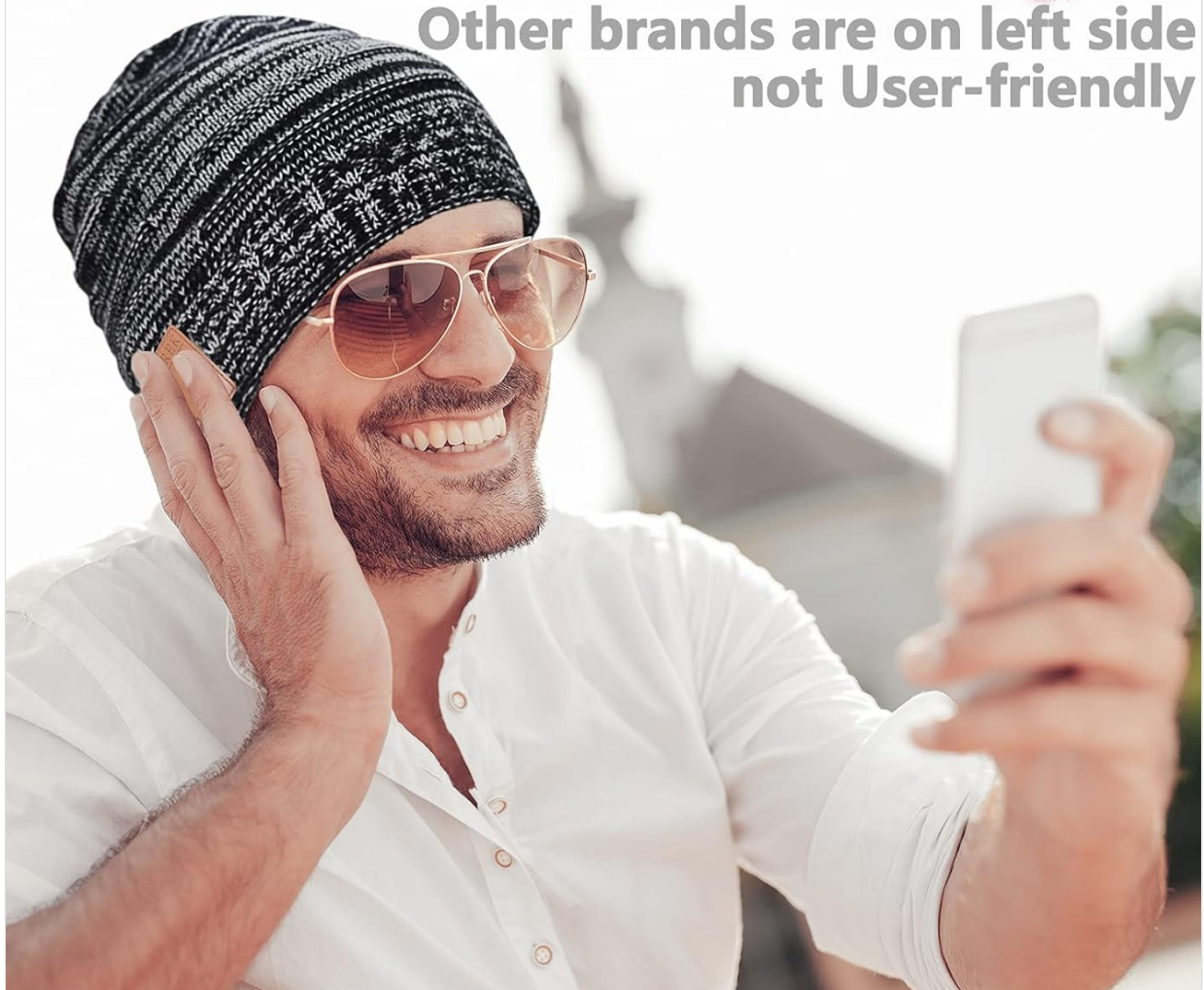
Image: A person wearing the ZecRek Bluetooth Beanie, with the control panel clearly visible on the right side. This illustrates the ergonomic design and convenient placement of controls.

Other brands are on left side not User-friendly