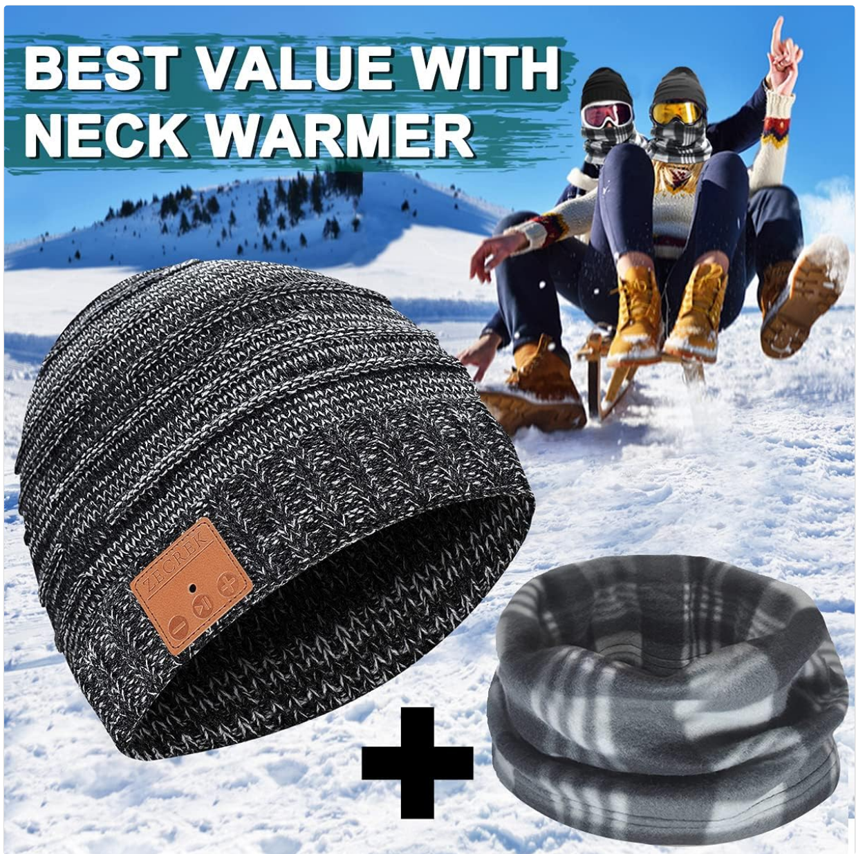
Image: The ZecRek Bluetooth Beanie, shown in black and white knit, accompanied by a matching neck warmer. This image highlights the product's dual functionality for warmth and audio.