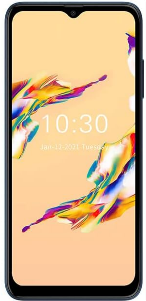
Image: Uniqcell UNI X phone displayed alongside a list of its core specifications.