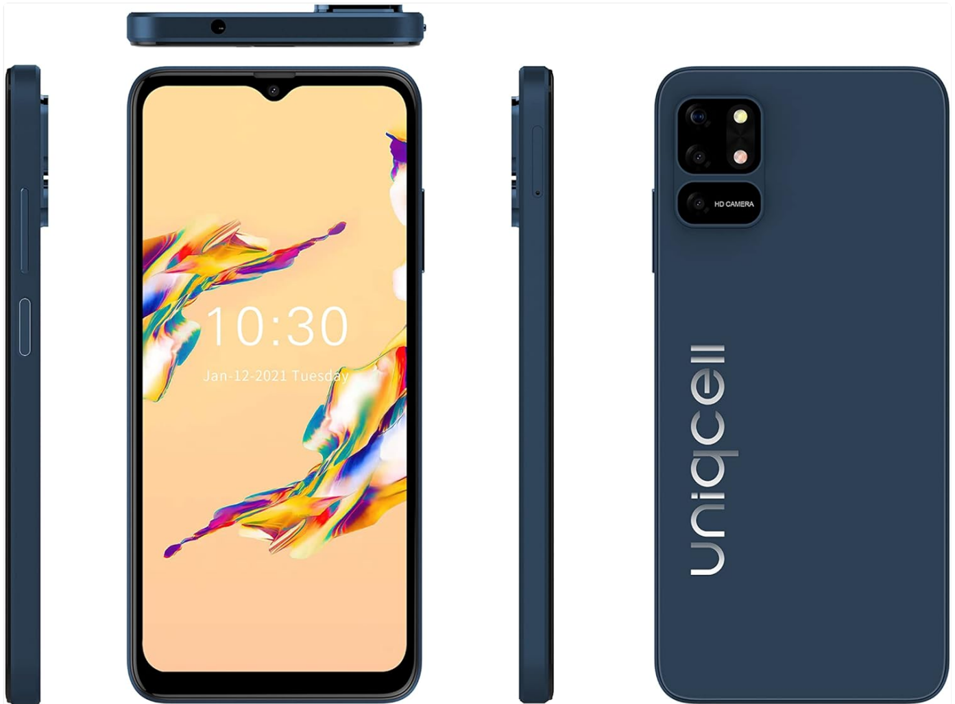
Image: Multiple views of the Uniqcell UNI X, illustrating the phone's sides where the SIM tray is typically located.