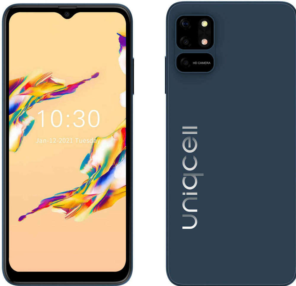
Image: Front and back view of the Uniqcell UNI X Cell Phone, showcasing its design and display.