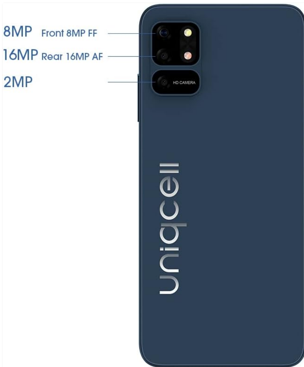
Image: Detailed view of the Uniqcell UNI X's rear camera module, highlighting the multiple lenses.