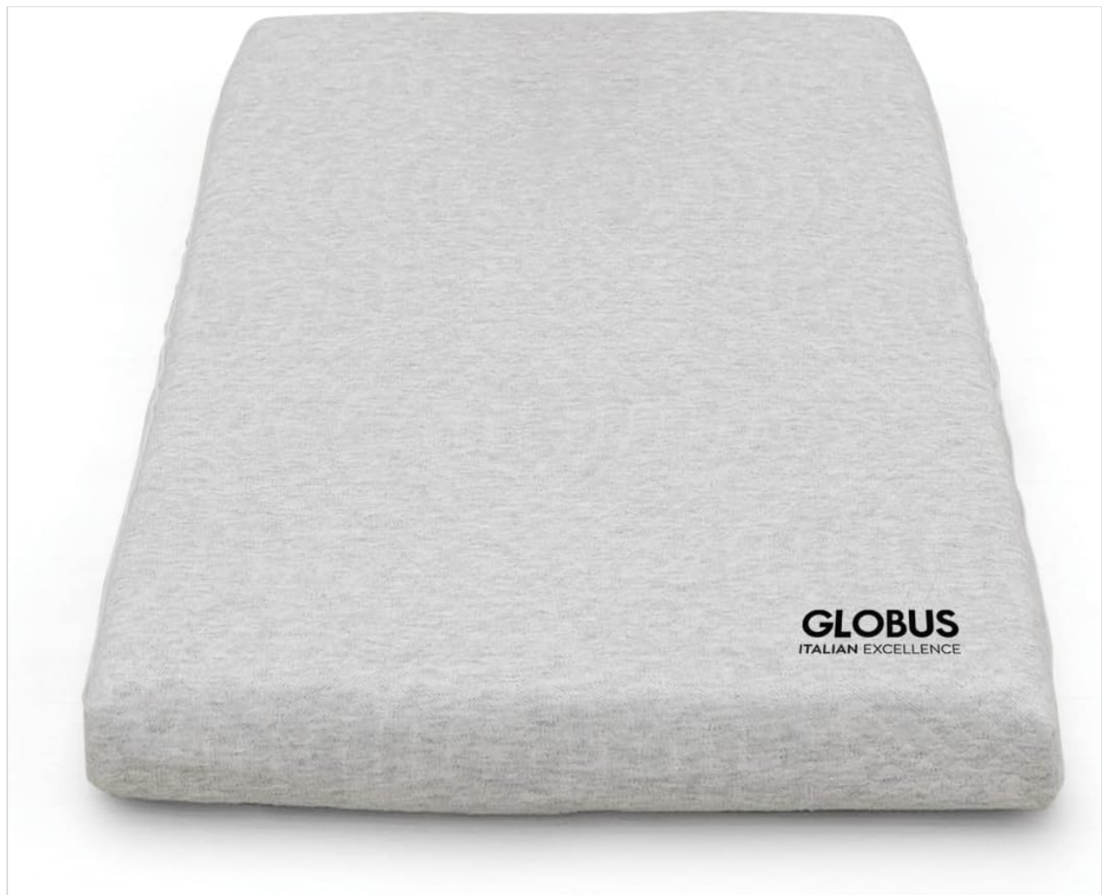
Figure 1: The Globus Mat 100 Memory Foam Magnetotherapy Mat. This image shows the overall appearance of the mat, highlighting its grey, textured outer cover and rectangular shape.