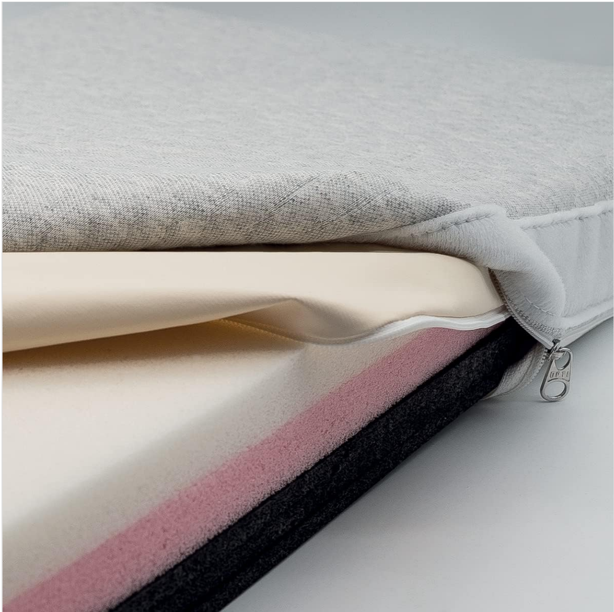
Figure 2: A cutaway view of the Globus Mat 100, revealing its internal structure. This image illustrates the multiple layers of padding, including memory foam, and indicates the placement of the four solenoids within the mat.