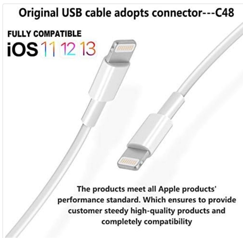
Image: A close-up view of the MAILESI Lightning connector, highlighting the C48 terminal and indicating full compatibility with iOS versions.

The cable supports a data transfer rate of up to 480 Mbps/s.