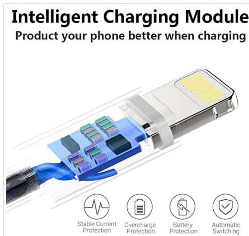
Image: A diagram showing the intelligent charging module within the Lightning connector, illustrating its features like stable current protection, overcharge protection, battery protection, and automatic switching, which help prevent common charging issues.