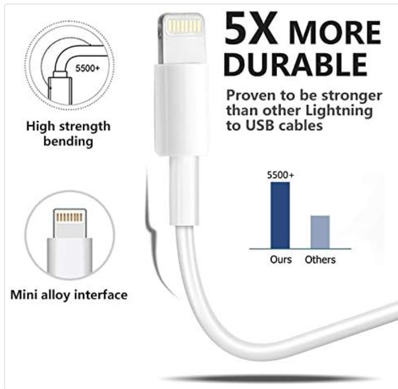
Image: A diagram illustrating the cable's durability, showing its high strength bending capability (5500+ bends) and mini alloy interface, indicating enhanced robustness compared to other cables.