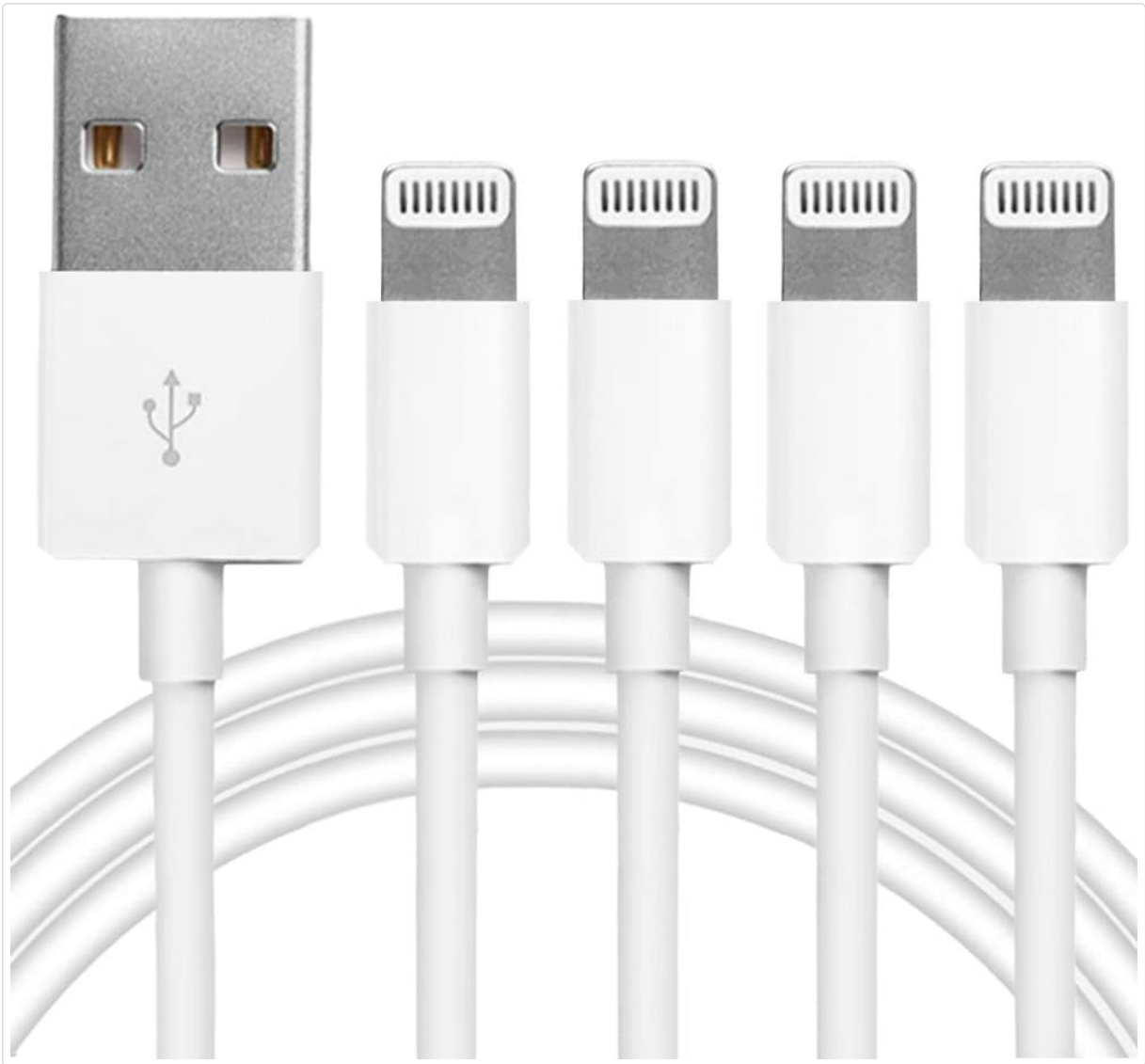
Image: A pack of four white MAILESI MFi Certified Lightning to USB Charging Cables, showing both the USB-A and Lightning connectors.