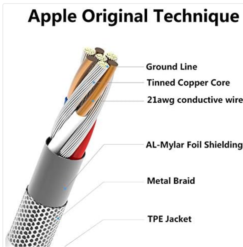
Image: A detailed cross-section diagram of the MAILESI Lightning cable, showing its internal components: Ground Line, Tinned Copper Core, 21AWG conductive wire, AL-Mylar Foil Shielding, Metal Braid, and TPE Jacket, all contributing to its performance and durability.