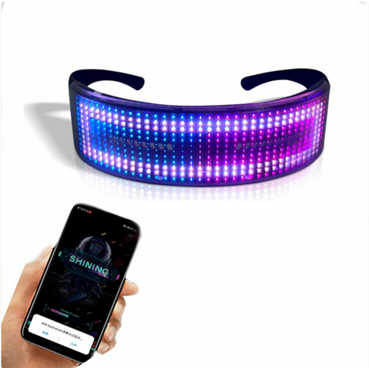
Image 1: Keledz LED Customizable Glasses showcasing various display patterns and the mobile app.