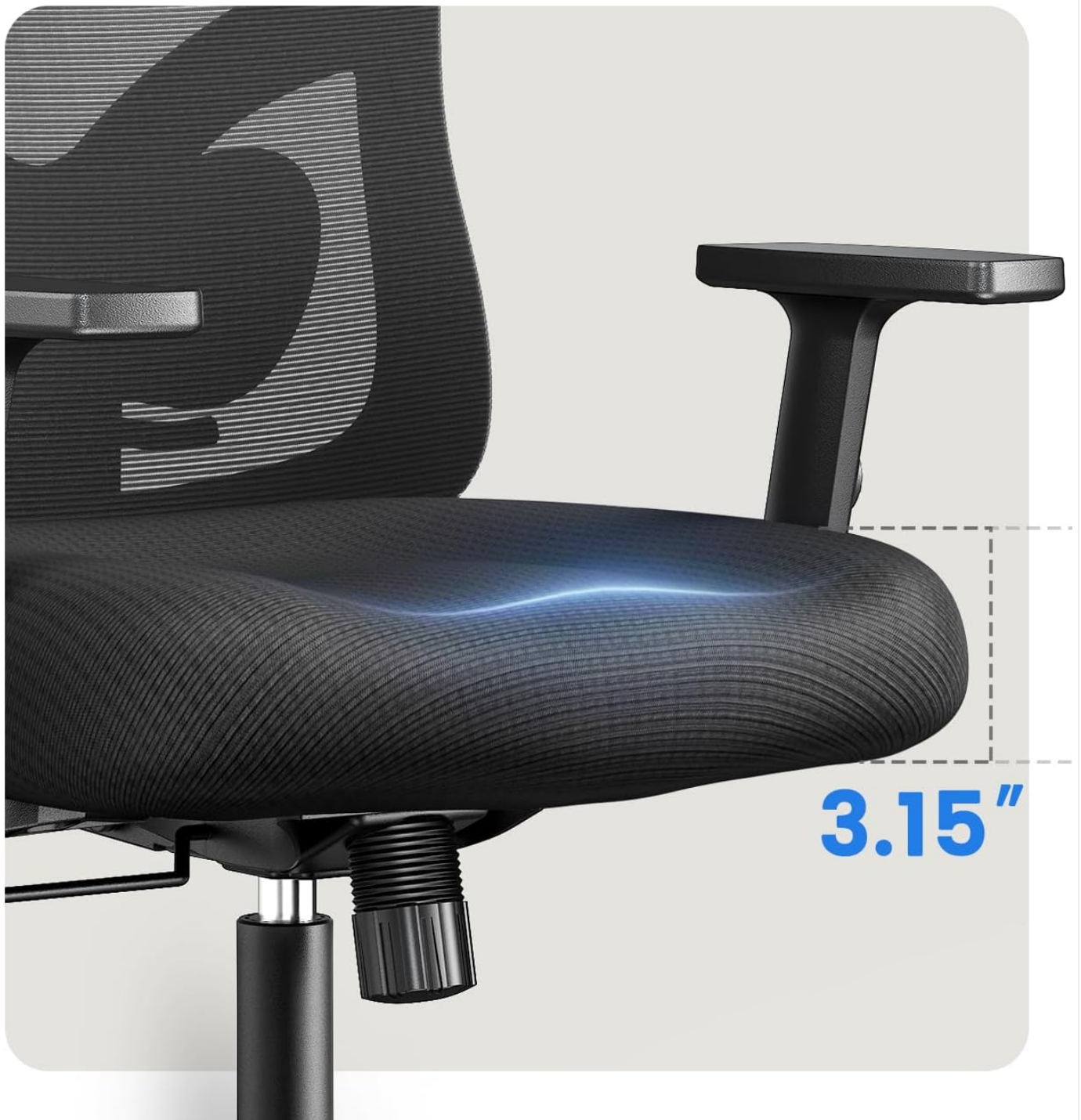
Figure 3: Illustration of chair base and gas lift assembly.