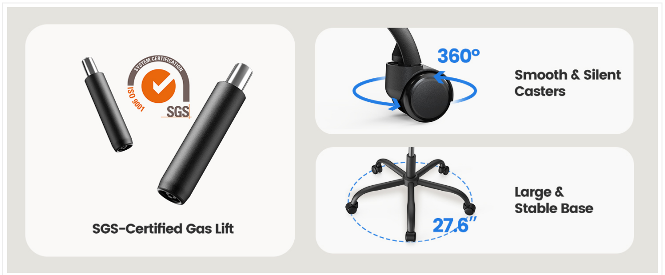
Figure 5: Gas lift and base for height adjustment and stability.