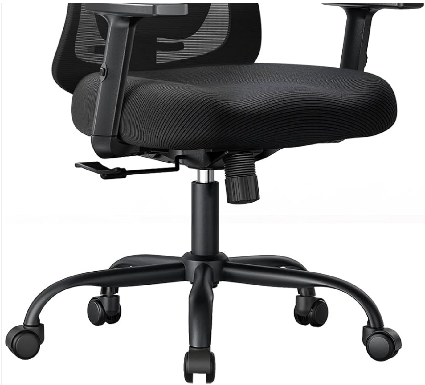
Figure 1: NOBLEWELL Ergonomic Office Chair (Model NWOC1-1)