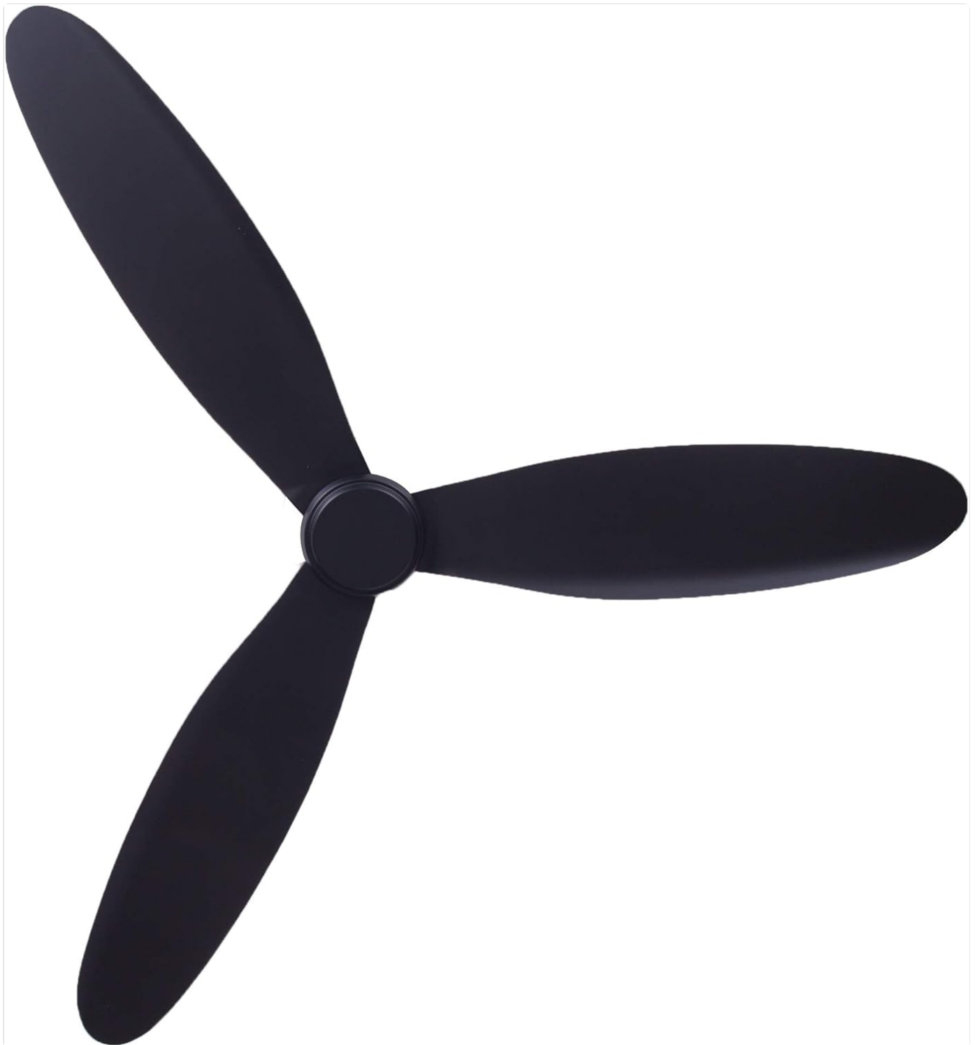
Figure 2: View of the fan's three black blades.