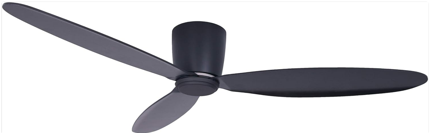
Figure 1: Lucci Air Radar 52-inch DC Ceiling Fan, Black.

Thank you for choosing the Lucci Air Radar 52-inch DC Ceiling Fan. This manual provides essential information for the safe installation, operation, and maintenance of your new ceiling fan. Please read it thoroughly before beginning installation or use.