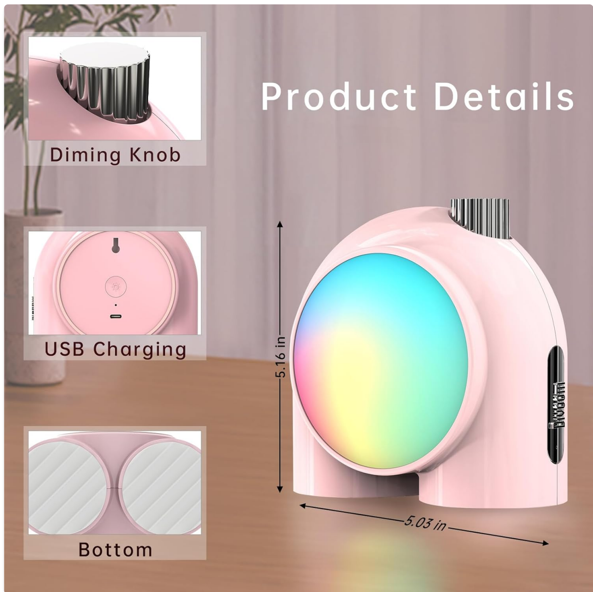
Image: Detailed view of the lamp's features, including the USB charging port.