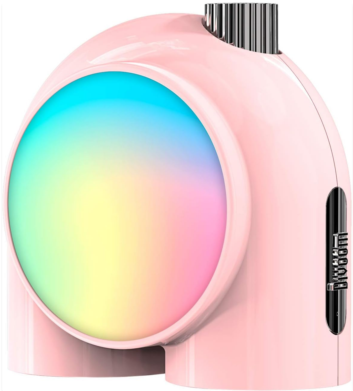
Image: The Divoom Planet-9 lamp demonstrating app control and various color options.