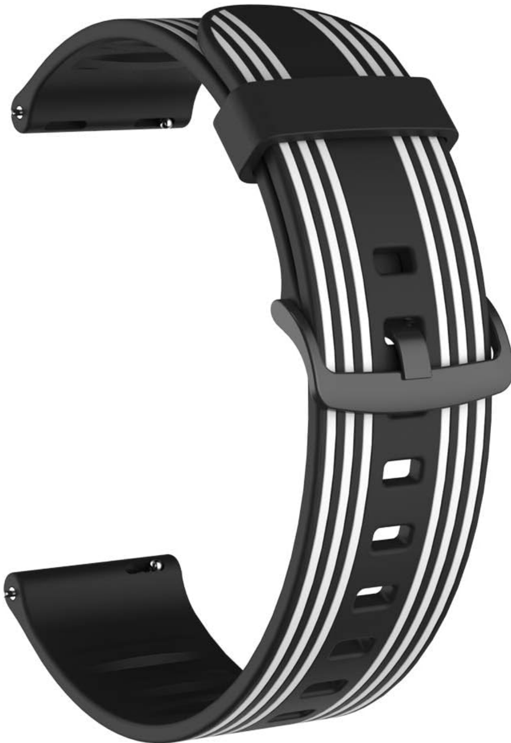
Image: A close-up of the watch band, highlighting the buckle and adjustment holes for a personalized fit.