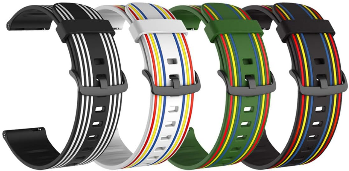
Image: A selection of E ECSEM silicone watch bands, showcasing various color and stripe combinations.