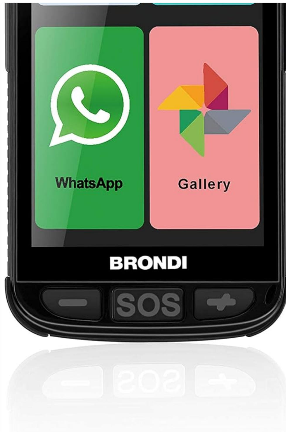
Image: Front view of the BRONDI Amico Smartphone screen, showing large, user-friendly icons for pre-installed applications such as Skype, Camera with Flash, WhatsApp, and Gallery. The BRONDI logo and an SOS button are visible below the screen.