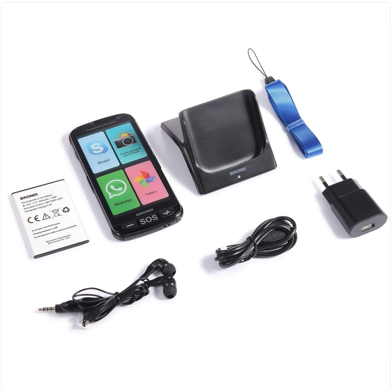
Image: BRONDI Amico Smartphone with its complete set of accessories, including the phone, battery, charger, charging base, earphones, and neck strap, laid out on a white surface.