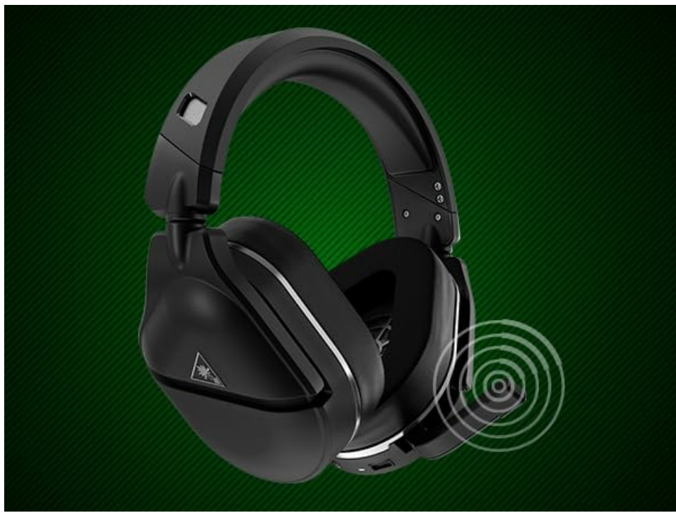
Image: The headset with an overlay illustrating enhanced sound detection, representing the Superhuman Hearing feature.