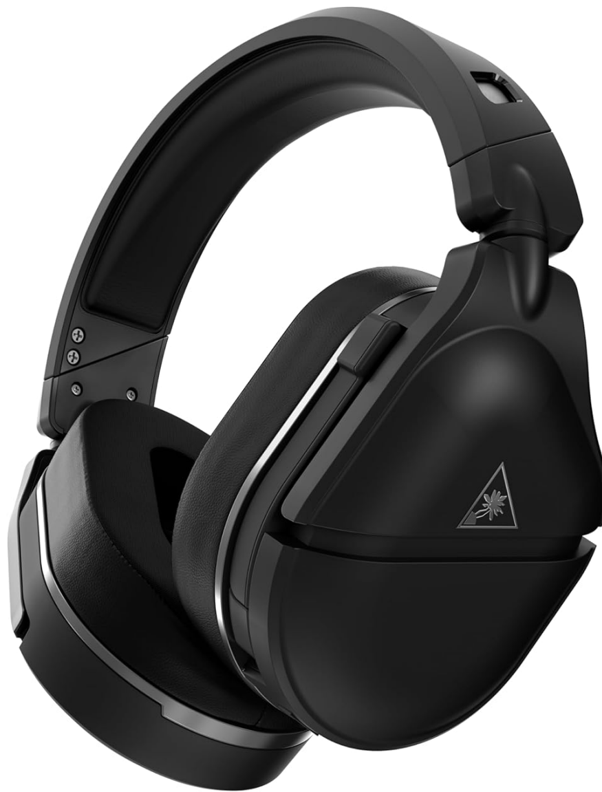
Image: Side view of the headset highlighting the accessible controls for volume and microphone.