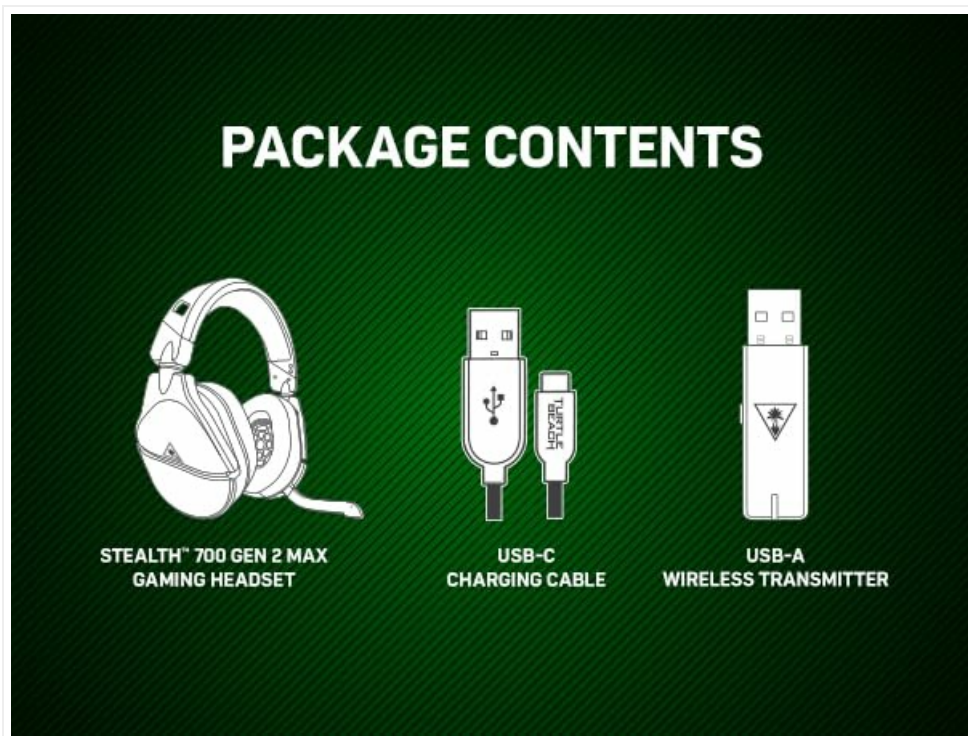
Image: Contents of the Turtle Beach Stealth 700 Gen 2 package, including the headset, USB-C charging cable, and USB-A wireless transmitter.