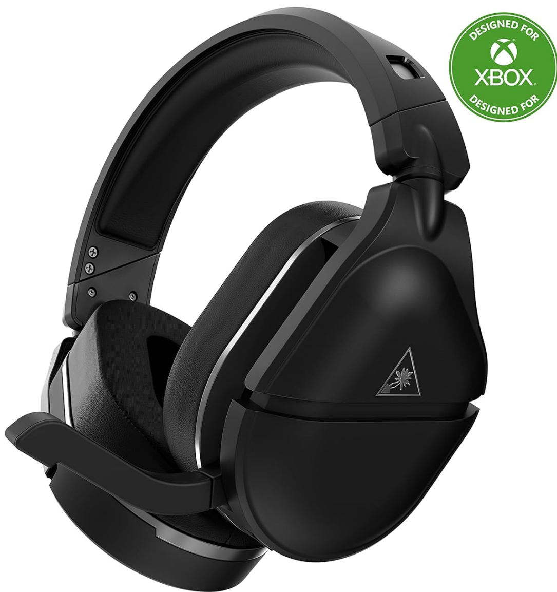
Image: The Turtle Beach Stealth 700 Gen 2 Wireless Gaming Headset, showcasing its design.