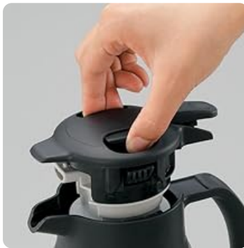
Image: The pinch-release stopper can be easily removed for thorough cleaning.