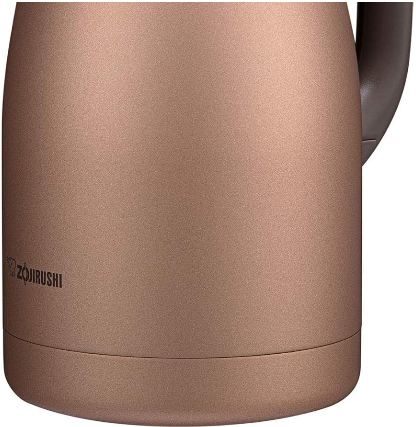
Image: The Zojirushi SH-HC15NU Stainless Steel Vacuum Carafe in Matte Copper, showcasing its sleek design.