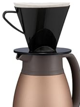
Image: The carafe's wide mouth allows for direct brewing with a coffee dripper.