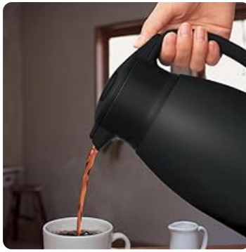
Image: A smooth stream of coffee being poured from the carafe, demonstrating the easy-pour mechanism.