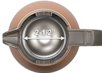
Image: The wide 2 1/2-inch mouth of the carafe, designed for easy cleaning and filling.