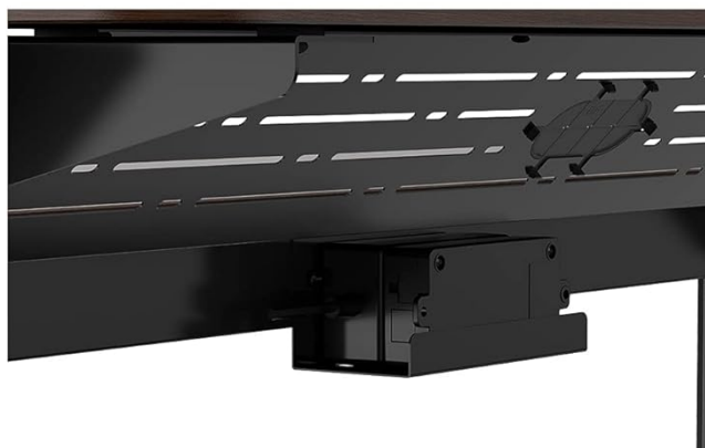
Figure 4: Monitor Stand and Desk Features