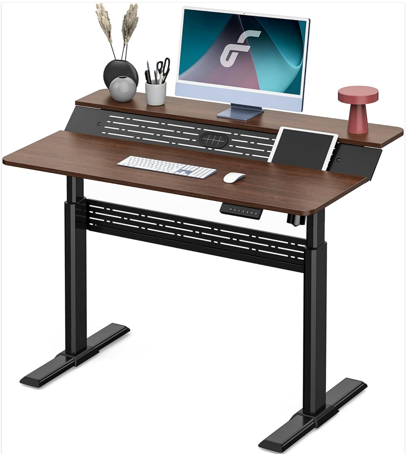
Figure 1: Fenge Electric Height Adjustable Desk with Monitor Stand