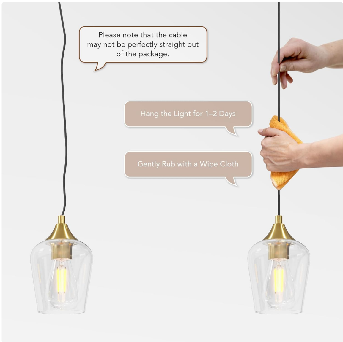
Image: Tips for straightening the PVC cable.