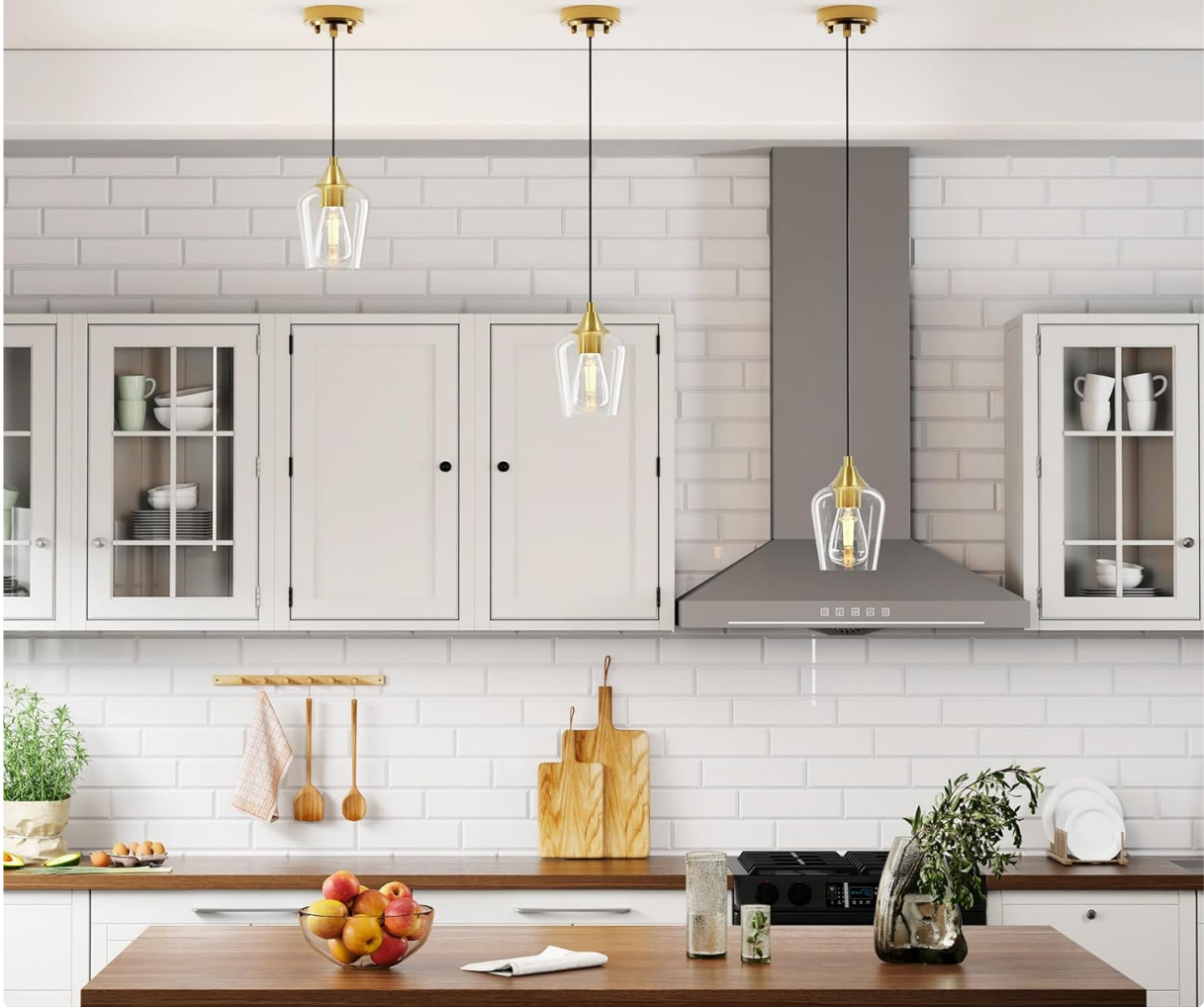
Image: VONLUCE pendant lights installed over a kitchen island, showcasing the adjustable cable.

Easily Customize the Height of the Light from 9" to 66" to Suit Every Room