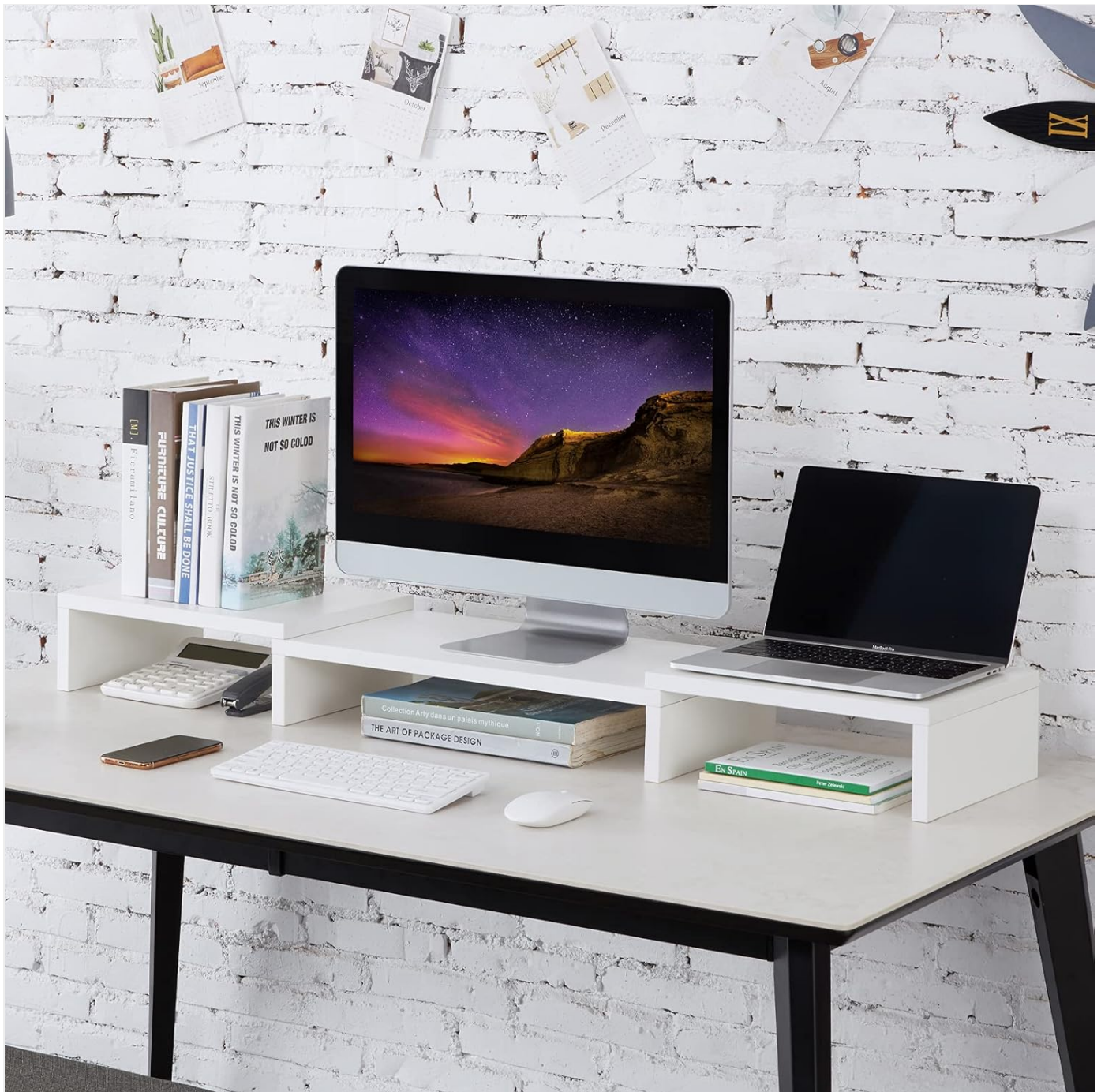
Image: The SUPERJARE Monitor Stand Riser assembled on a desk, supporting a monitor and laptop, demonstrating its use as a desktop organizer.