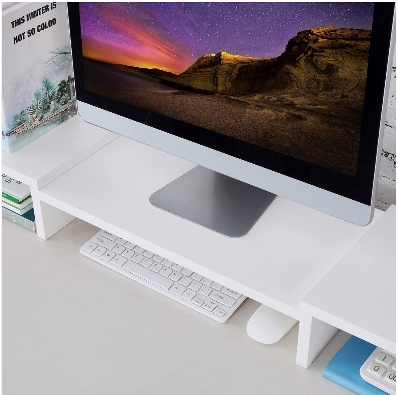
Image: The monitor stand configured with its side sections angled, supporting two monitors on a desk, showcasing its flexible design.