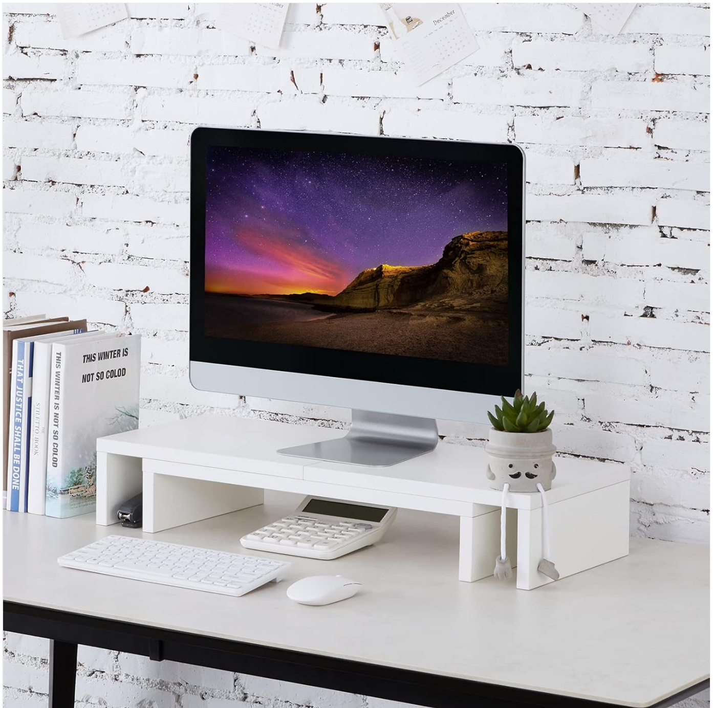
Image: The monitor stand fully assembled, supporting a single monitor, with a keyboard and mouse placed underneath the central section. This illustrates the completed first stage of assembly.