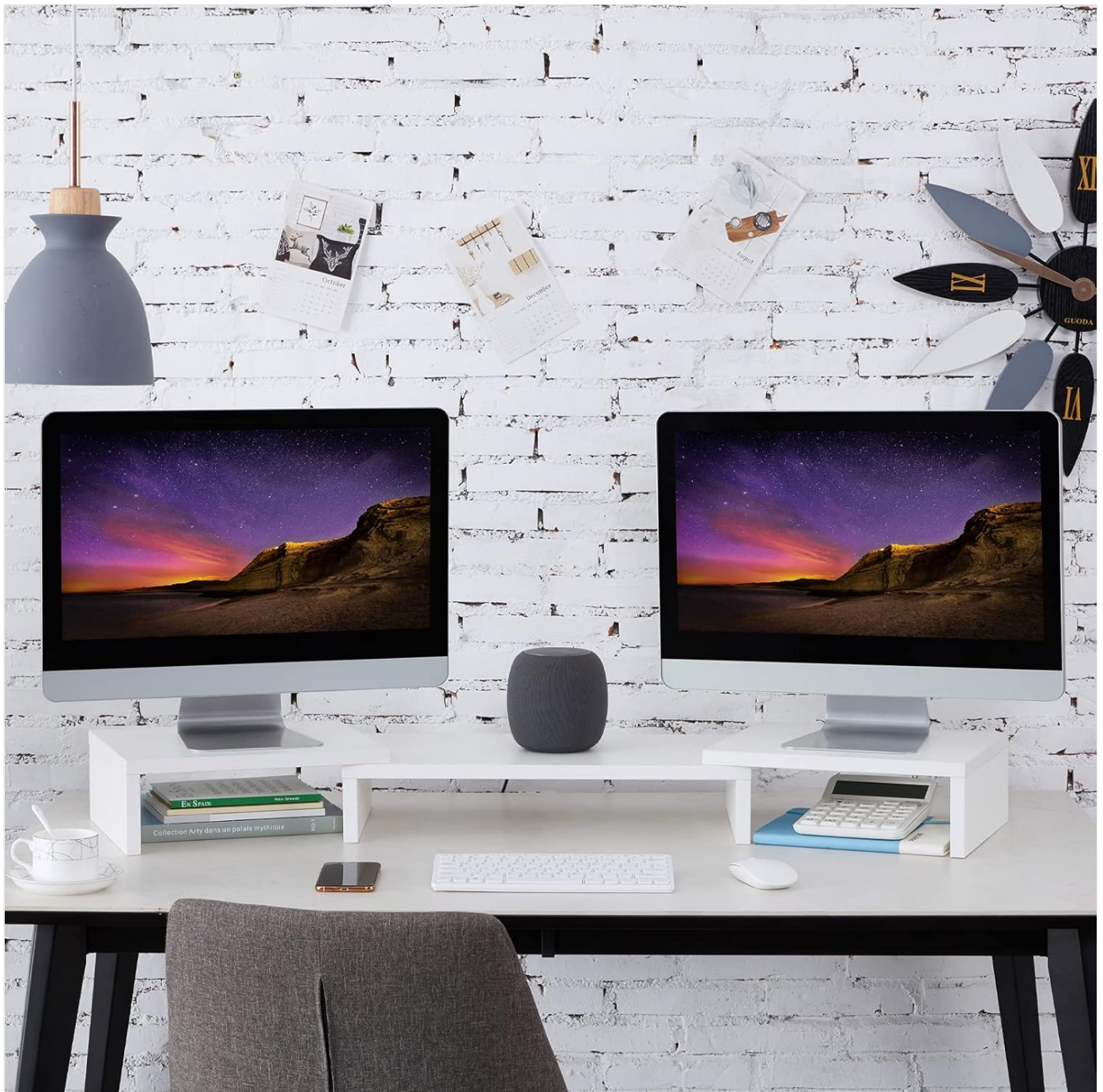
Image: The SUPERJARE Monitor Stand Riser in use, supporting two computer monitors and a central speaker, showcasing its capacity for multiple devices.