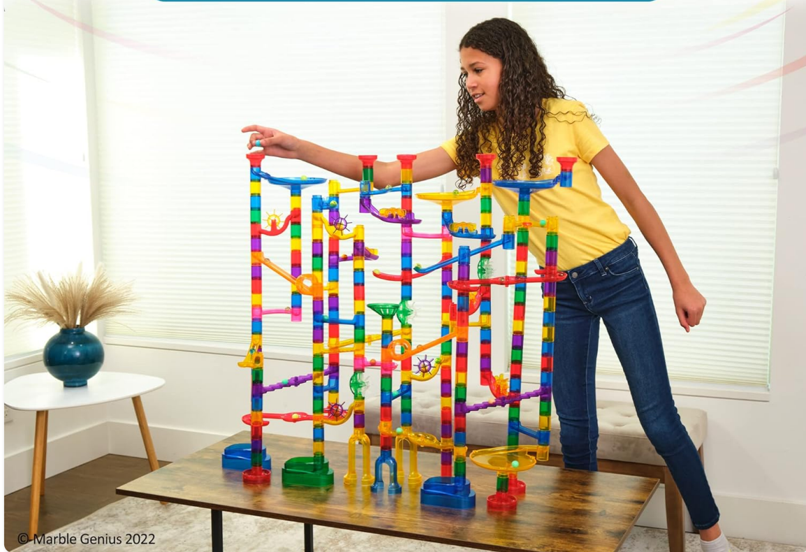
Image 3.1: A child interacting with a Marble Genius marble run, demonstrating typical play.

Marble run building sets sold separately