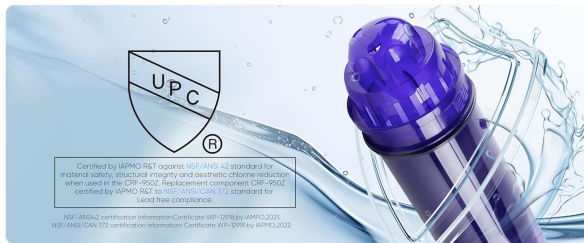
Image: Guide on locating IAPMO certification information for the CRF-950Z model.

Image: Certification details for the PUREPLUS CRF950Z filter, highlighting compliance with NSF/ANSI standards.