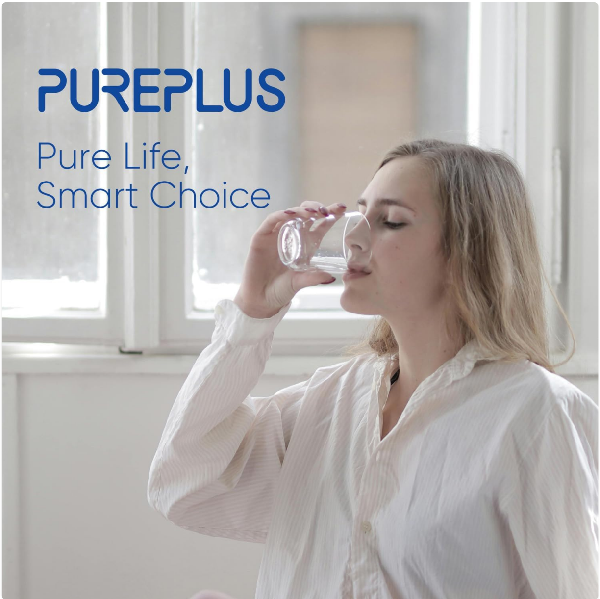
Image: A person enjoying a glass of filtered water.