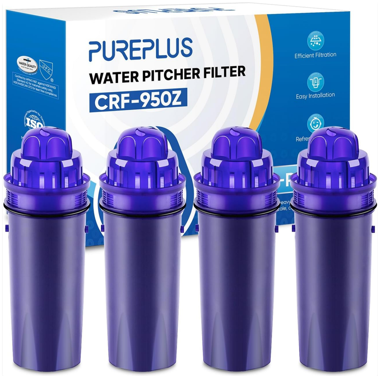
Image: A pack of four PUREPLUS CRF950Z water pitcher filters, highlighting the product packaging and individual filters.