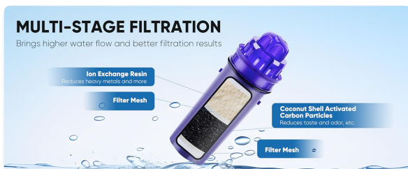
Image: Details on the filter's effectiveness in reducing various contaminants.

Image: Visual representation of the filter's multi-stage filtration layers.