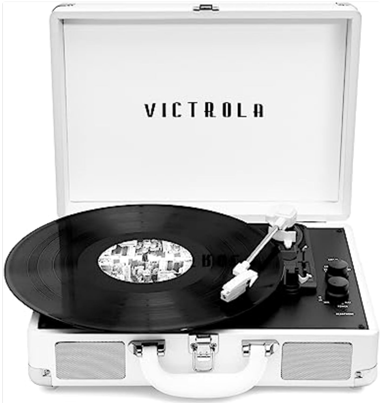
Image 4.1: Victrola Journey+ Bluetooth Suitcase Record Player in white, open with a vinyl record on the platter. This image displays the main unit with its lid open, revealing the turntable, tone arm, and control knobs.

Familiarize yourself with the components of your record player.