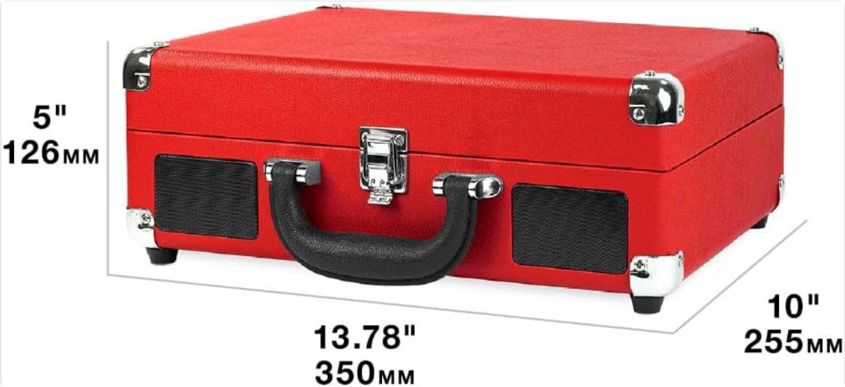
Image 9.1: Diagram showing the dimensions of the Victrola Journey+ record player: 5 inches (126mm) height, 10 inches