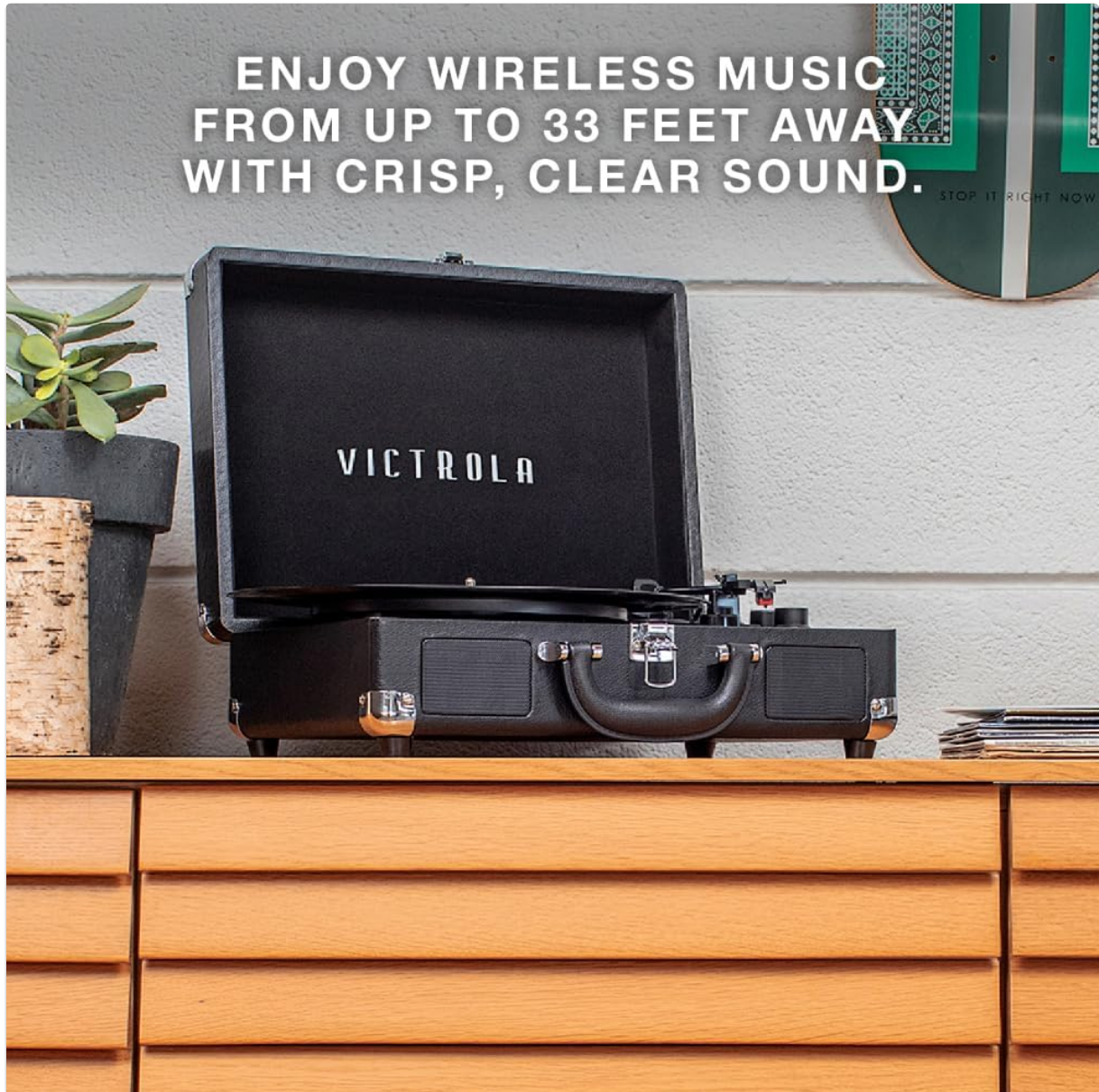
Image 6.2: Victrola Journey+ record player in black, showcasing wireless music streaming from up to 33 feet away. This image illustrates the convenience of Bluetooth connectivity.