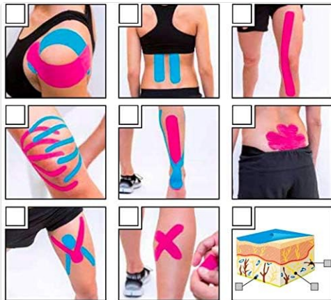
Image: A grid of diagrams illustrating different kinesiology tape applications on various body areas such as the shoulder, upper back, thigh, calf, and lower back, demonstrating versatility.