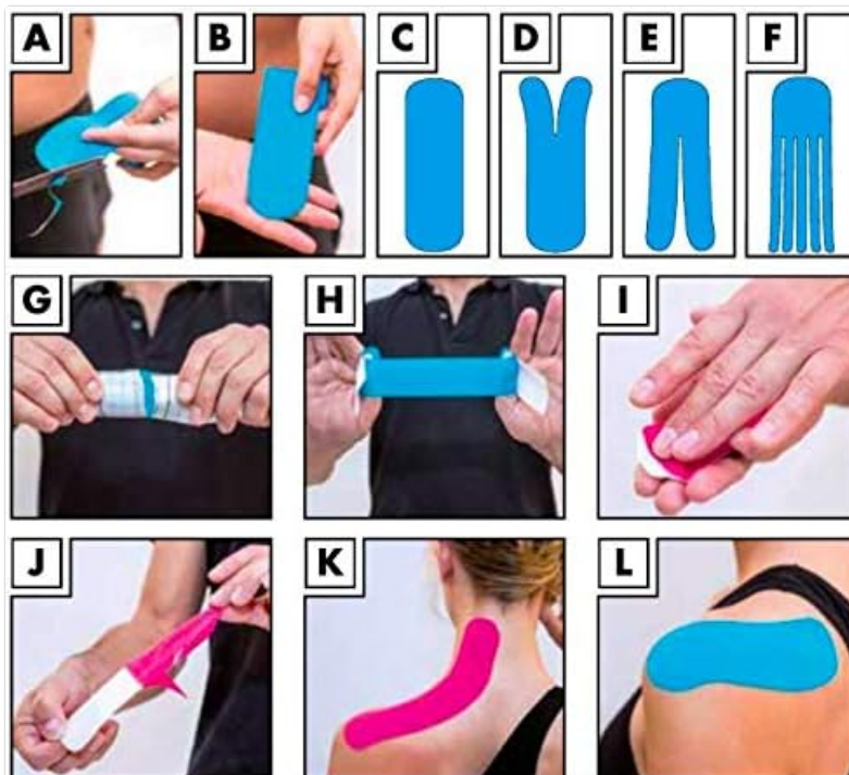
Image: A visual guide demonstrating various methods for cutting and shaping kinesiology tape, including I-strips, Y-strips,