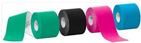
Image: Four rolls of Sensiplast Kinesiology Tape in various colors (green, black, pink, blue), illustrating the product variety.