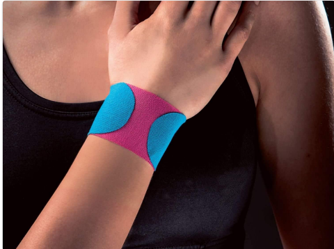
Image: Kinesiology tape applied to the wrist, demonstrating support for wrist joints and forearm muscles.