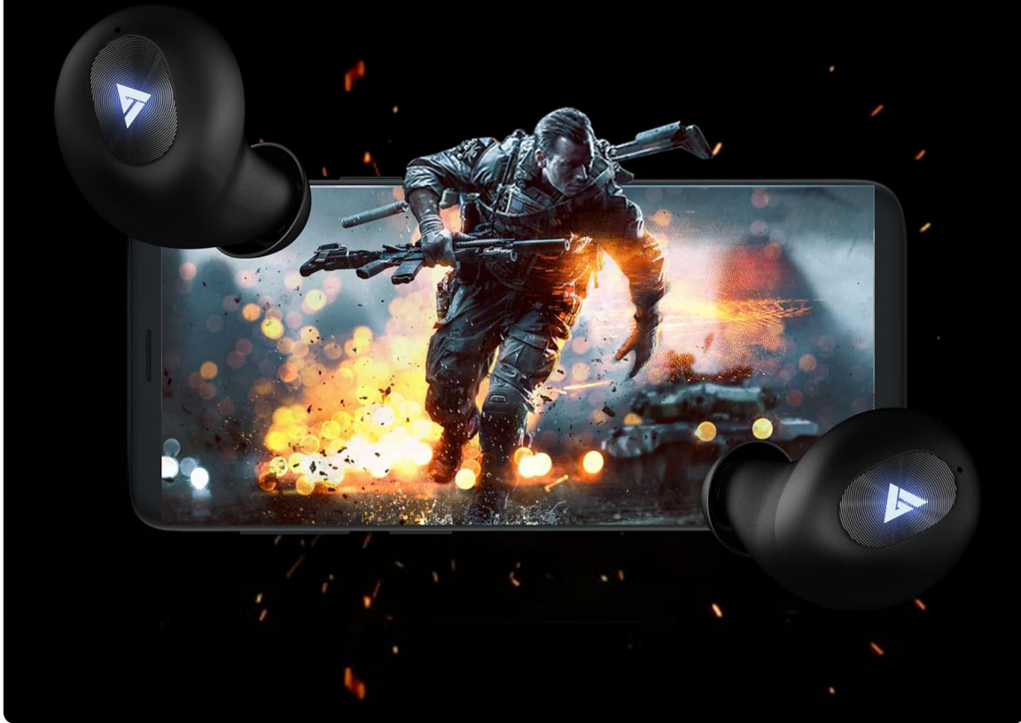
Image: Contents of the Boulton Audio Powerbuds package.

The image above displays the complete contents of the Boulton Audio Powerbuds box, including the earbuds, charging case, a micro USB charging cable, additional ear tips for a customized fit, and the user manual.