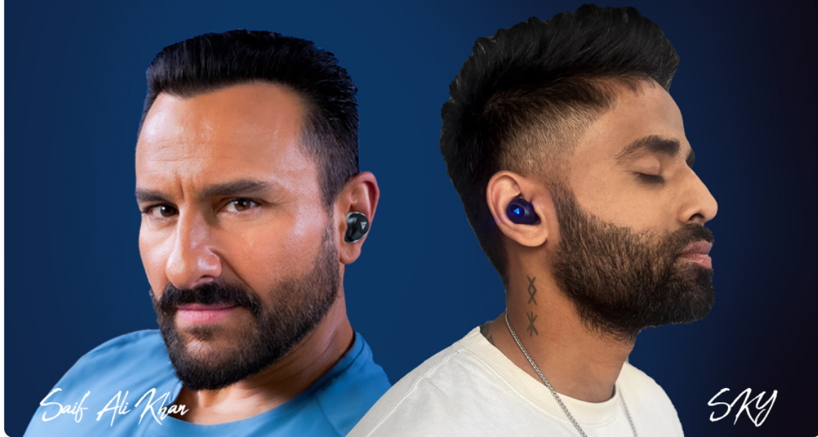
Image: The touch-sensitive area on the earbuds allows for easy control of music playback, calls, and voice assistant activation.

Your browser does not support the video tag.