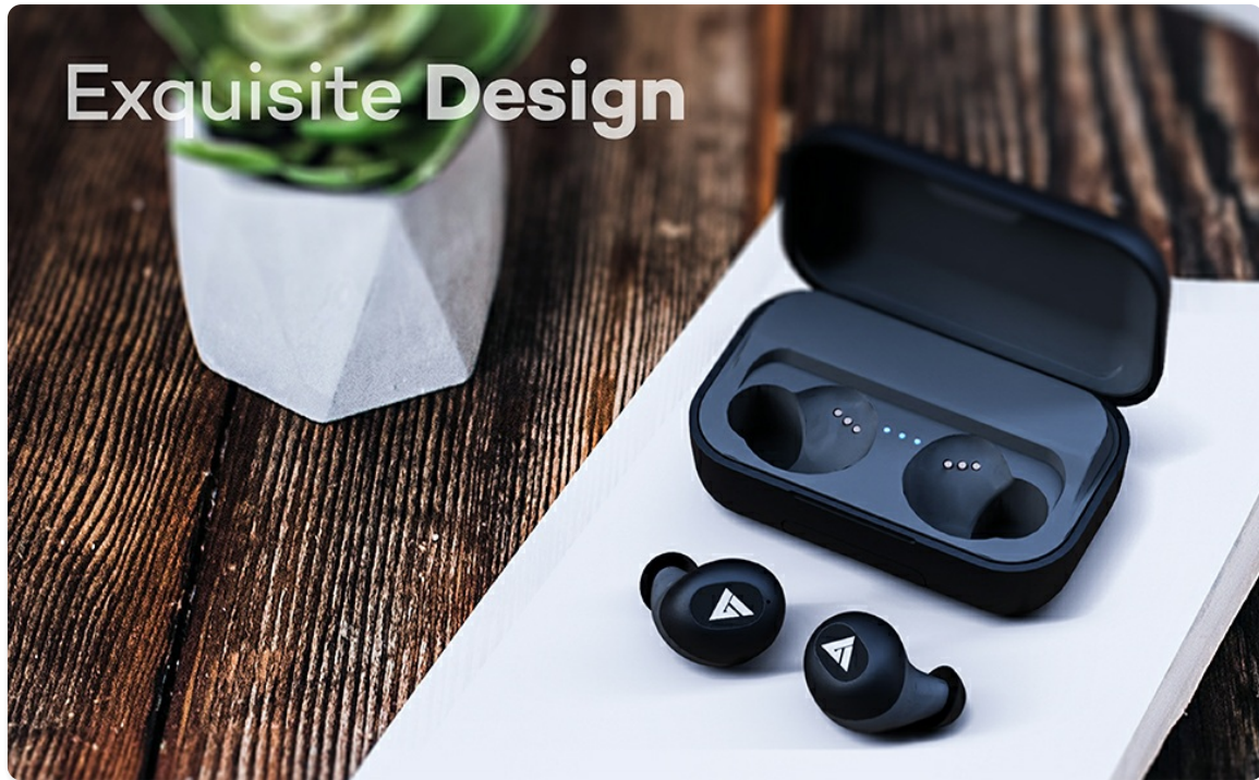
Image: The IPX7 waterproof rating ensures durability against water and sweat.