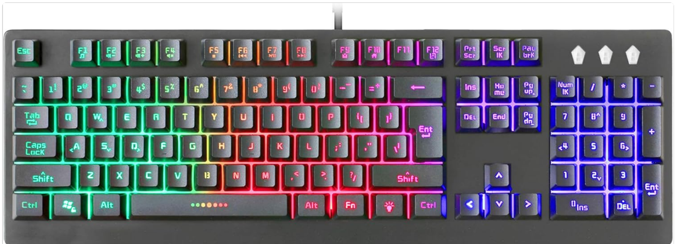
Image: Top-down view of the CableWholesale Gaming RGB LED USB Keyboard, showcasing its full 104-key layout and vibrant rainbow backlighting.

Thank you for choosing the CableWholesale Gaming RGB LED USB Keyboard. This 104-key keyboard is designed for an enhanced computing experience, featuring vibrant RGB backlighting and a comfortable design. This manual provides essential information for setting up, operating, and maintaining your new keyboard.