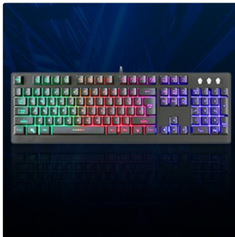
Image: Diagram showing FN + Light Bulb key for toggling modes and FN + Page Up/Down for brightness adjustment.