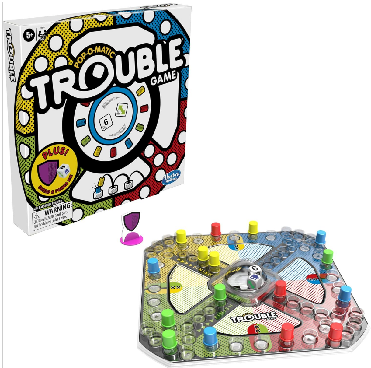
Image: The Trouble game board fully set up with all colored pawns in their starting 'HOME' positions, ready for play.