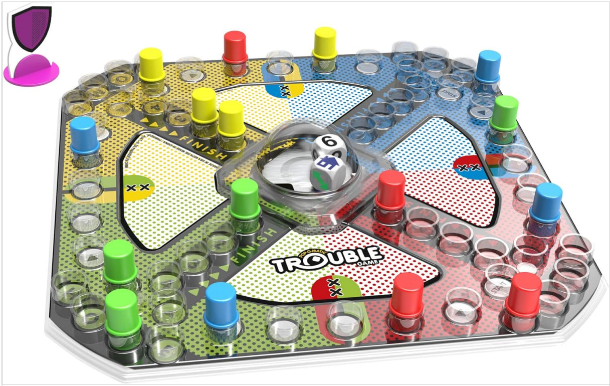
Image: The Trouble game board with its Pop-O-Matic dice roller, colored pawns, and the bonus shield piece.