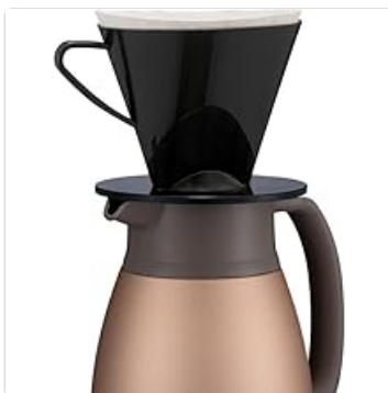
Image: A Zojirushi carafe with a coffee dripper positioned on its top, demonstrating compatibility for direct brewing.