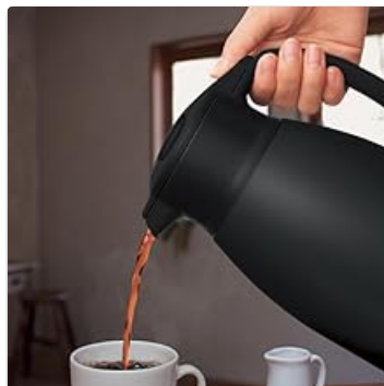
Image: Coffee is being poured from a Zojirushi carafe into a white coffee cup, illustrating the pouring function.

Image: A hand demonstrates pouring liquid from the Zojirushi carafe by pressing the lever-style stopper. This shows the ease of one-handed operation.