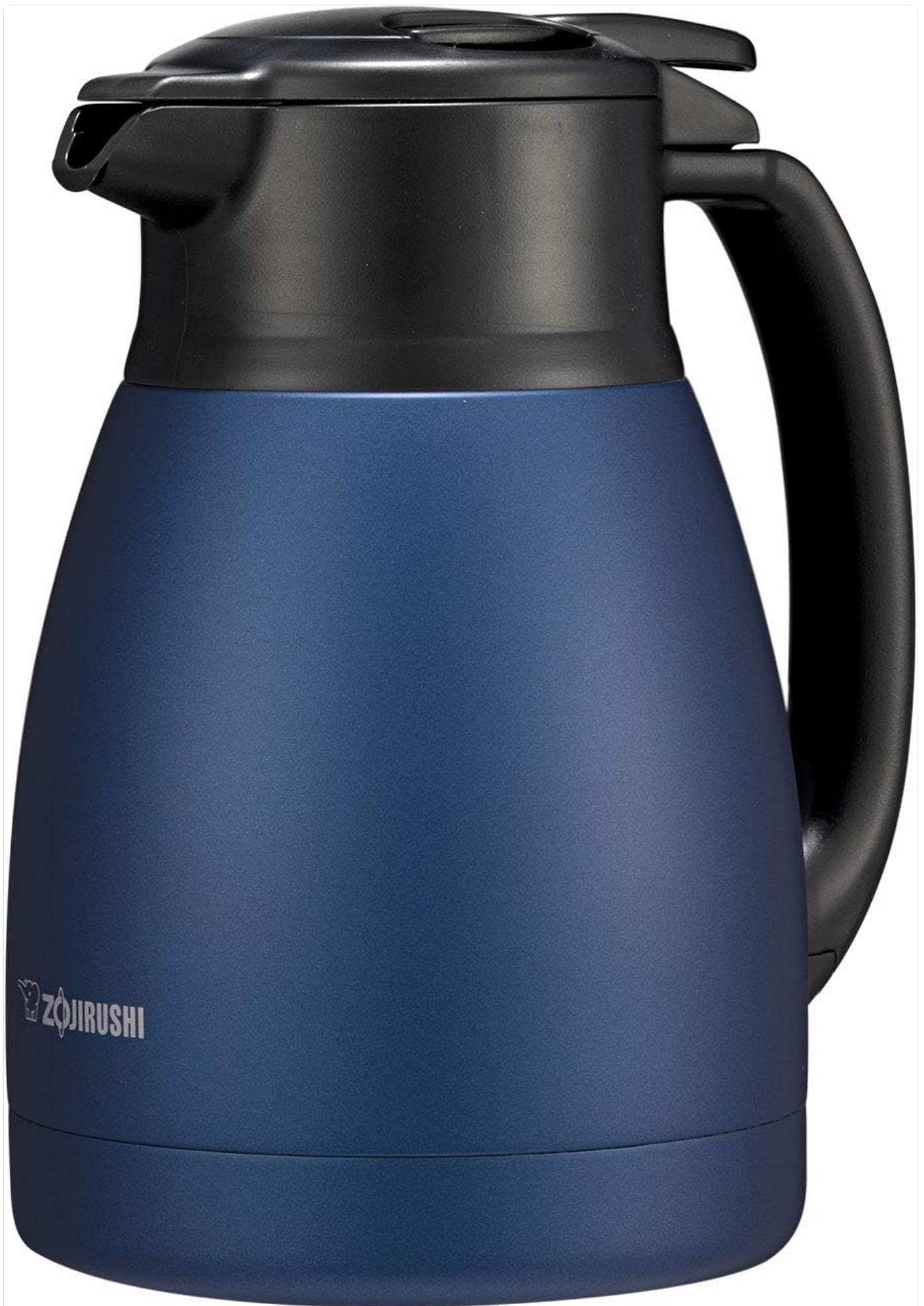
Image: Zojirushi SH-HC10AD Stainless Steel Vacuum Carafe in Matte Navy. This image displays the full product from a slight angle, highlighting its sleek design and matte finish.