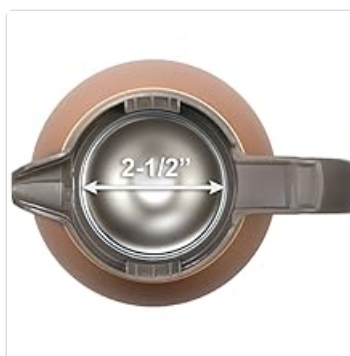
Image: A top-down view of the Zojirushi carafe with its lid removed, showing the interior for cleaning access.