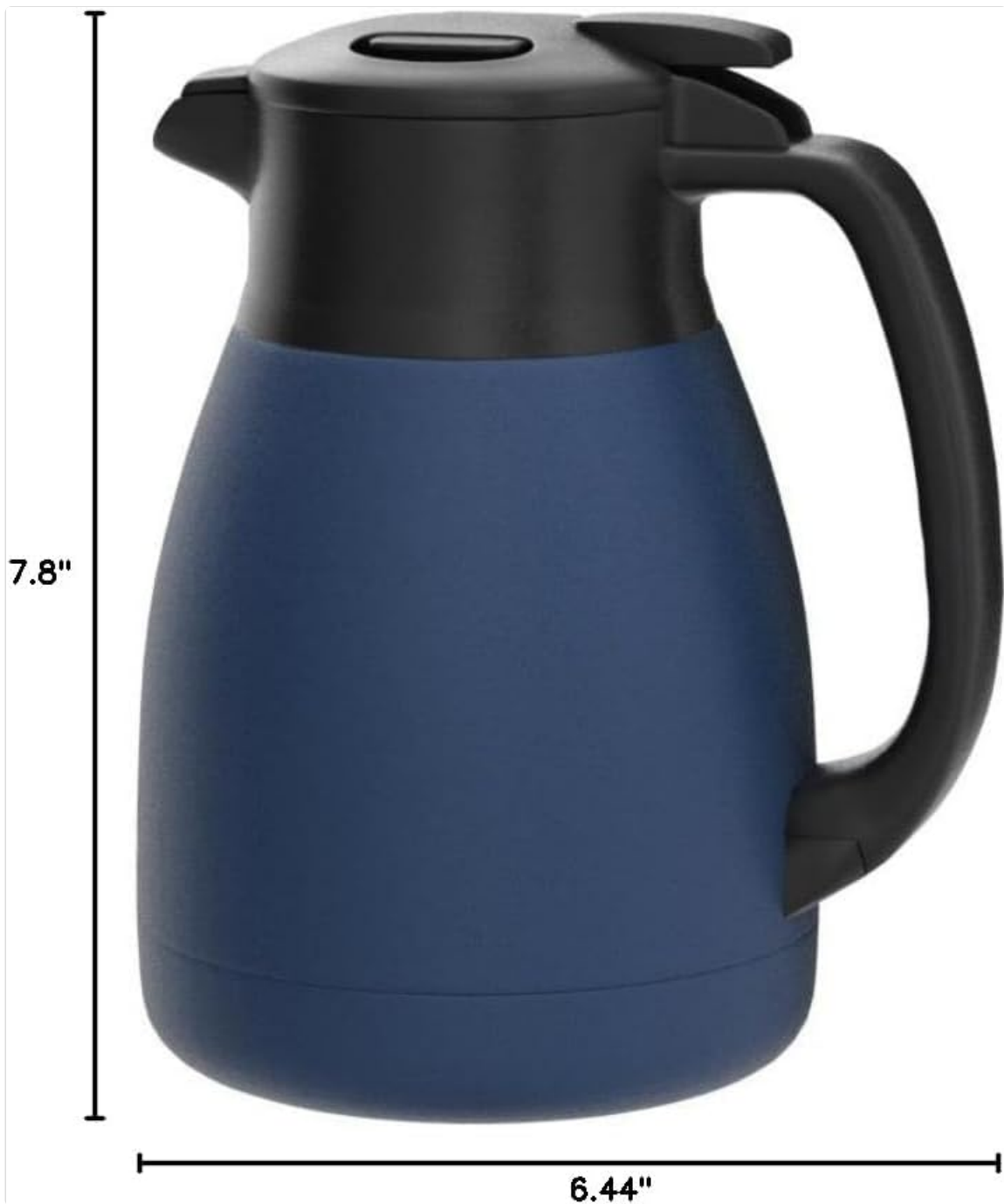
Image: A visual representation of the Zojirushi SH-HC10AD carafe's dimensions, showing its height of 7.8 inches and width of 6.44 inches.