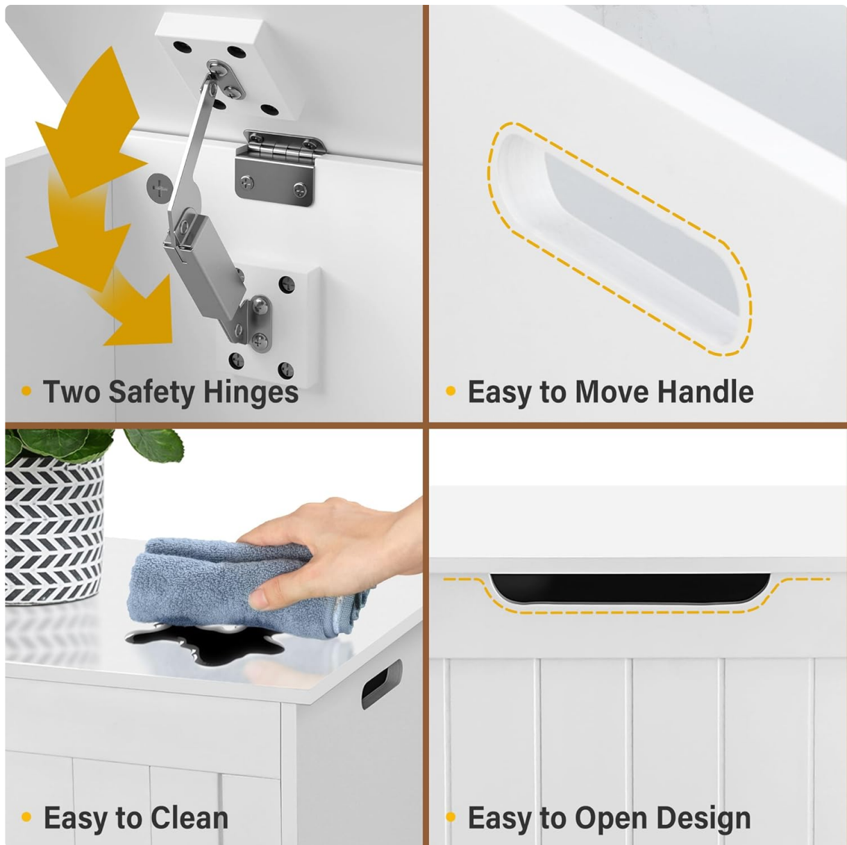
Image: Close-up of the bench's features, including safety hinges and handles, which are crucial for assembly and safe operation.