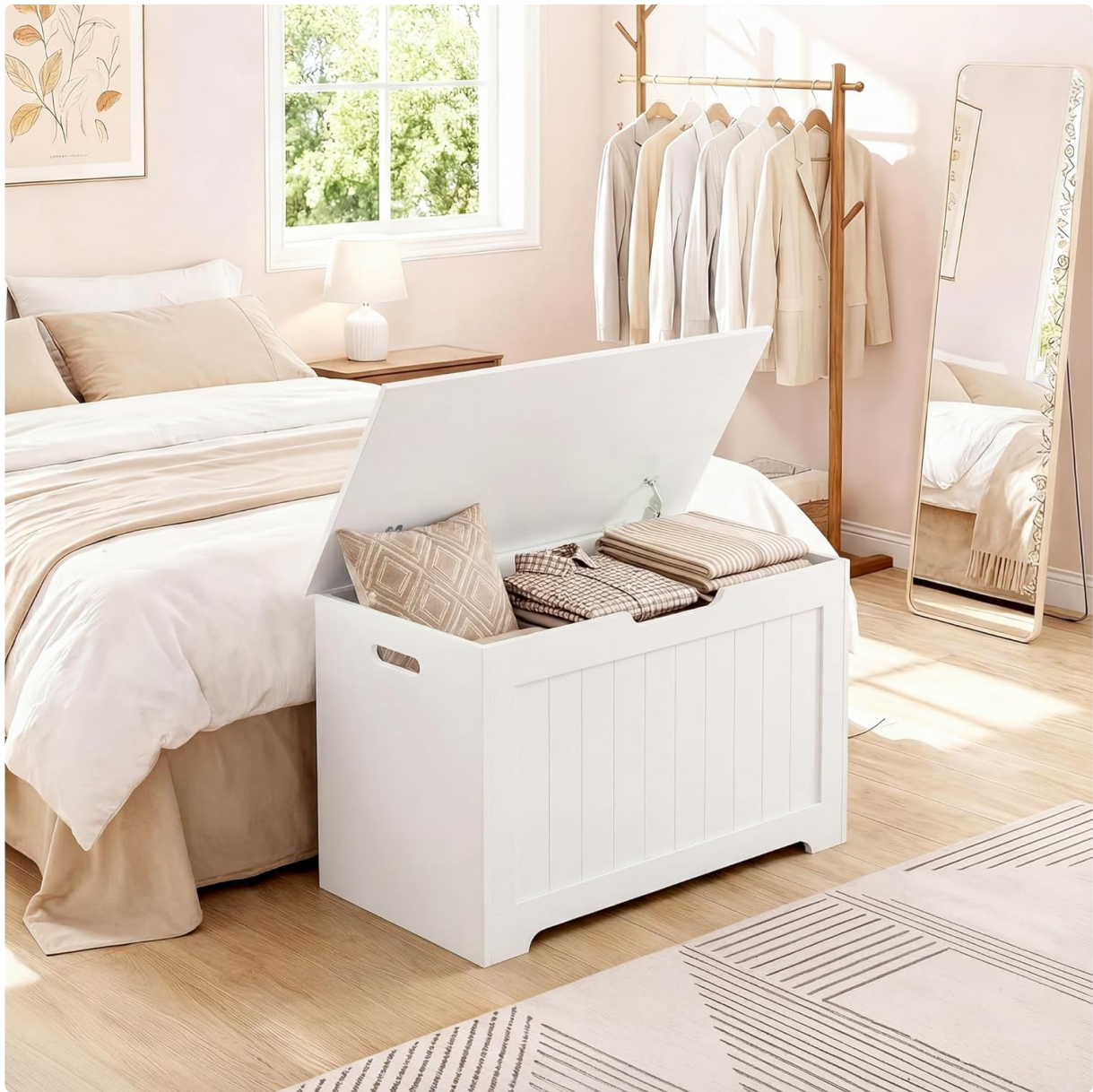
Image: The storage bench used in a bedroom setting, illustrating its large storage capacity for blankets and other items.