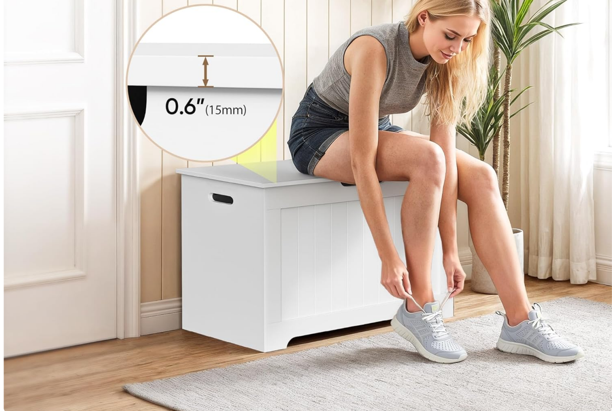
Image: The bench supporting weight, indicating its sturdy construction and suitability for seating.

0.6in/15mm thick top plate provides up to 400 pounds weight capacity