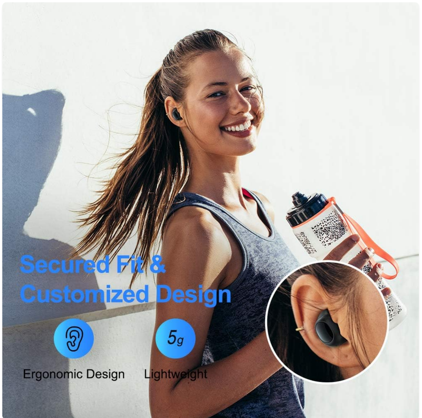
Figure 4.1: A person wearing the ELECDER D19 earbuds during a workout, demonstrating the secure and comfortable fit provided by the ergonomic design and customizable ear tips.