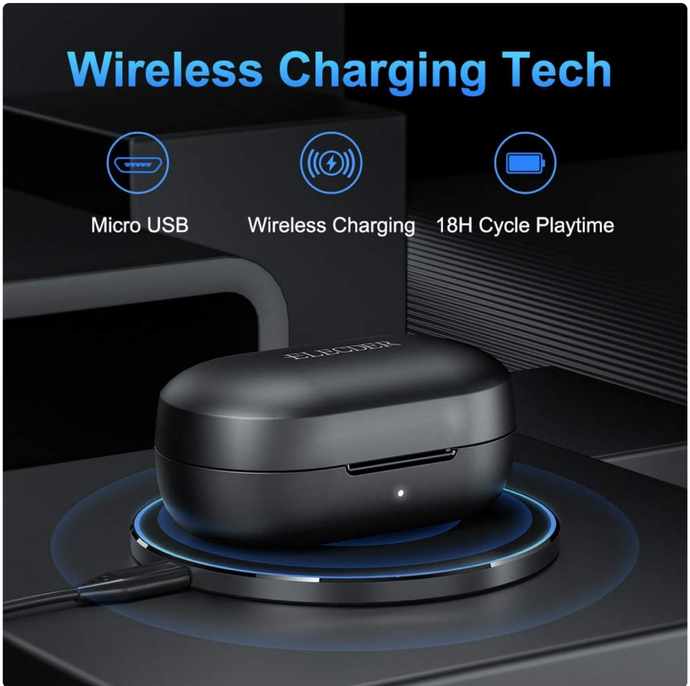
Figure 3.1: The ELECDER D19 charging case being charged wirelessly on a charging pad, also showing the Micro USB port for wired charging. This image highlights the dual charging capabilities of the case.

A full charge for the earbuds provides approximately 4.5 hours of music playback, and the charging case provides an additional 18 hours of battery life.