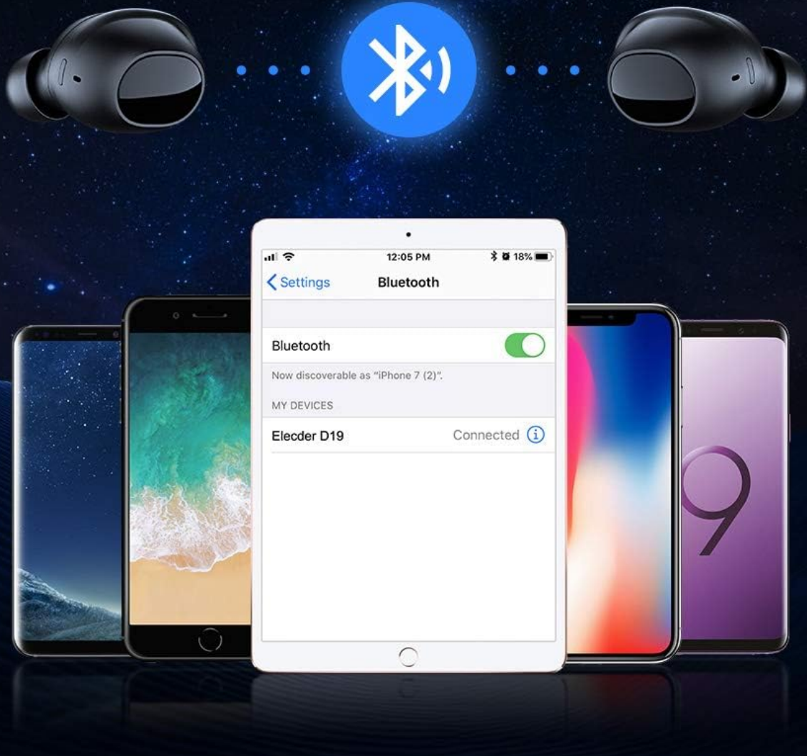
Figure 3.3: An illustration showing the stable Bluetooth connection between the ELECDER D19 earbuds and various smart devices, including smartphones and tablets.

Support smart phones, tables, Bluetooth digital devices