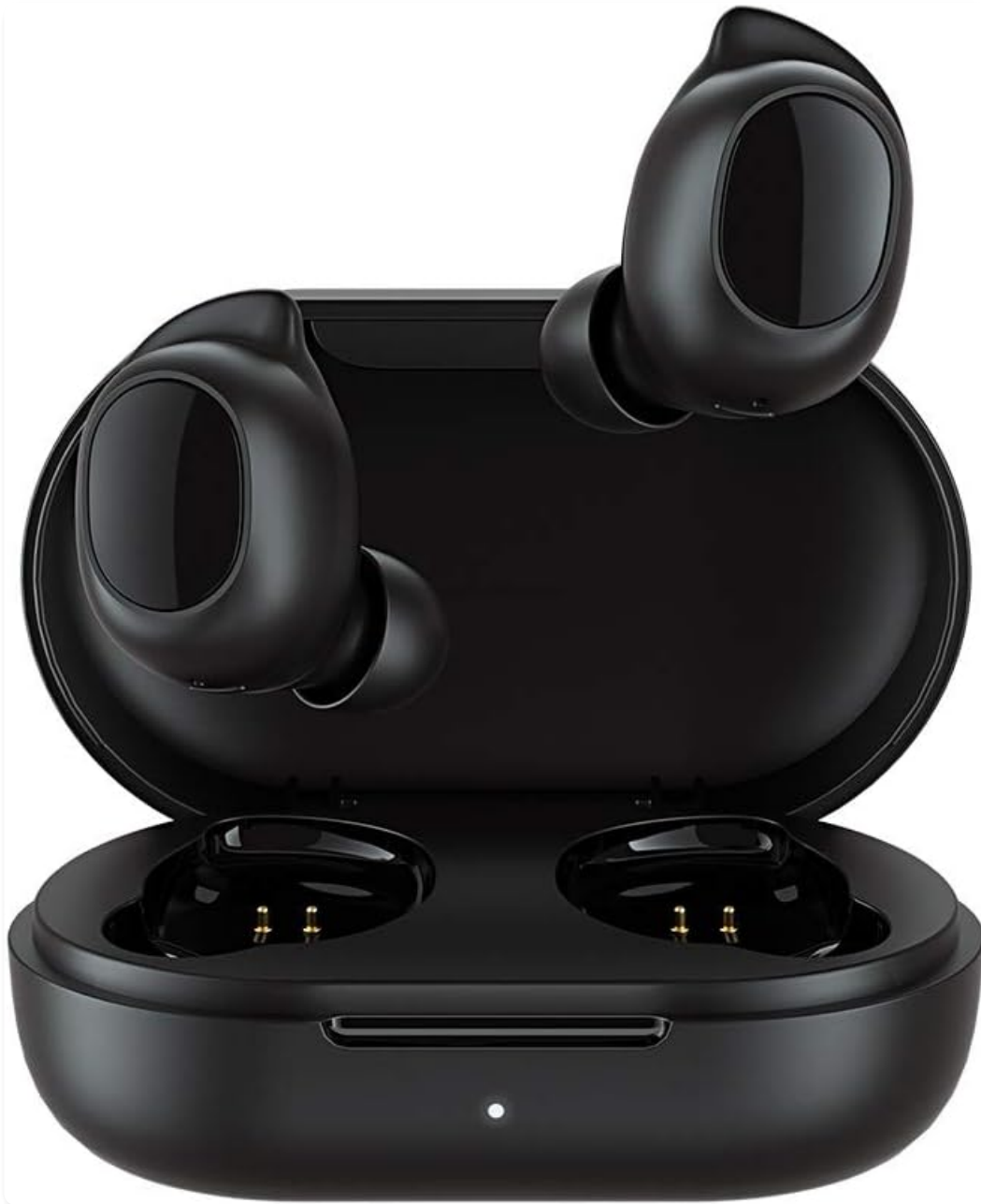
Figure 2.1: ELECDER D19 True Wireless Earbuds in their charging case. The earbuds are black, sleek, and designed for in-ear use, while the compact charging case is also black with a smooth finish.