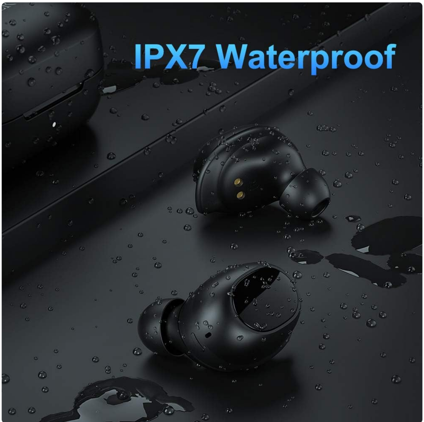
Figure 5.1: The ELECDER D19 earbuds shown with water droplets, illustrating their IPX7 waterproof rating, which protects them from sweat, rain, and splashes.

Note: The charging case is not waterproof. Ensure earbuds are dry before placing them back into the charging case.