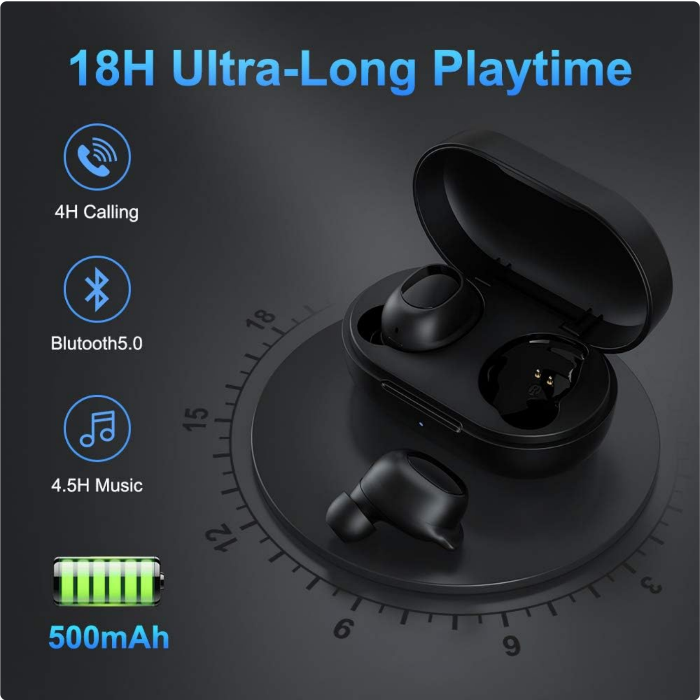
Figure 7.1: An infographic detailing the battery life of the ELECDER D19 earbuds and charging case, showing 4 hours for calls, 4.5 hours for music, and a total of 18 hours with the 500mAh charging case.