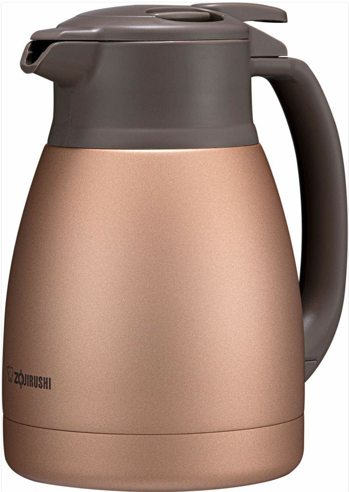
Image: The Zojirushi SH-HC10NU Stainless Steel Vacuum Bottle in Matte Copper finish.