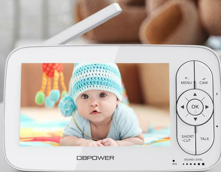
Figure 4: One-press zoom function