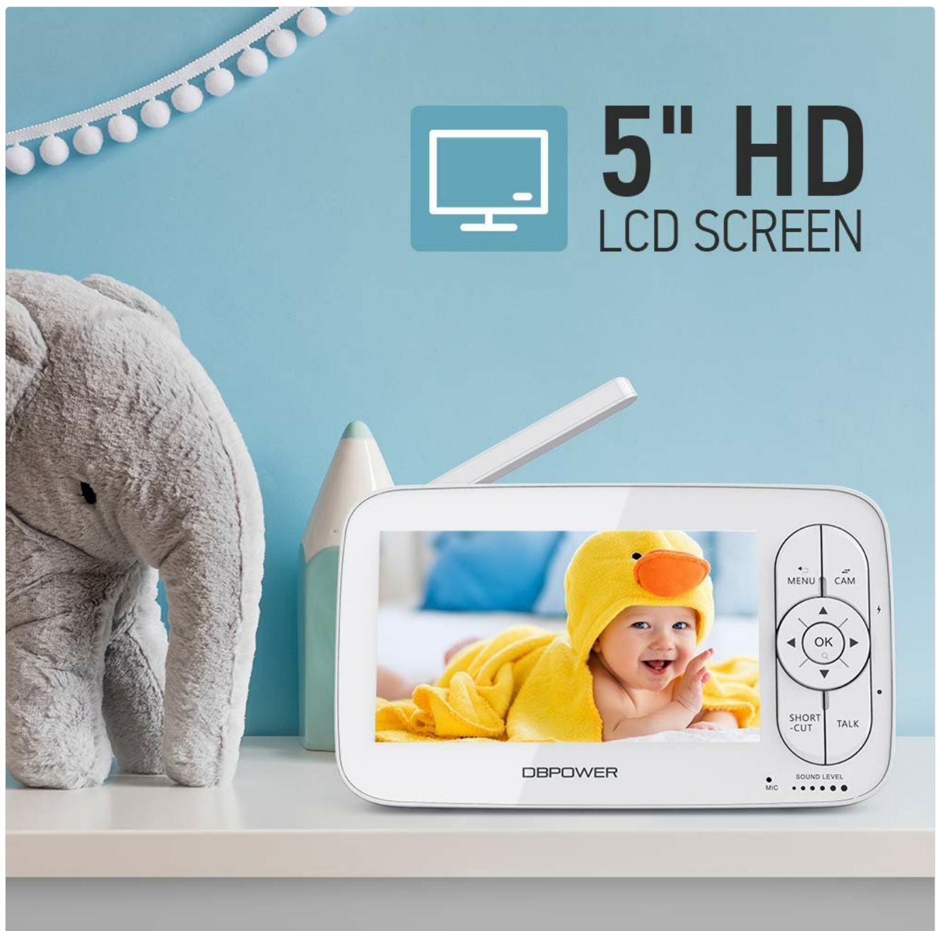
Figure 1: DBPOWER 5-inch HD Video Baby Monitor