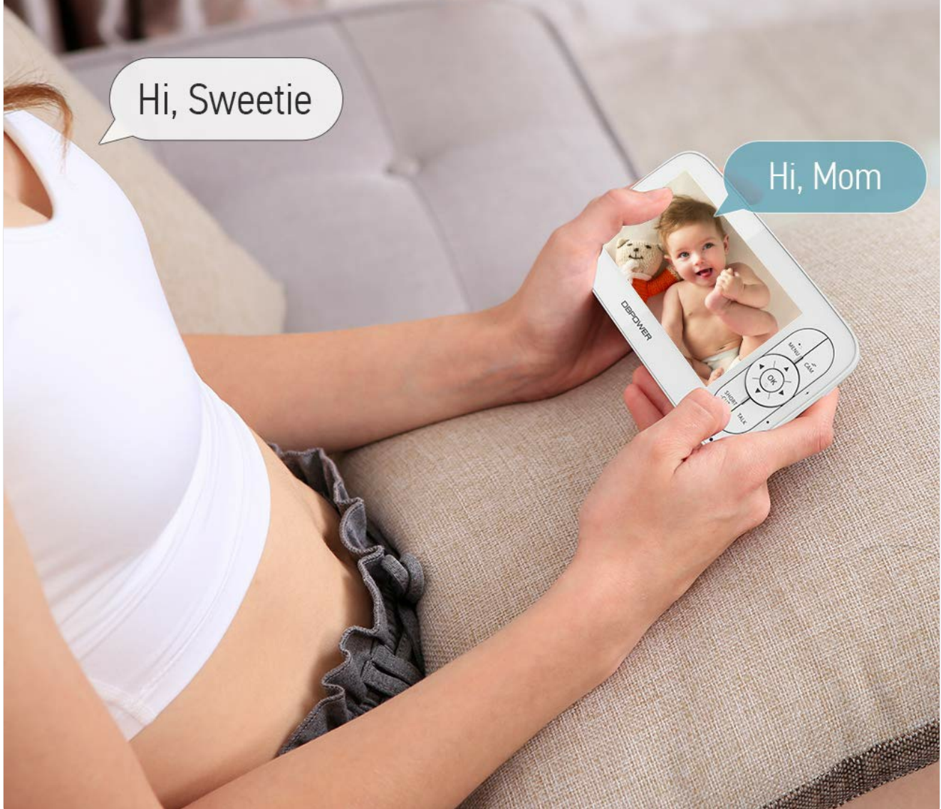
Figure 5: Two-Way Talk feature