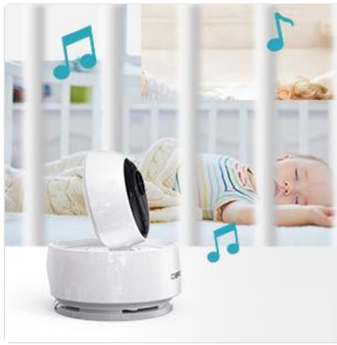
Figure 7: Lullabies feature icon