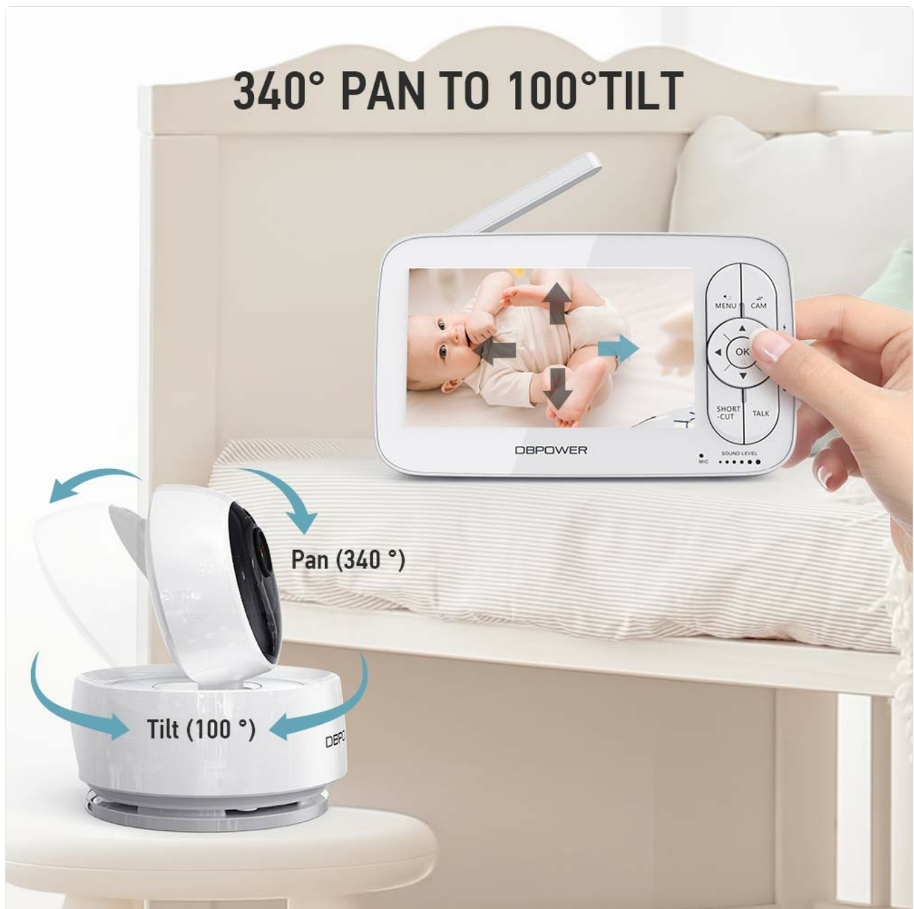
Figure 2: Proper placement and pan/tilt functionality of the Baby Unit