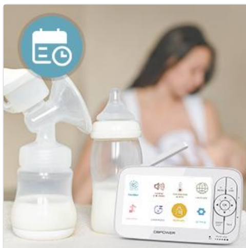
Figure 8: Feeding Reminder feature icon