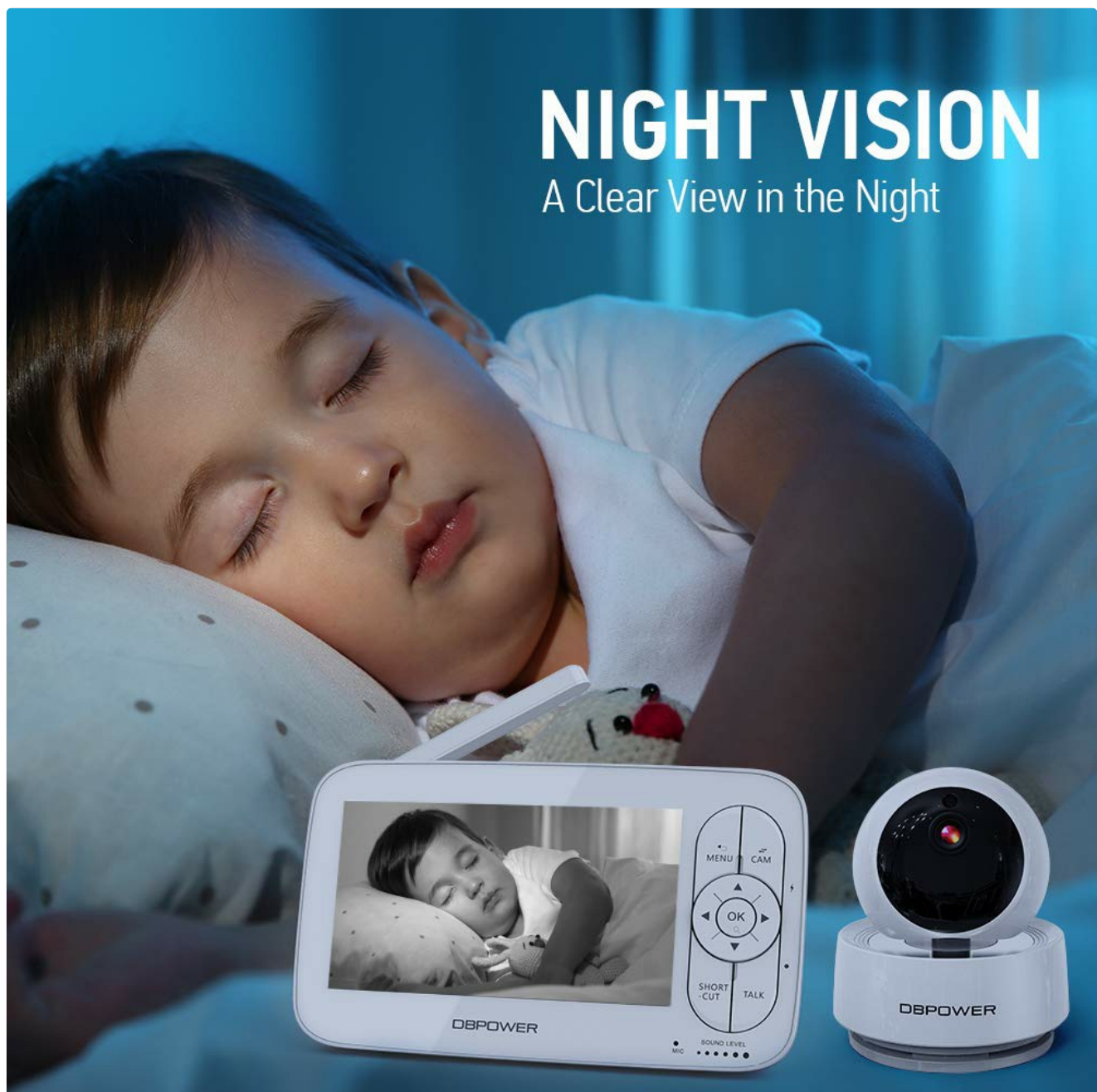
Figure 6: Night Vision in action