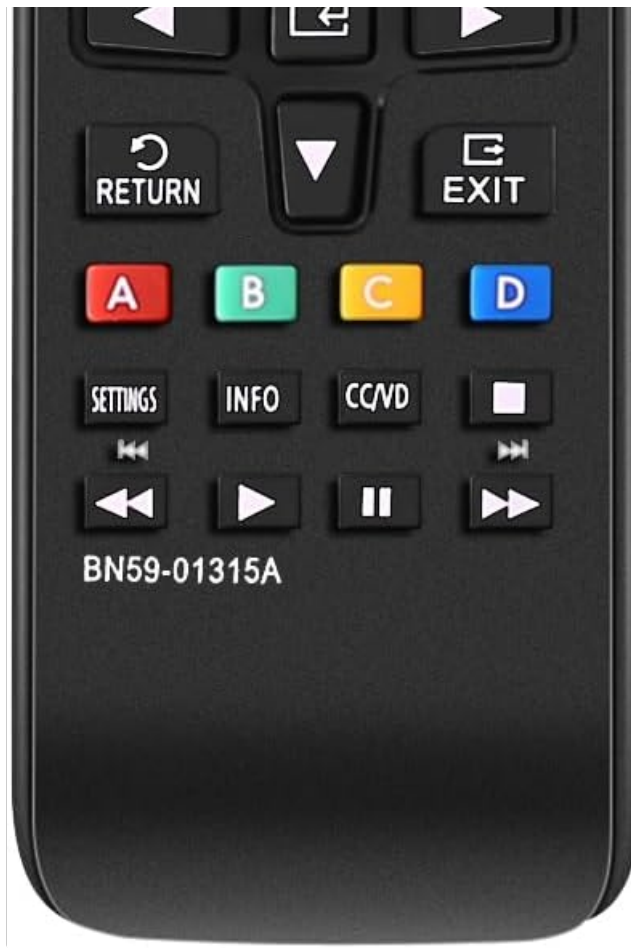
Image: The EONCHARM Universal Remote Control, showing its full button layout.