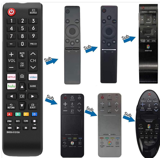
Image: A visual comparison demonstrating how the EONCHARM remote can substitute for various other Samsung remote models, highlighting its universal replacement capability.