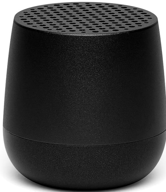
Image: The Lexon MINO+ Portable Bluetooth Speaker, a small, sleek black cylindrical device with a perforated top for sound output.