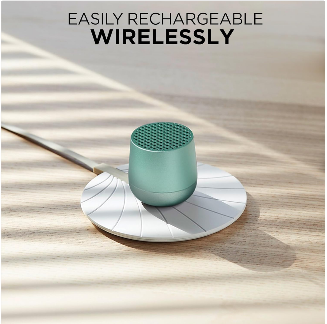
Image: A green Lexon MINO+ speaker being charged wirelessly on a white, circular Qi charging pad, demonstrating its wireless charging capability.

A full charge takes approximately 1 hour and provides up to 3 hours of playback time.