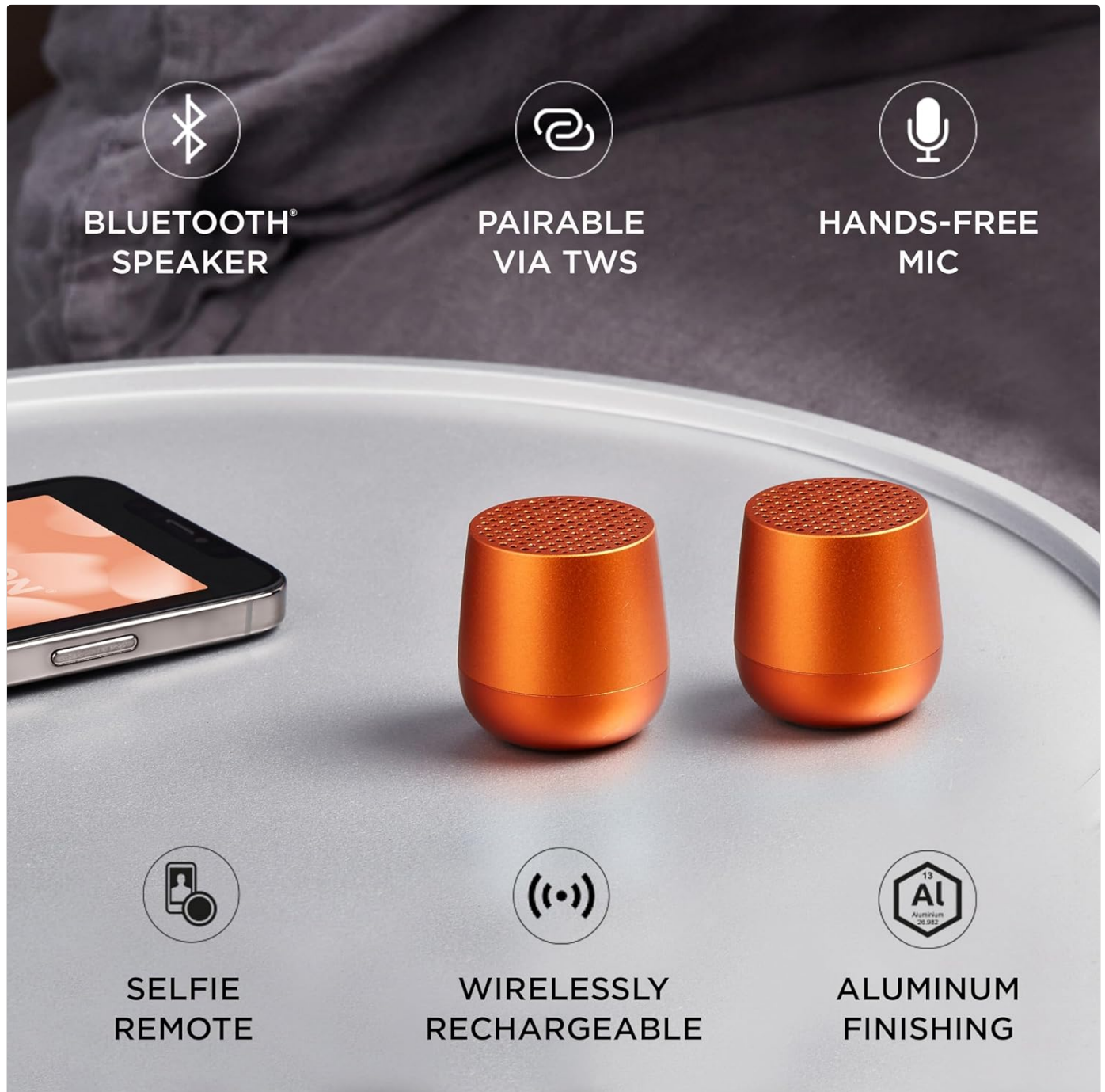
Image: An illustration of the Lexon MINO+ speaker's key features, including Bluetooth connectivity, TWS pairing, hands-free microphone, selfie remote function, wireless recharging capability, and its aluminum construction.