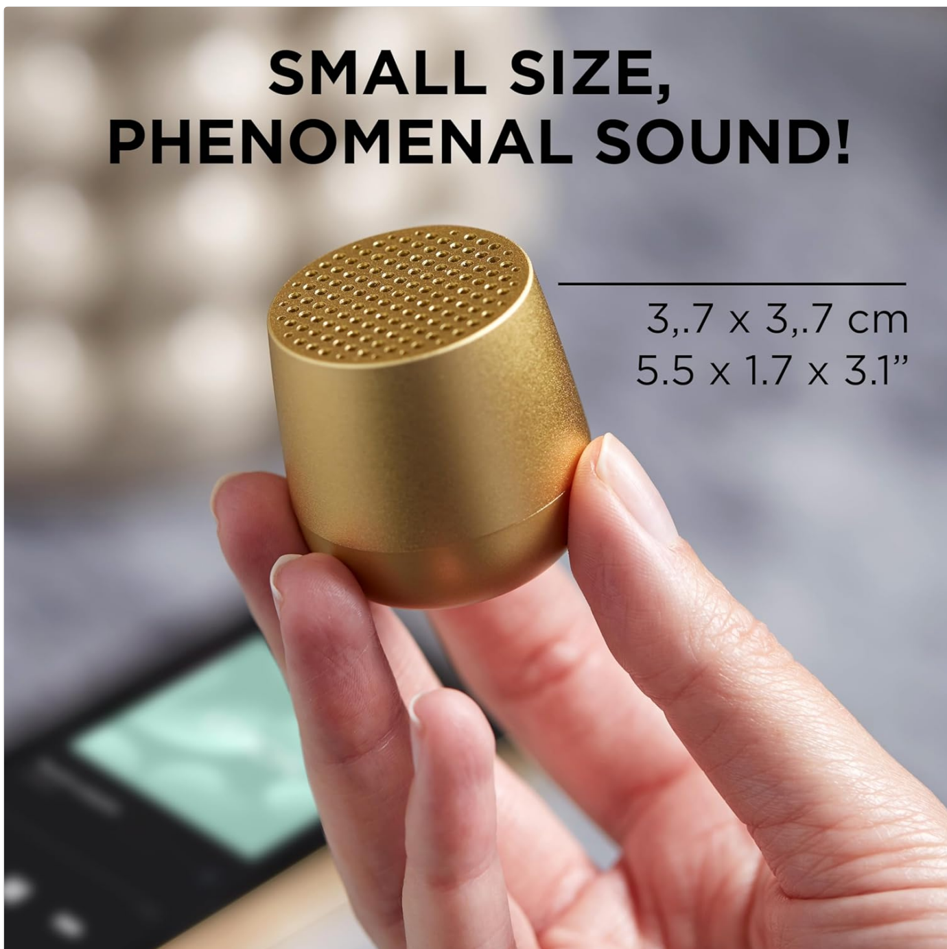
Image: A gold Lexon MINO+ speaker held in a hand, emphasizing its compact size and providing its dimensions in both metric and imperial units.