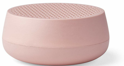
Image: The Lexon MINO S speaker in pink, showcasing its compact, round design with a perforated top for sound output.

The Lexon MINO S is a compact, pocket-sized Bluetooth speaker designed for portability and high-definition sound. This manual provides essential information for setting up, operating, and maintaining your speaker.