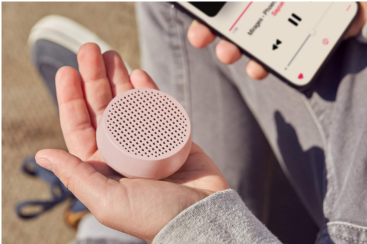
Image: A person holding the Lexon MINO S speaker in their hand, highlighting its compact and portable design.