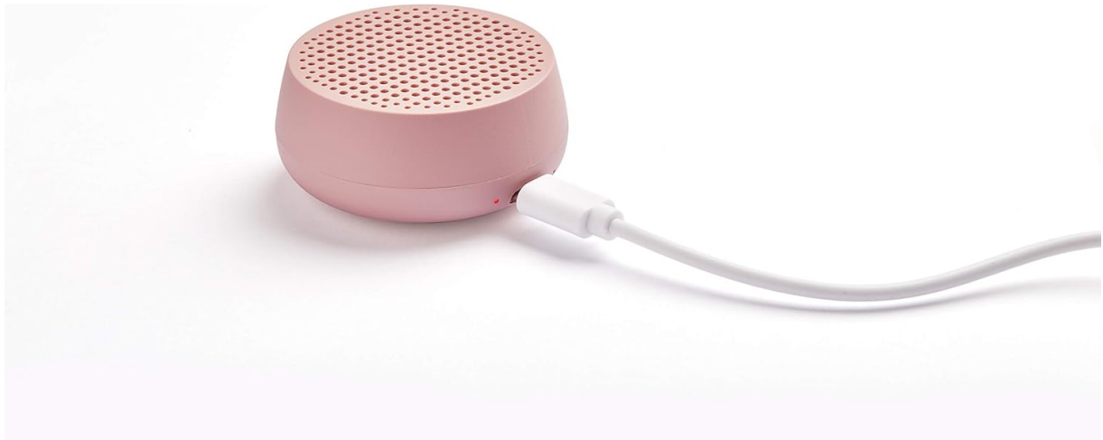
Image: The Lexon MINO S speaker in pink, with a white USB-C cable plugged into its charging port, indicating the charging process.