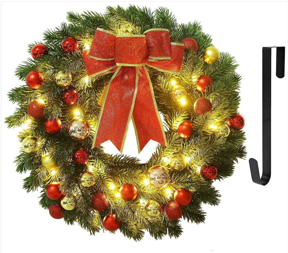
Image: The complete wreath with its included metal hanger, ready for display.