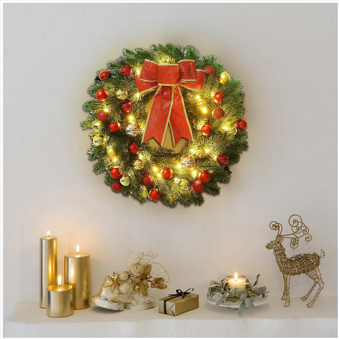
Image: A detailed view of the red bow and decorative balls on the wreath.