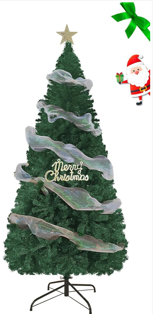
Image: The PLKO 10FT Artificial Spruce Hinged Christmas Tree, showcasing its full form and indicating that decorations are not included but are shown for illustrative purposes.