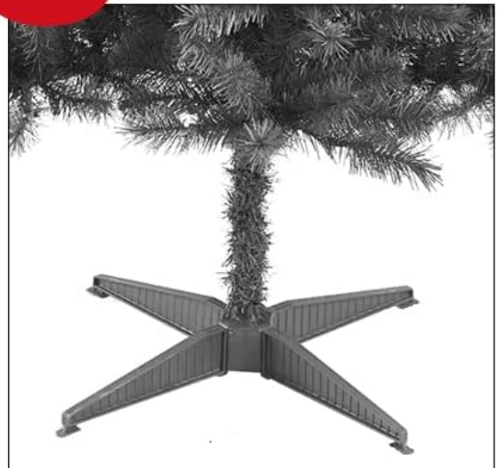
Image: A comparison highlighting the sturdy metal stand provided with the PLKO tree, designed for stability and floor protection, versus a less stable plastic alternative.