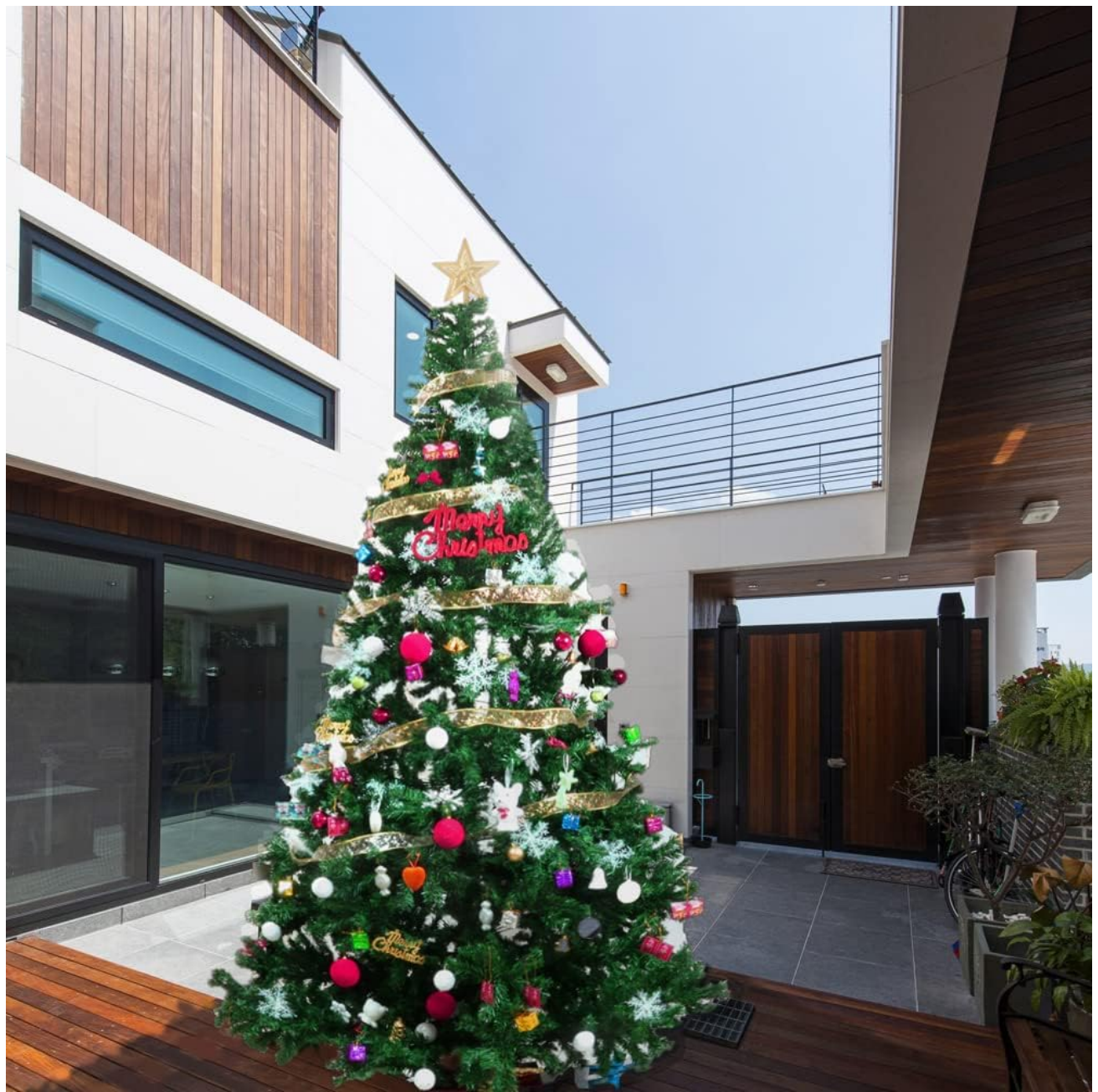
Image: The PLKO 10FT Artificial Spruce Hinged Christmas Tree positioned on an outdoor patio, demonstrating its suitability for both indoor and outdoor holiday decor.