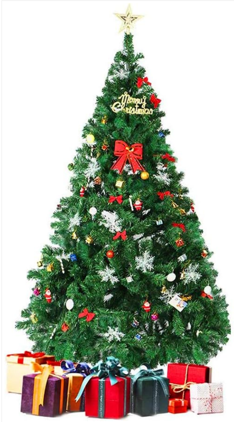
Image: A fully decorated PLKO 10FT Artificial Spruce Hinged Christmas Tree, adorned with various ornaments and lights, surrounded by wrapped gifts, illustrating its festive appearance.