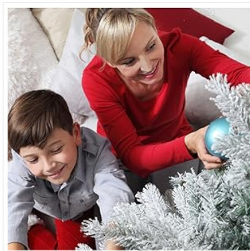
Image: Individuals engaged in decorating a Christmas tree, demonstrating the final stage of setup where ornaments and lights are added.