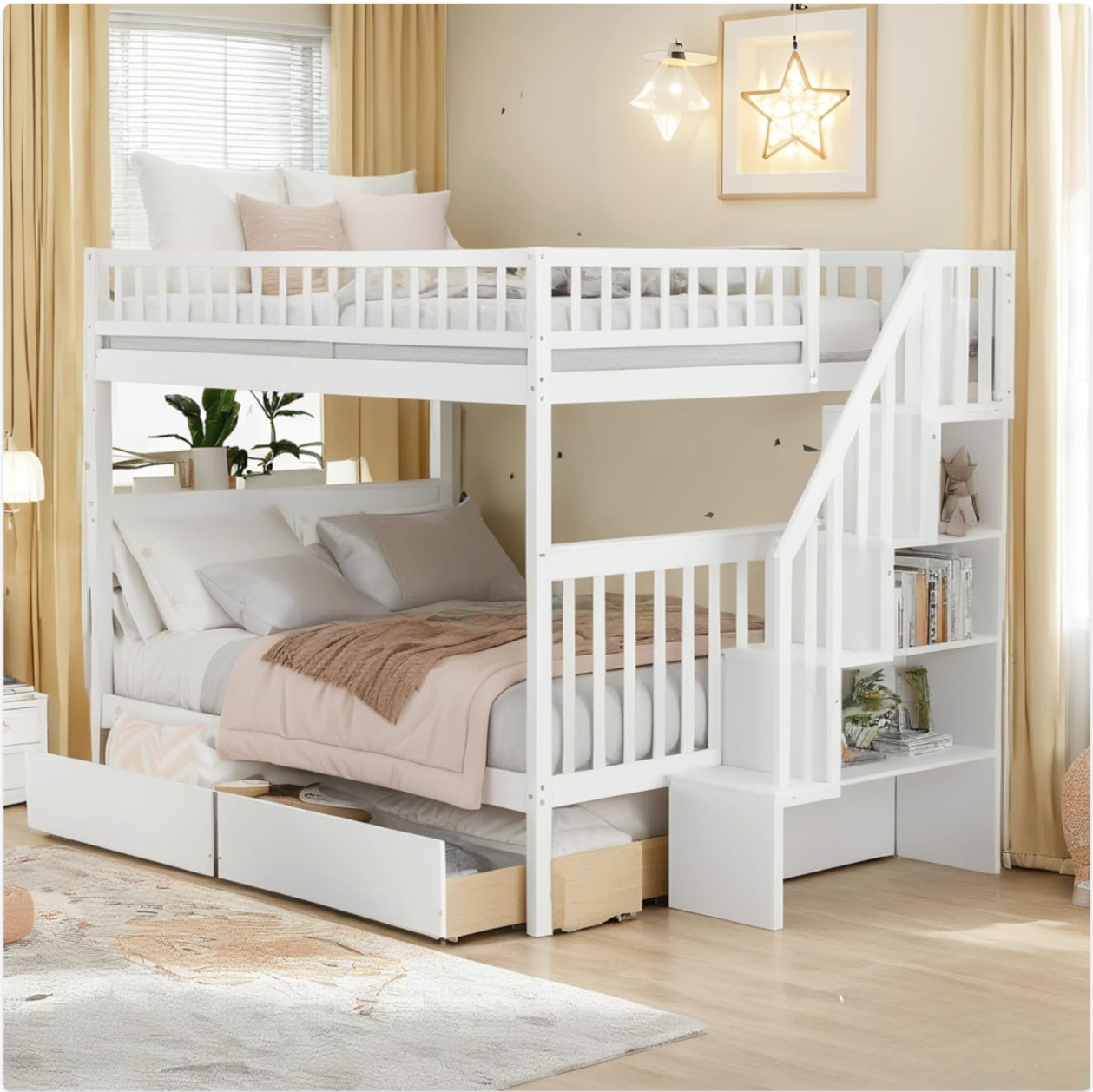
Image: The Bellemave Full Over Full Bunk Bed in white, featuring a top bunk, a bottom bunk, integrated stairs with shelves, and two under-bed storage drawers. The bed is set up in a room with light-colored walls and a rug.