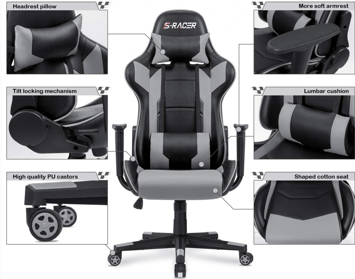
Figure 1: Detailed view of chair components including headrest, lumbar cushion, and castors.