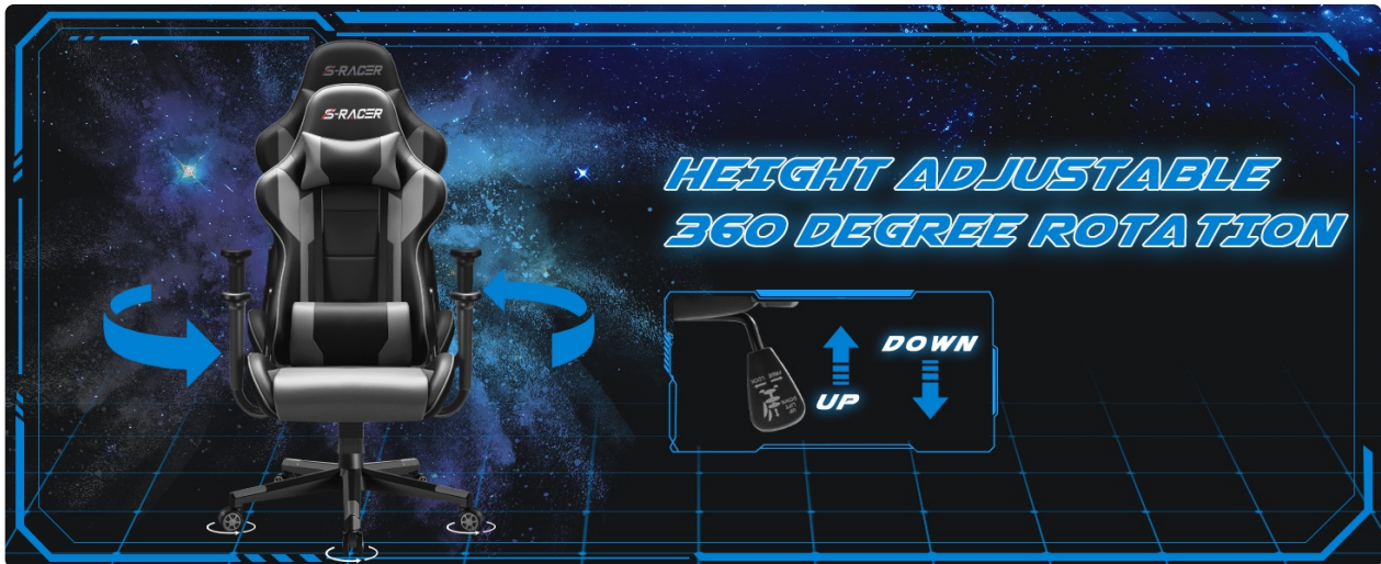
Figure 3: Height adjustment and 360-degree swivel functionality.

To adjust the seat height, locate the lever on the right side beneath the seat. Pull the lever upwards while lifting your body weight off the seat to raise it. To lower the seat, pull the lever upwards while remaining seated. Release the lever to lock the height in place.