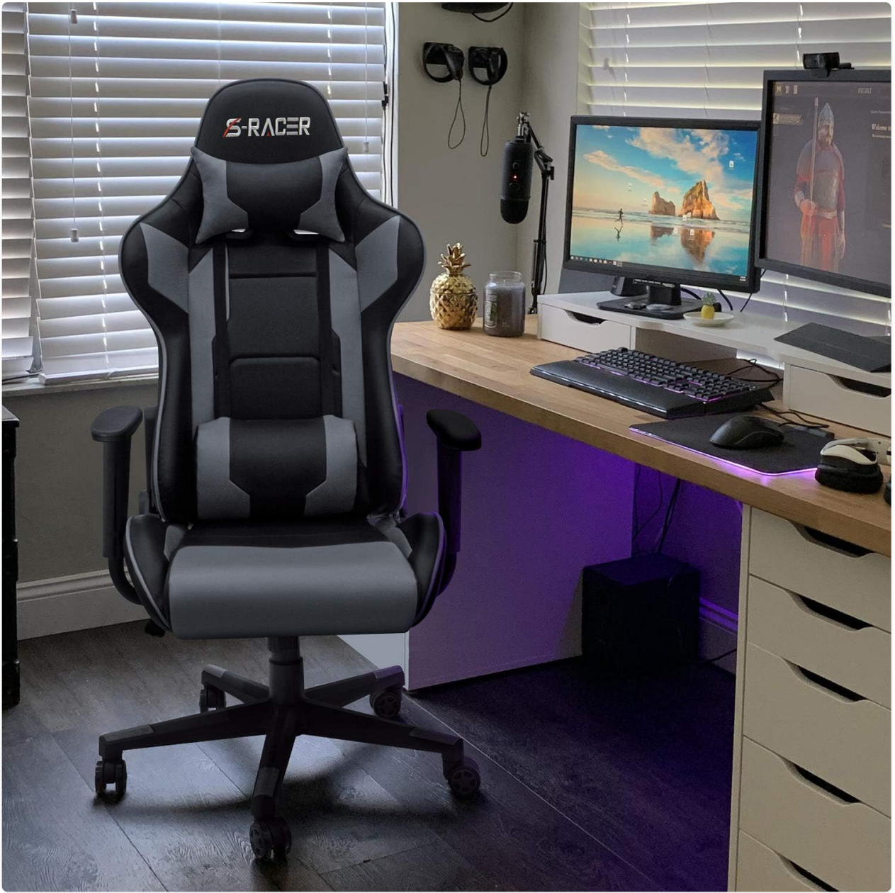
Figure 6: The Homall Gaming Chair in a typical use environment.