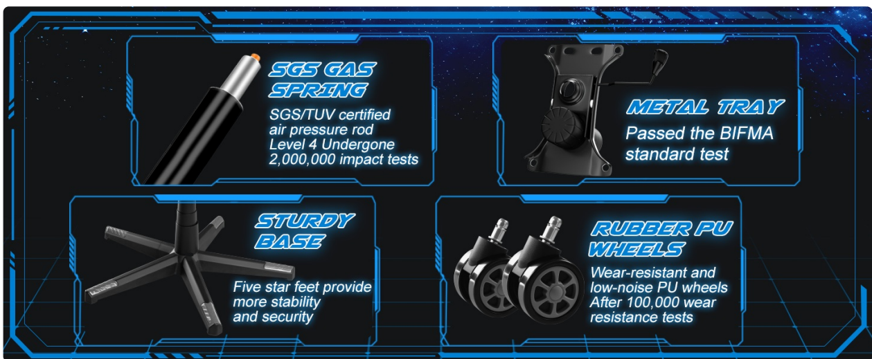
Figure 2: Illustration of the chair's sturdy base, gas lift, and durable wheels.