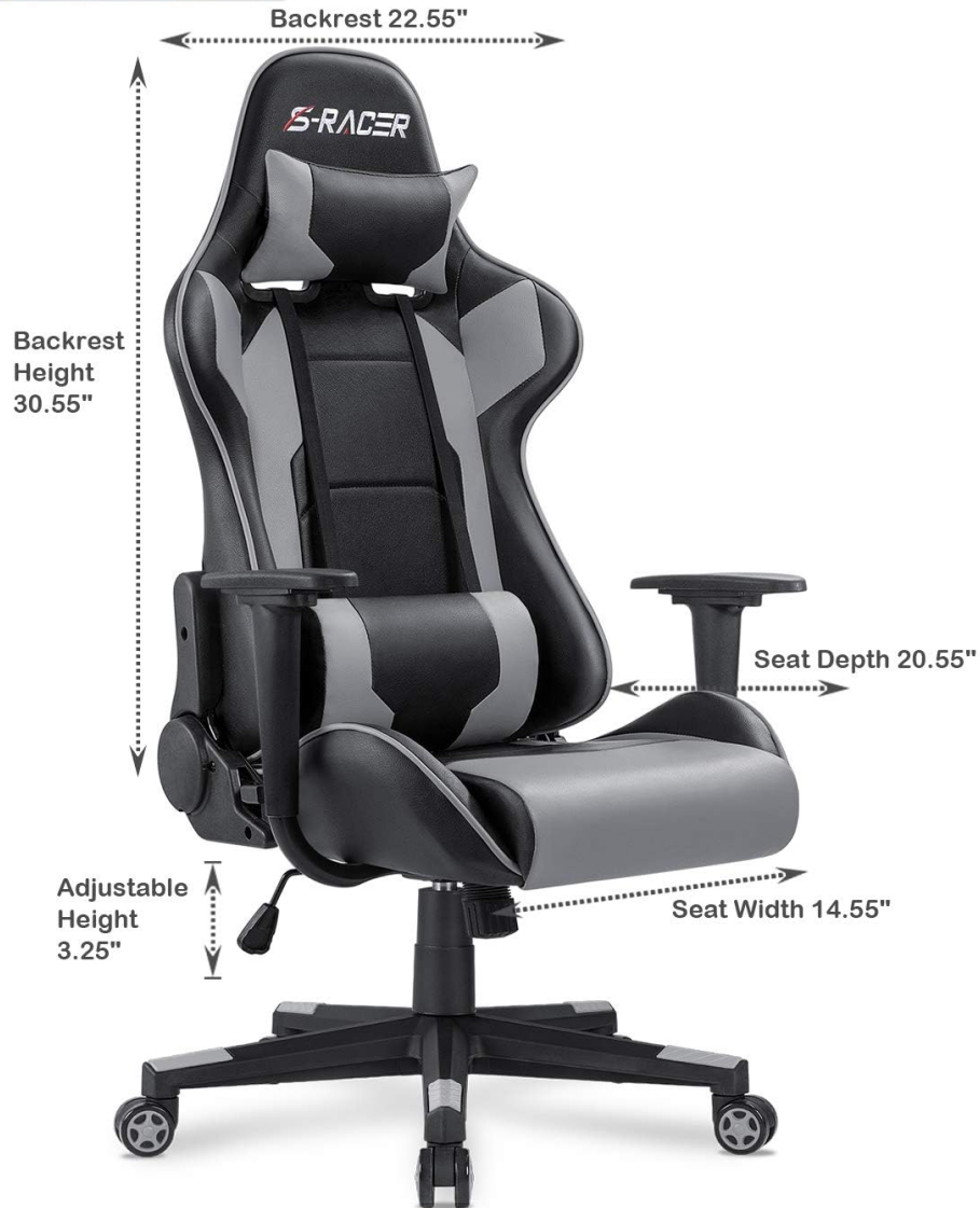
Figure 7: Key dimensions of the Homall Gaming Chair.