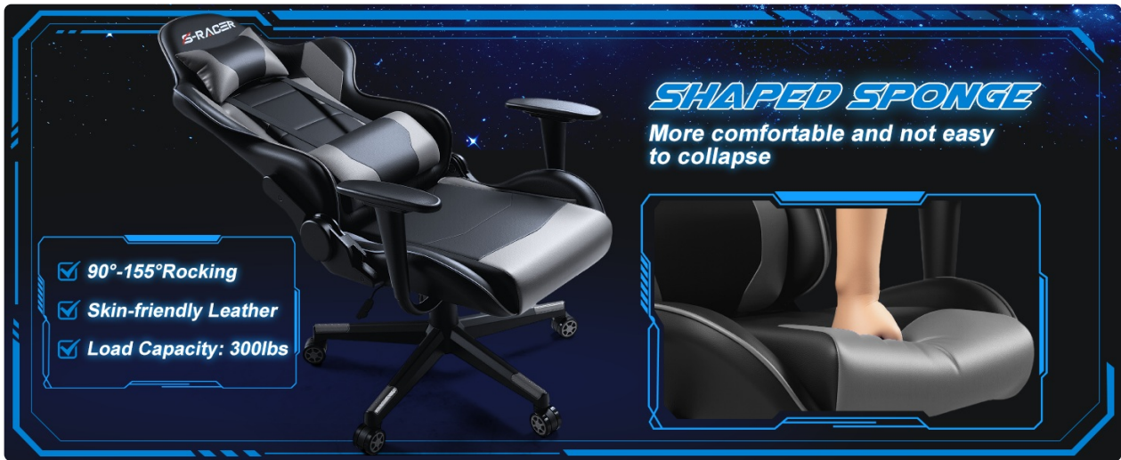
Figure 5: Ergonomic headrest and lumbar support for enhanced comfort.

the backrest straps to find the most comfortable position for your neck and lower back.