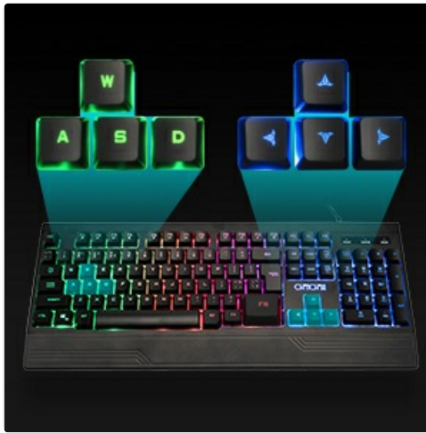
Figure 7: Detachable keycaps facilitate easy cleaning and maintenance of the keyboard.