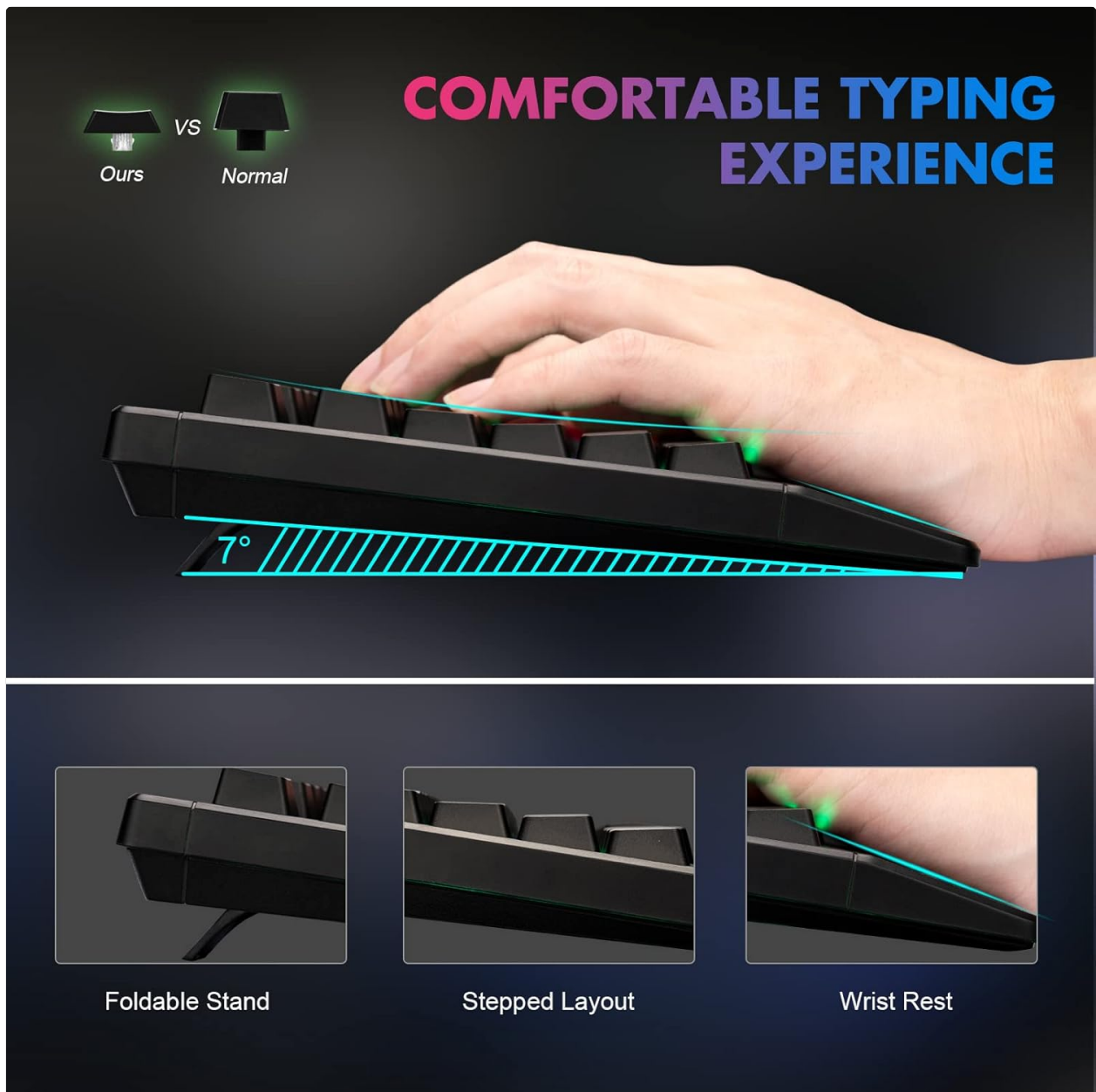
Figure 1: Ergonomic design of the CHONCHOW T931 keyboard, highlighting the integrated wrist rest, stepped key layout, and foldable feet for adjustable typing angle.