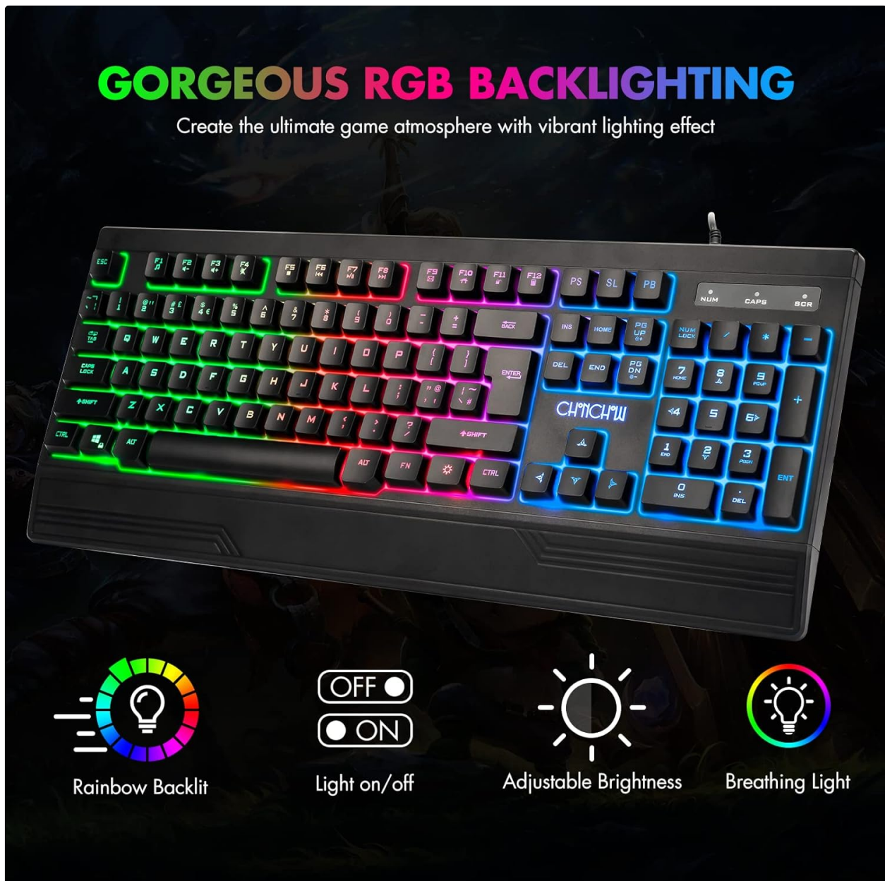
Figure 2: The CHONCHOW T931 keyboard showcasing its vibrant rainbow LED backlighting and indicators for various lighting controls.