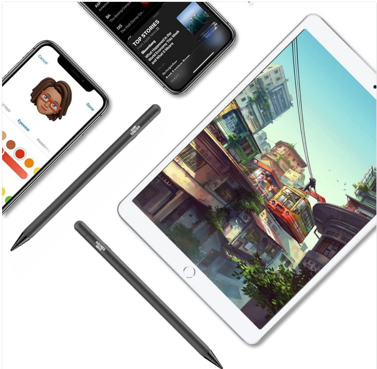
Two KSW KINGDO Stylus Pens shown in use with an iPad and an iPhone, demonstrating its application for general navigation and interaction with touch screen devices.