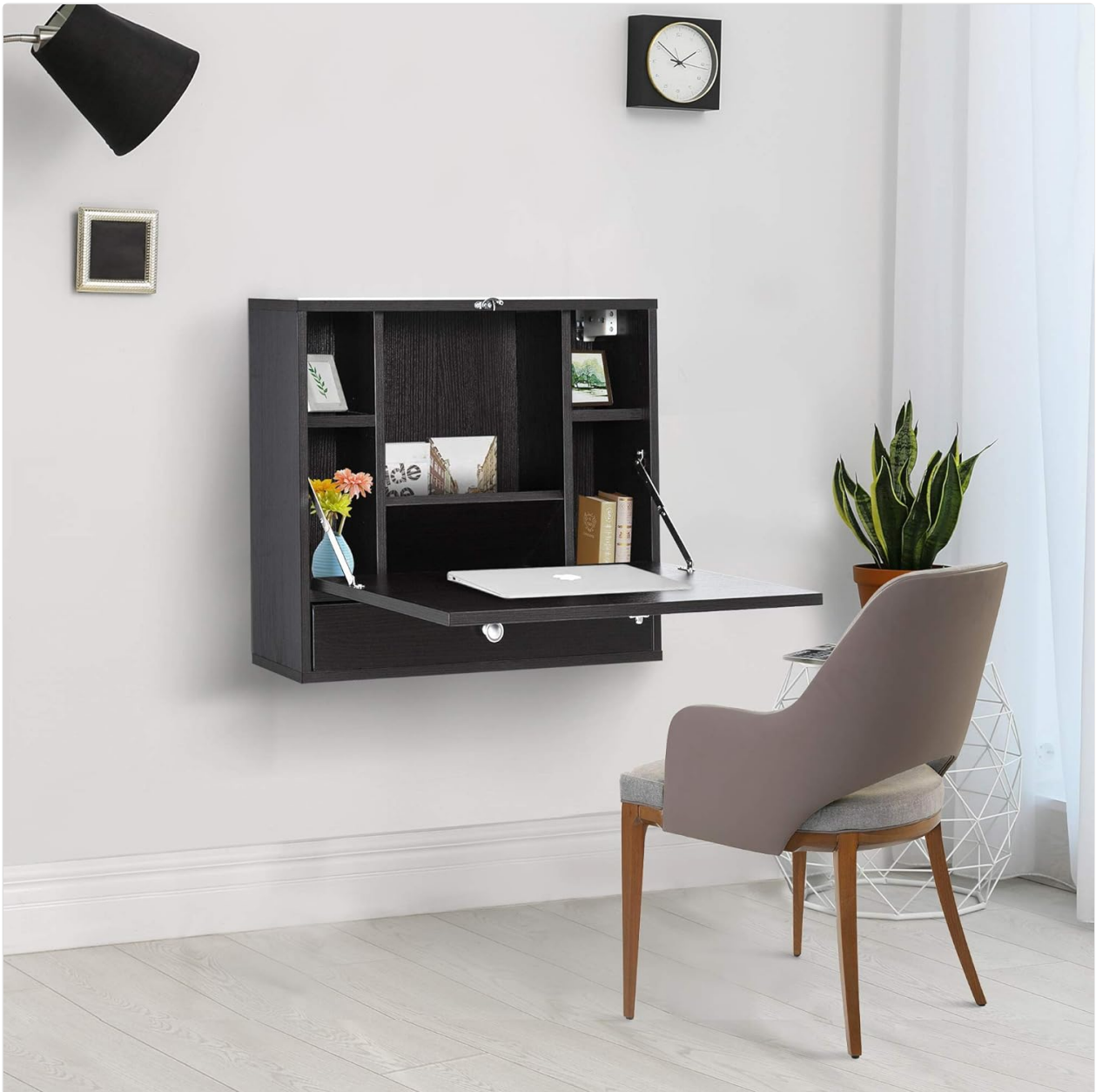
Figure 2: The desk fully assembled and mounted, with the tabletop open for use.