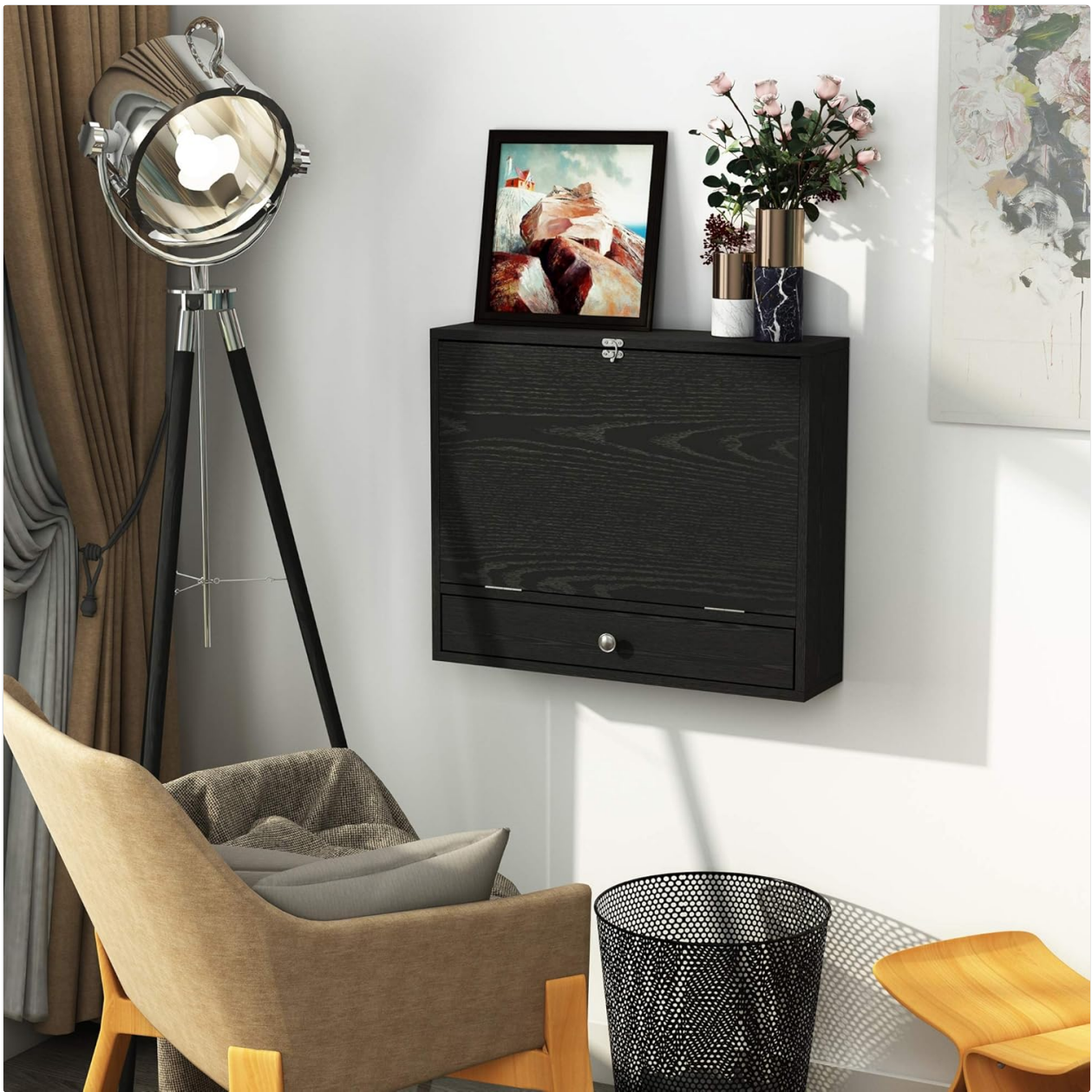
Figure 1: Overview of desk components and storage areas.