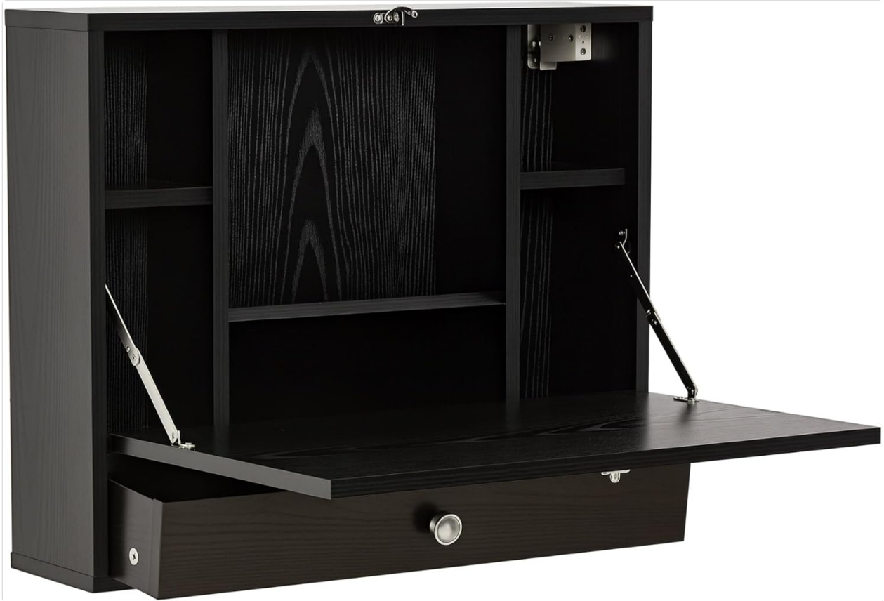
Figure 3: Desk in open position, showcasing internal storage and drawer.