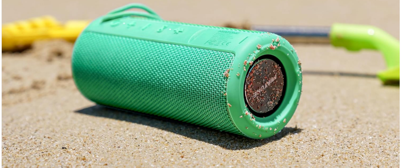
Figure 6: Speaker on sand, showcasing its shockproof and dustproof design.

A seamless mesh and rubbers on both ends will absorb potential damage and softy cushion after big falls.