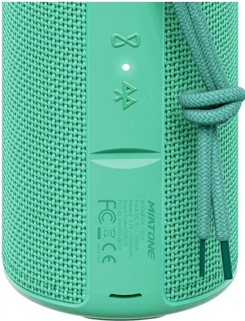
Figure 1: MIATONE Boombox Portable Bluetooth Speaker (Green)