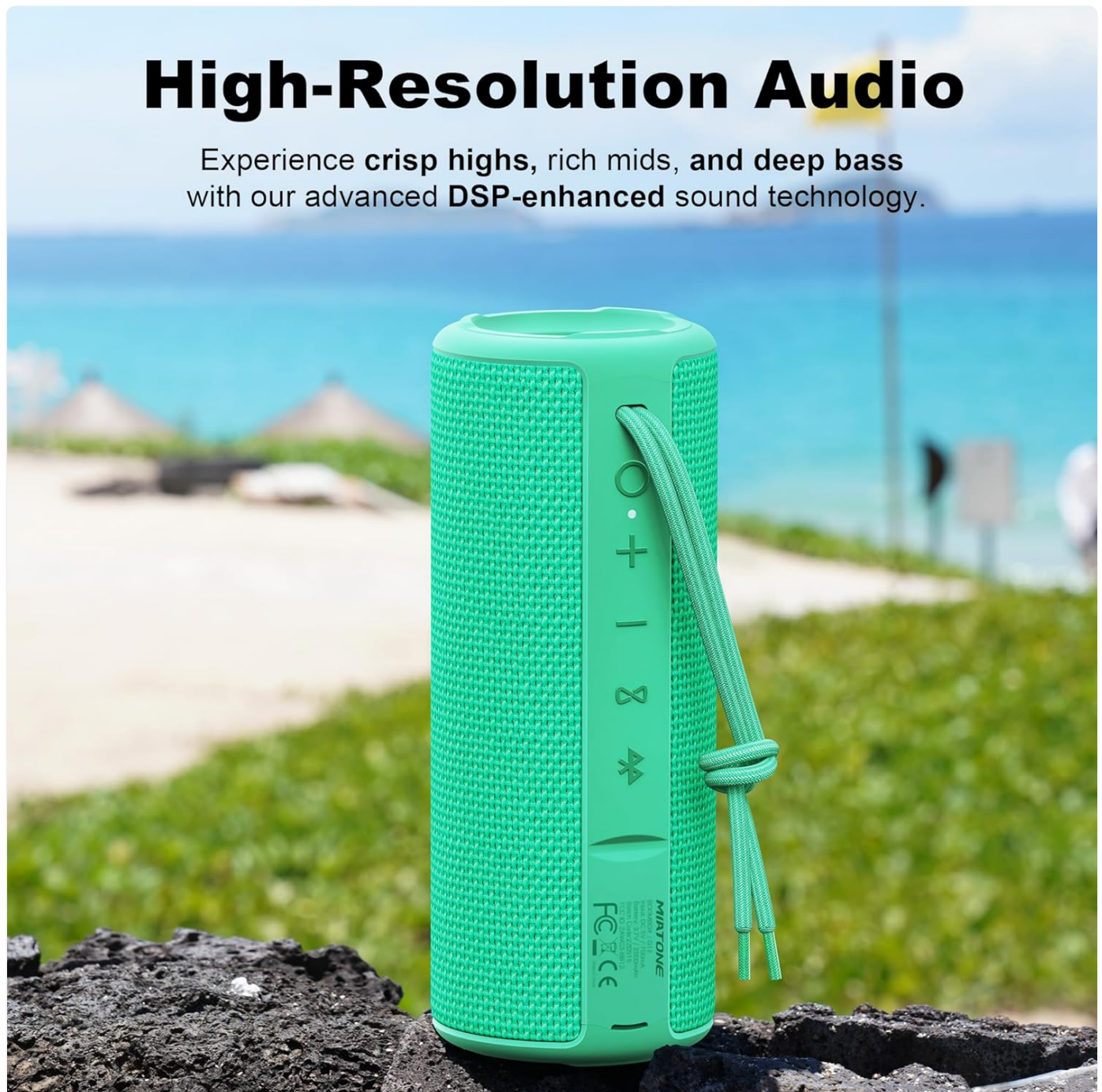
Figure 4: Speaker delivering high-resolution audio in an outdoor setting.

Control playback (play/pause, skip tracks) directly from your connected Bluetooth device. The speaker's buttons may also offer basic playback controls (e.g., single press for play/pause, long press for next/previous track, refer to specific button icons on the device).