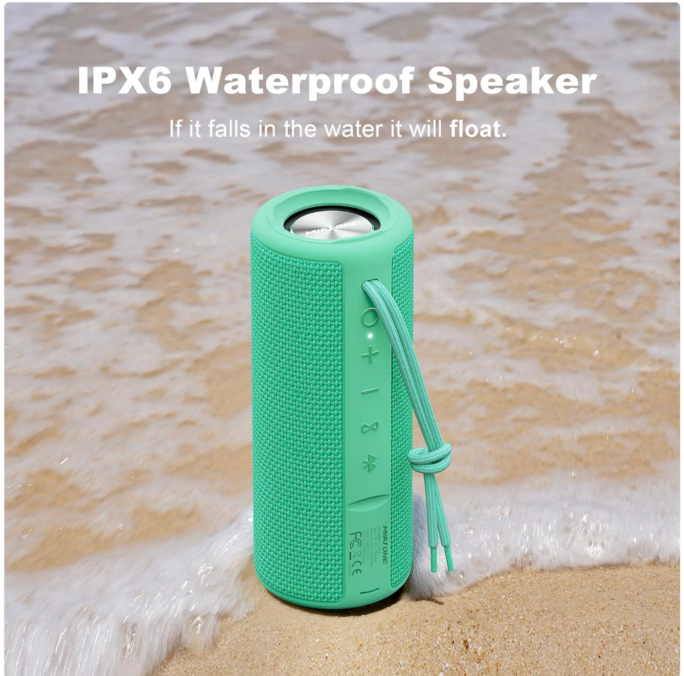
Figure 5: Speaker floating in water, highlighting its waterproof capability.

The speaker is IPX6 waterproof, meaning it can withstand powerful water jets. Do not submerge the speaker for extended periods or expose it to high-pressure water streams. Always ensure the port cover is sealed tightly to maintain water resistance.