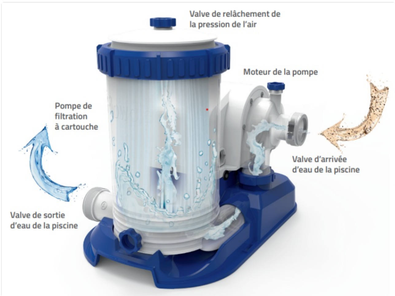
Figure 5: Diagram illustrating the filter pump's operation, showing water intake, filtration, and output.