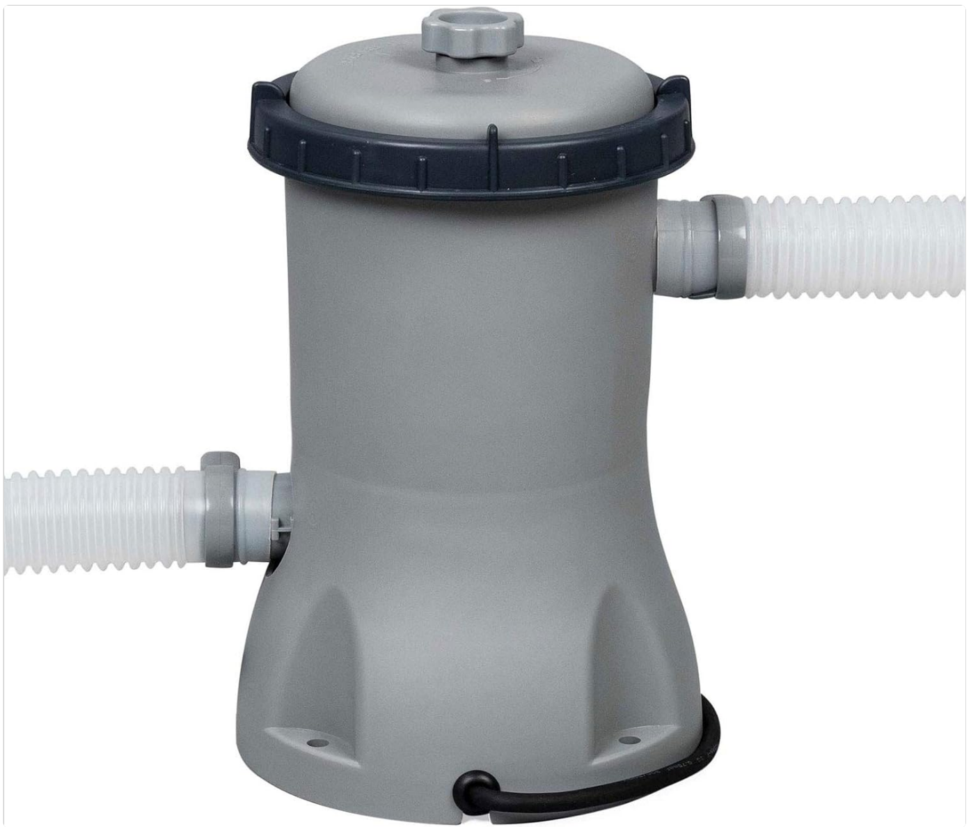
Figure 7: A Type II filter cartridge, essential for pump filtration.