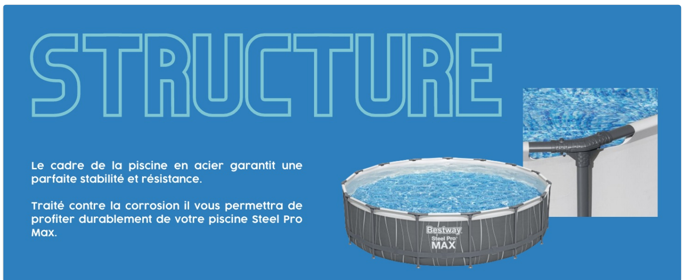
Figure 3: Detail of the corrosion-resistant steel frame structure.