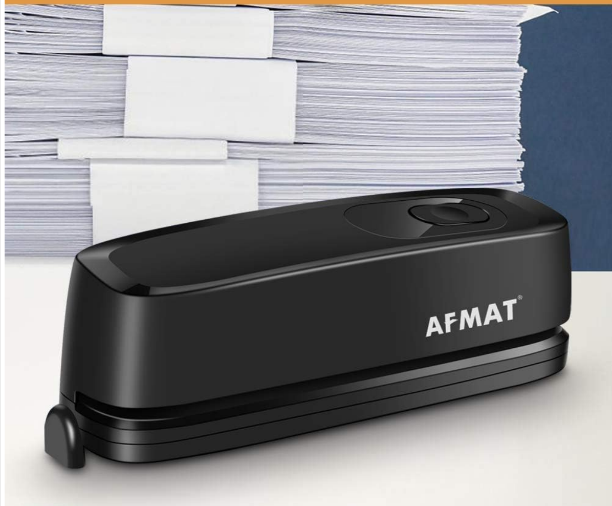
Image: The AFMAT Electric 3 Hole Punch, highlighting its design for saving time.