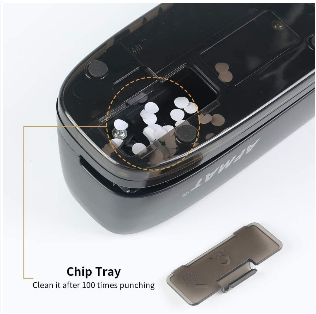
Image: The transparent chip tray on the underside of the punch, indicating when it needs to be cleaned.