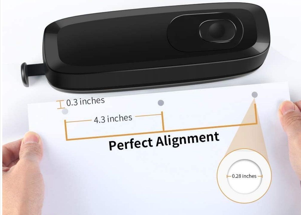
Image: A diagram illustrating the 3-hole punching and perfect alignment using the paper guide.