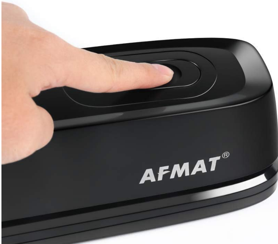
Image: A hand pressing the button for fast punching in 1 second.