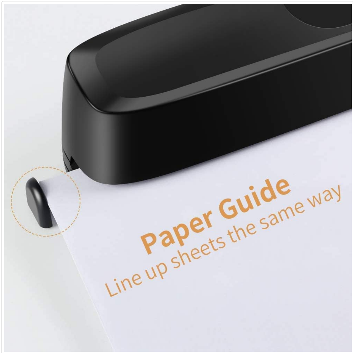
Image: Close-up of the paper guide in action, ensuring sheets are lined up correctly.