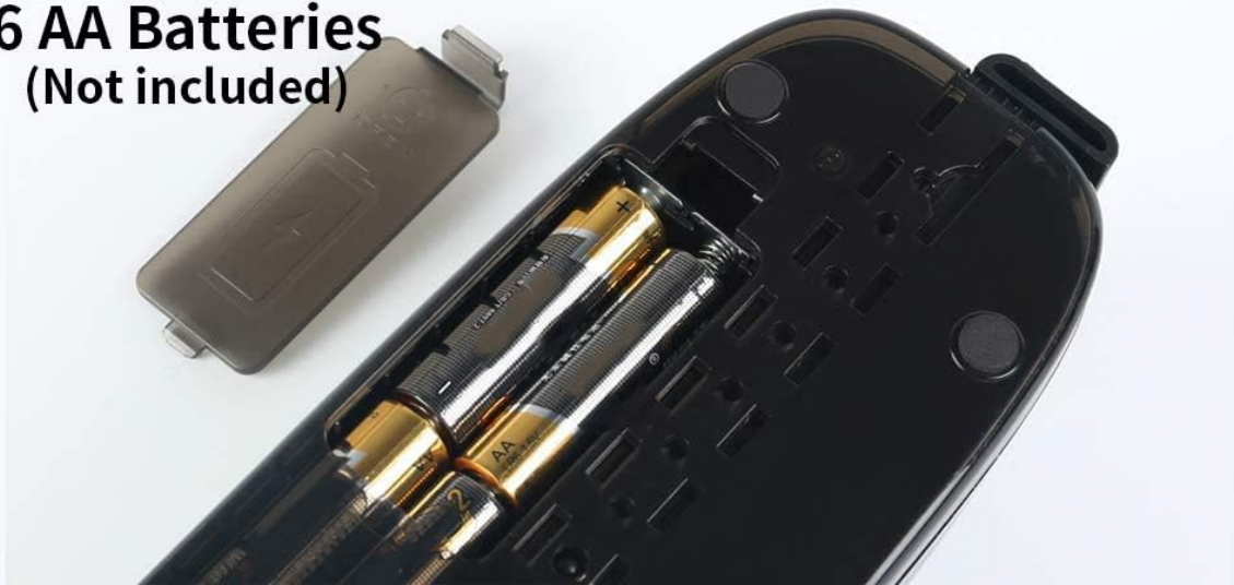
Image: The underside of the punch showing the battery compartment and the AC adapter port.